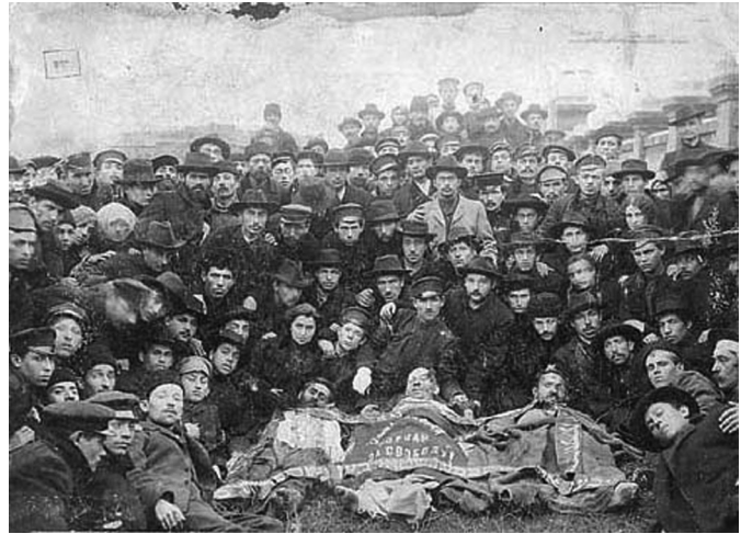
Ukrainian Bundists mourning members of their self-defense group who were killed in a 1905 anti-Tsarist uprising.

The Bund formed in Lithuania, Poland and Russia in 1897 — the same year as the first Zionist Congress in Basle, Switzerland — and initially demanded only equal civil rights for Jewish workers as individuals and an end to anti-Jewish discrimination. Over time, however, the Bund also sought recognition of Jewish national rights, though it remained unalterably opposed to Zionism. “[B]etween Zionist activity and Socialist activity,” declared Vladimir Medem, one of the Bund's foremost ideological leaders, in 1920, “there is a fundamental and profound chasm. . . . A national home in Palestine would not end the Jewish exile.