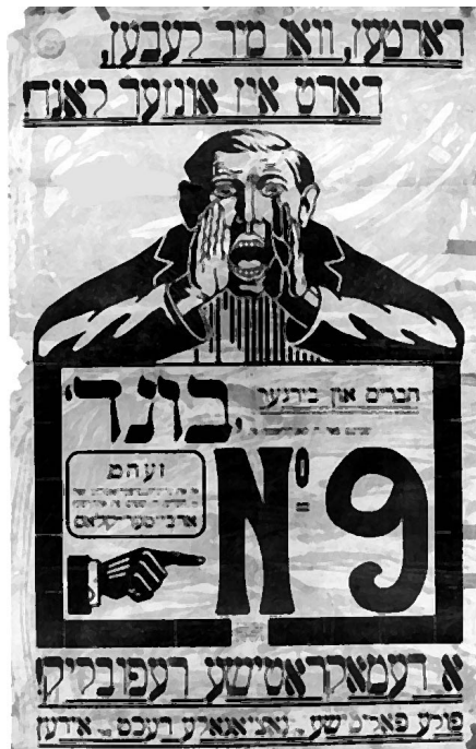
Jewish Labor Bund election poster

The Bund opposed assimilation, defended Jewish civil and cultural rights, and campaigned actively against anti-Semitism. However, the Bund's socialist universalism precluded support for the notion of Jewish national unity ( klal yisrael ) or for the narrow advancement of Jewish sectional interests. It eschewed any automatic solidarity with middle- or upper-class Jews and generally rejected political collaboration with Jewish groups representing religious, Zionist or conservative viewpoints. The Bund's famous anthem, known as "The Oath" ( di