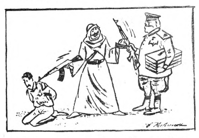
Contacts with local and foreign communists (Design of Behrendt in Het Parool, Amsterdam)

The central committee of the Communist Perty met to examine the situation, which they considered extremely dangerous. Until that point, the C.P. had refused to raise the banner of revolution against a government which it still considered "national and anti-imperialist." Nimeiry's speech of May 25 rendered this analysis indefensible and