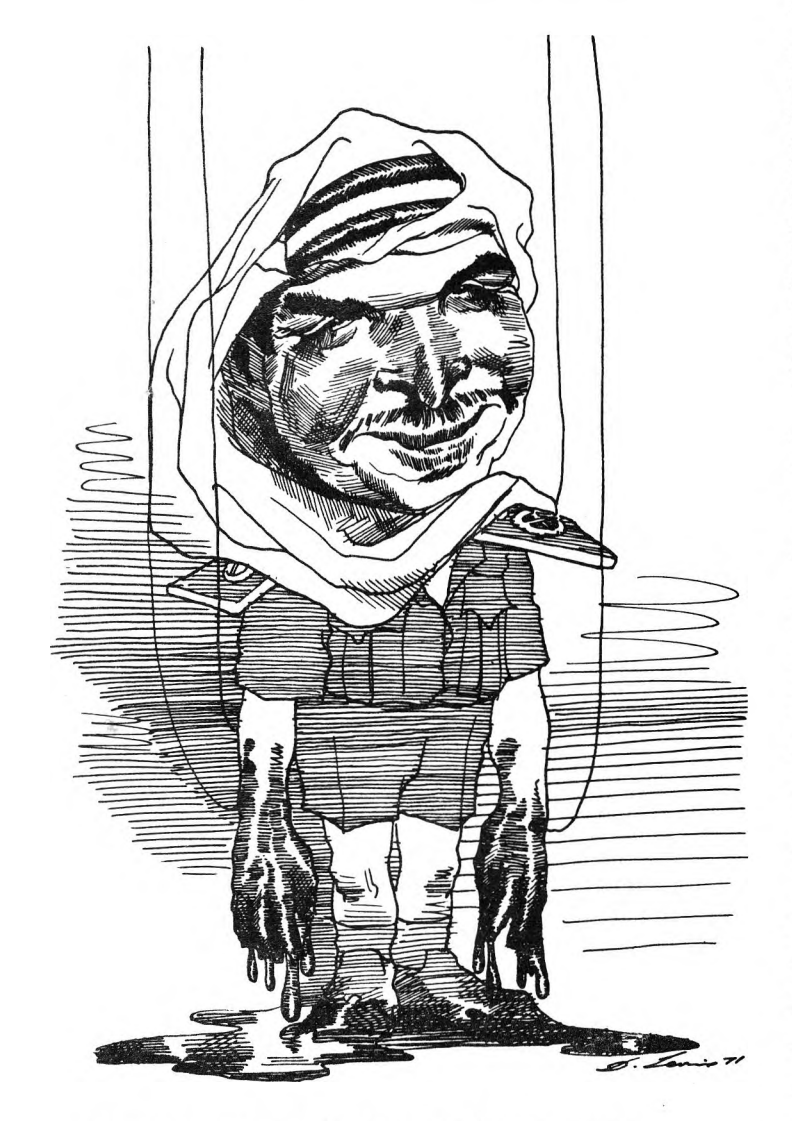
David Levine in the N.Y. Review of Books Oct. 7, 1971

But the scope of the reactionary alliance being forged in the wake of the repression of the Palestinian movement is not restricted in sig-