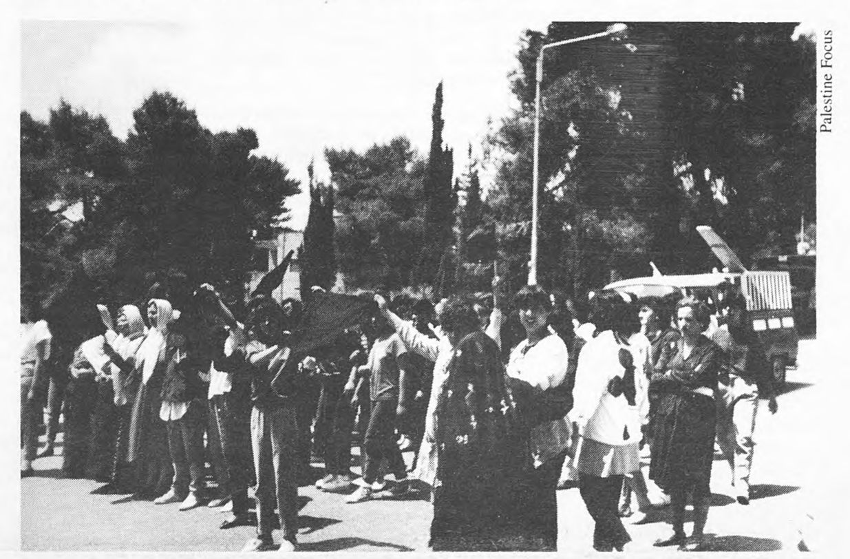
June 5 demonstration in Ramallah, West Bank, sponsored by the Union of Palestinian Women's Committees and the Union of Working Women's Committees. Part of many activities in the West Bank and Gaza commemorating the 20th anniversary of Israel's occupation. See article on page 3.

The second great danger is in Lebanon, where the dire necessity to defend the camps from attacks by Lebanese sectarian forces also demands unity. The PNC resolved to "strengthen the unity of effort, in order to organize the situation of our camps in Lebanon; the defense of their rights to exist; and the strengthening of the unity of our people under the leadership of the PLO, so that they can defend themselves and their camps in accordance with the Cairo Agreement and its amendments, which dictated the relationships between the PLO and the Lebanese govern-