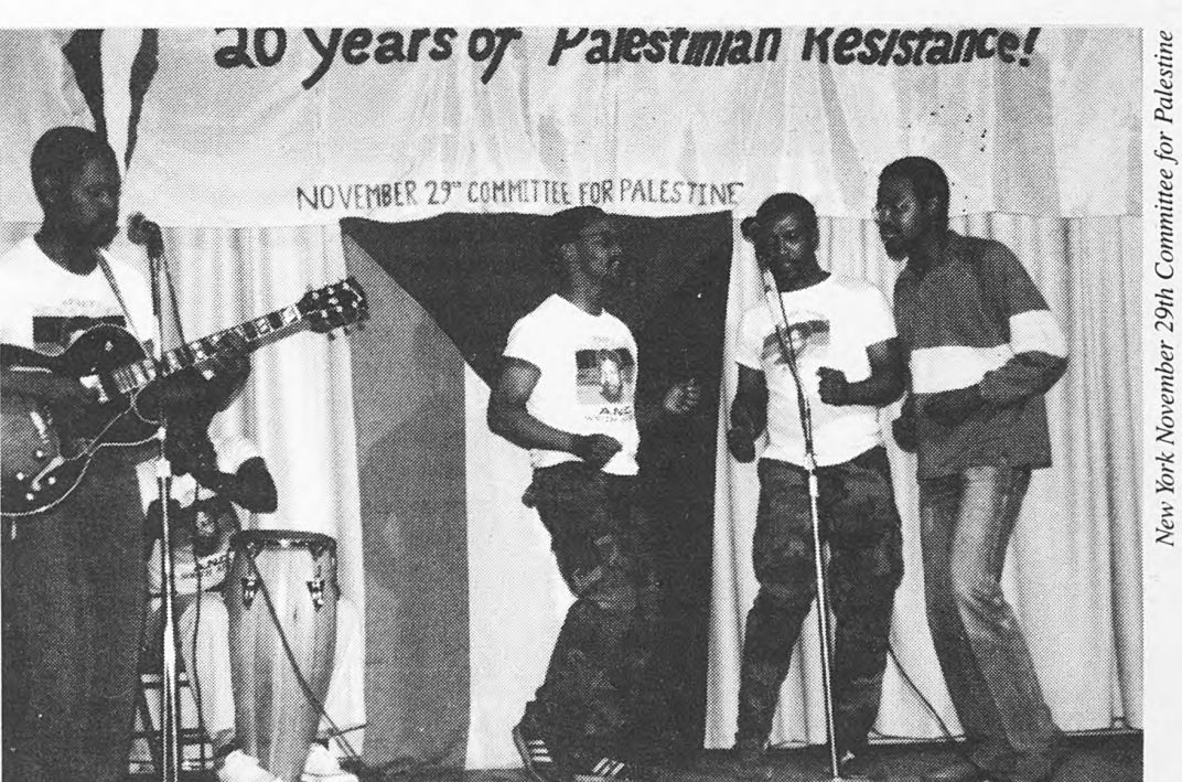
Sechaba, the African National Congress cultural group, performing at the June 6 New York event marking the 20th anniversary of Israel's occupation, sponsored by the November 29th Committee for Palestine.

In Boston, a film festival was held at MIT. On June 7 a program entitled "Speak Out Against 20 Years of Occupation; Speak Out for Peace and Justice in the Middle