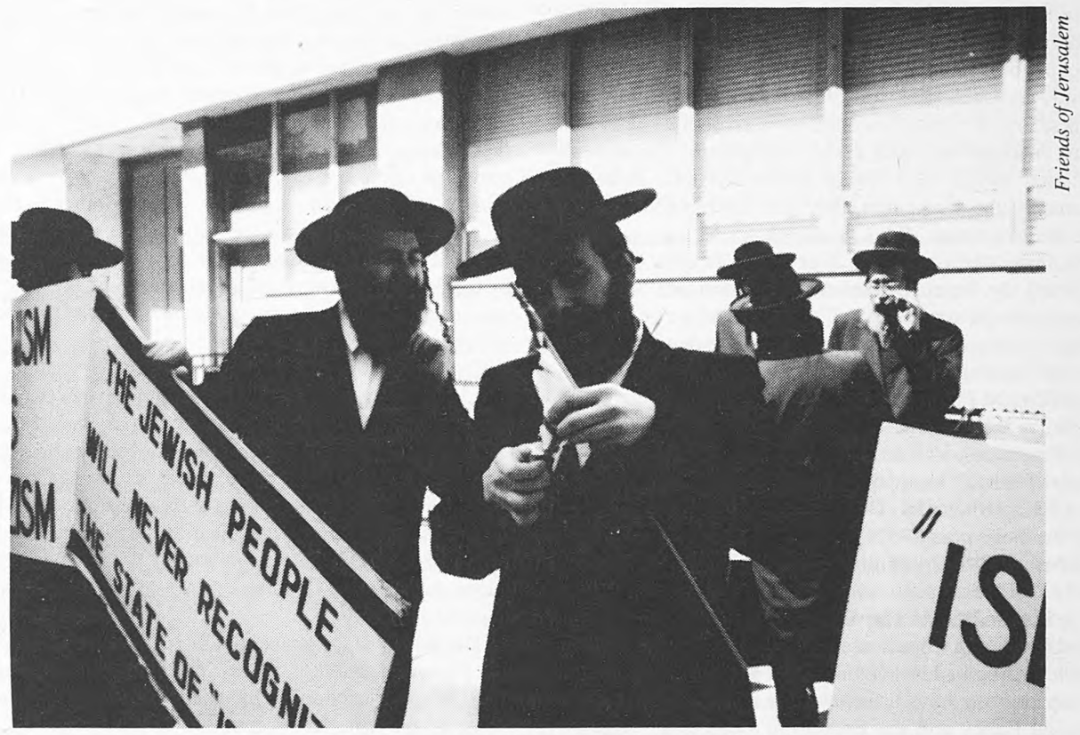
Anti-Zionist Orthodox Jews burning Israeli flag at counterdemonstration during New York's Israel independence day parade in May.

f the Americans or those who run international politics give a Palestinian state or a Palestinian-Jordanian state a franchise, then we would be more than just willing, we would fight to be included in that. An article of ours in Al-Fajr [Pro-PLO Palestinian newspaper published in Jerusalem] went something like this: Would the Neturei Karta disassociate itself from the PLO if the PLO recognized Israel? The PLO is at war with the Zionist establishment because of a material claim—lands taken away from them. Material-claims compromises may