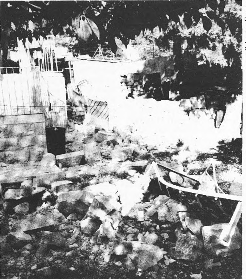
Partially demolished house belonging to West Bank Palestinian accused of resistance activity.

The United Nations has regularly censured Israel for these acts as gross violations of international law and the most basic rights of people. On December 1, 1948, the U.N. General Assembly passed Resolution 194, which instructs the government of Israel to facilitate the return of the 775,000 Palestinian Arabs who were illegally displaced from their homes on the creation of