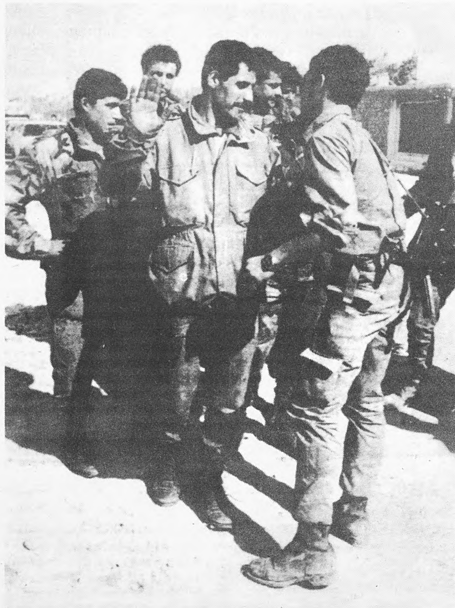
Israeli soldiers in action in Lebanon.

The basic position is that most of the Israelis very strongly believe that the existence of the army is vital for them to stay alive. It doesn't matter really if this belief is true or not, but it is quite clear that most of the people in Israel believe that if the army didn't exist or it was weak, the Arabs would come and kill us all. Nobody knows what would happen, but the feeling is that the army is the defender of the people in Israel.