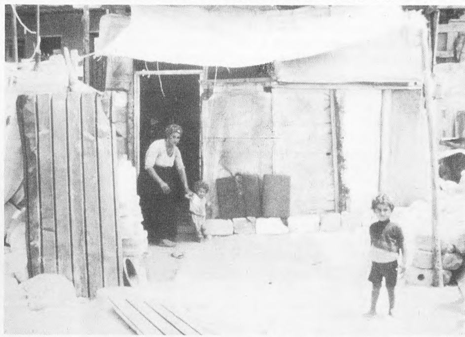
Black squatters camp in South Africa (top) and Palestinian refugee camp in the West Bank (bottom): Both peoples ghettoized and without rights in their own homelands.

with an average age of about 23. There were also people who were mothers of kids who were students at the university. For it to be said that they can't think independently was ridiculous. So they protested very, very strongly.