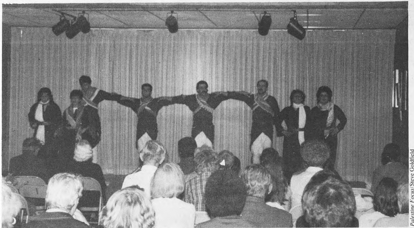
Traditional Palestinian Dabkeh dancers performing at U.S. Peace Council forum in San Francisco.

On May 11, about 150 people attended an evening of solidarity with Lebanese and Palestinian prisoners in New