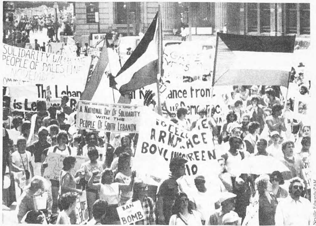
Middle East contingent in Washington, April 20, 1985.

If raising the "Israeli issue" seems troublesome or politically risky, that is precisely the political advantage for the United States to use Israel to implement policies abhorrent to most of the citizens of this country. So long as some hesitate to face the facts, the Reagan administration and its successors will be encouraged to use the Israeli loophole. □