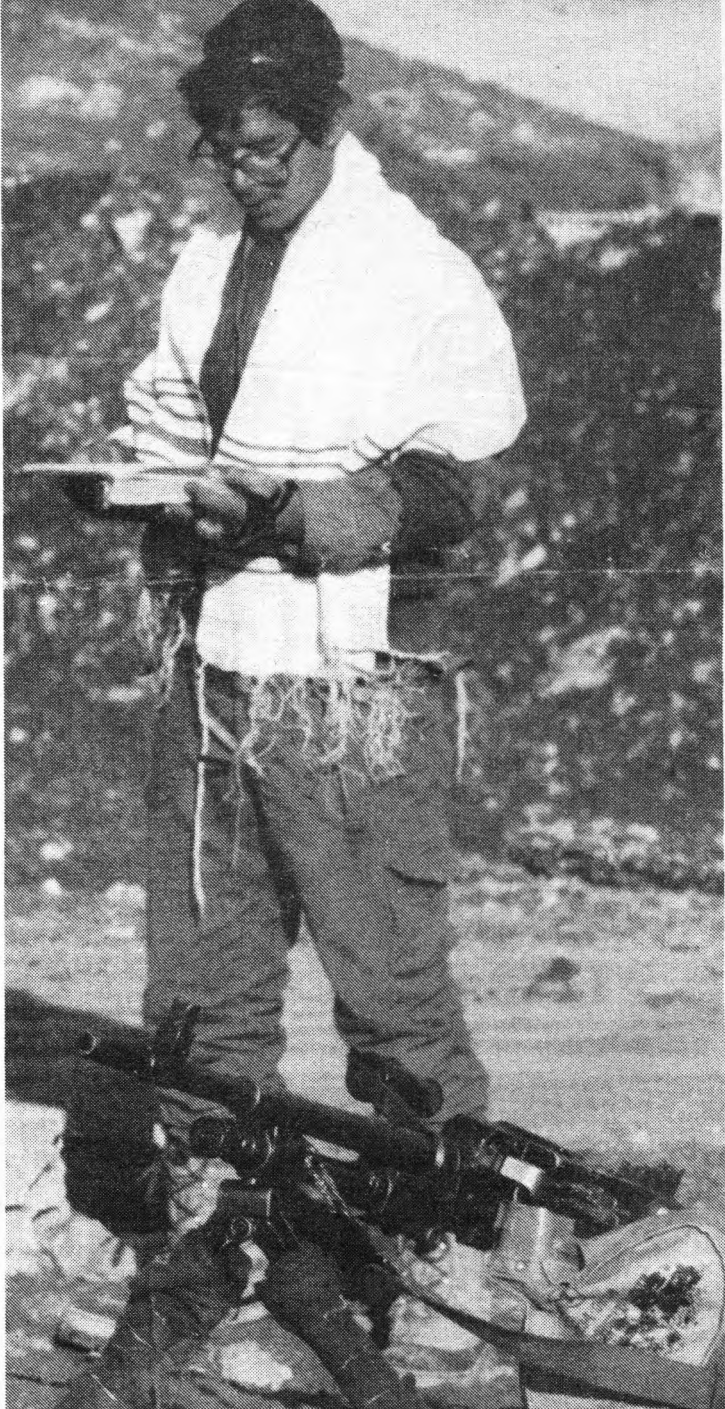
Front cover of Israeli army magazine: Orthodox soldier prays by his Galil in Lebanon.

ten new Jewish settlements for every such incident. When we have settled the land, all the Arabs will be able to do is scuttle around like doped cockroaches in a bottle."