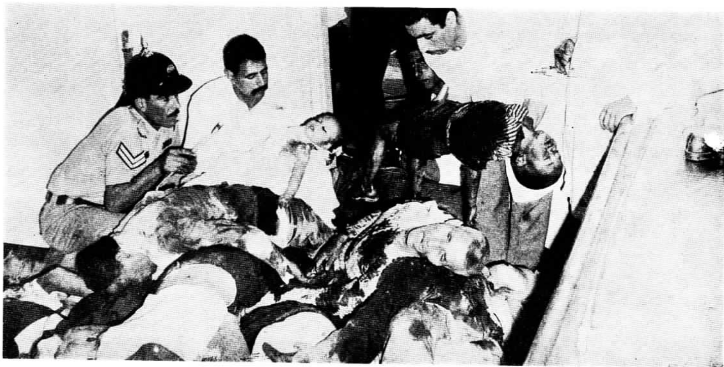
The «military targets» of al-Salt - in Jordan