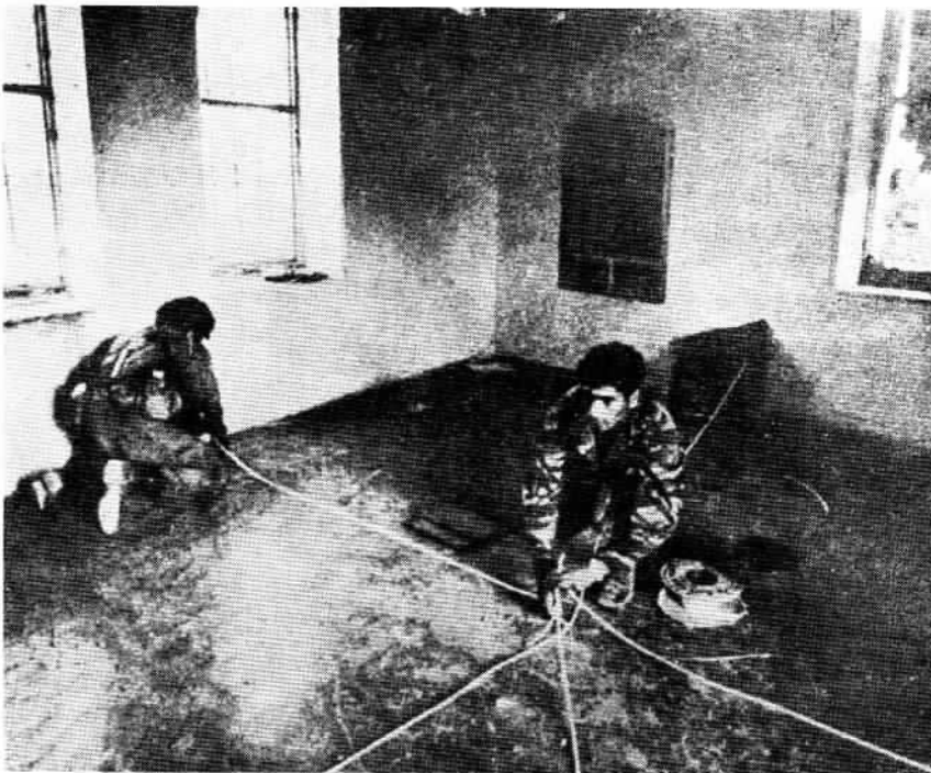
Israeli sappers preparing to blow up an Arab house —↑

Arab children, as their home is about to be dynamited, prepare to tremble » ↓