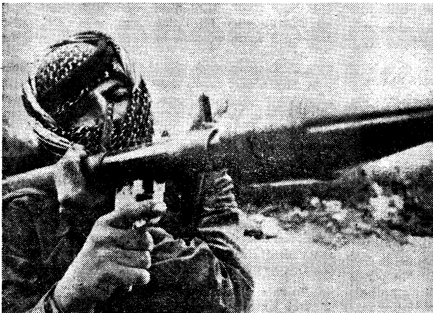
A Palestinian guerrilla fighter

The Palestinian guerrillas' scope of operation has spread everywhere in the Israeli-occupied areas and