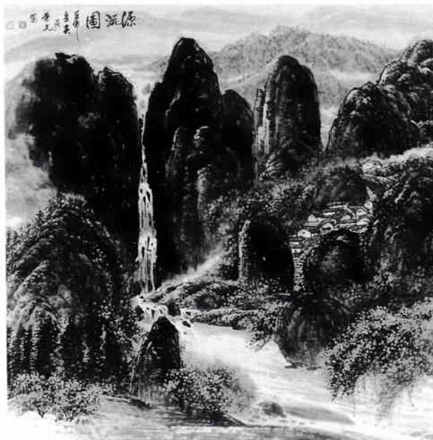
Mountain Village in the Spring.