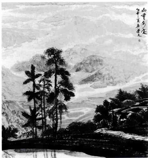
Vast River Flows Through Mountain Range.