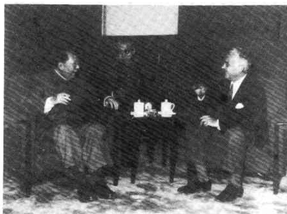
Mao meets Edgar Snow, a famous American journalist, in January 1965.