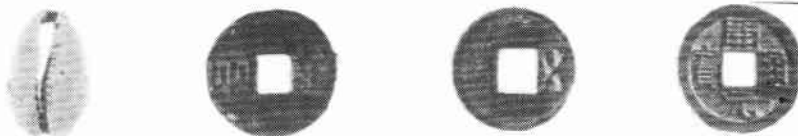
From left to right: Cowry shell. Banliang. Wuzhu. Kaiyuan tongbao.

Chinese use of money can be traced back to the Shang and Zhou dynasties (16th Century BC-221BC). The earliest type was cowry shells. However, with the development of a commodity economy, there were not enough to satisfy market demand, so