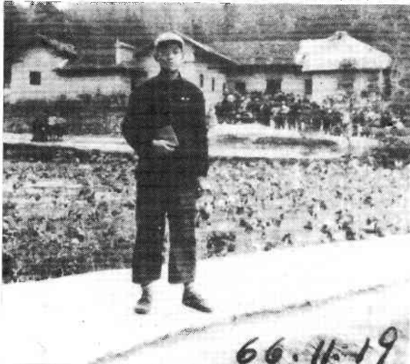
The author in front of Mao's old house in 1966 (left) and in 1993.

The most notable change to come out of Deng's revolution is the increase in people's wealth.