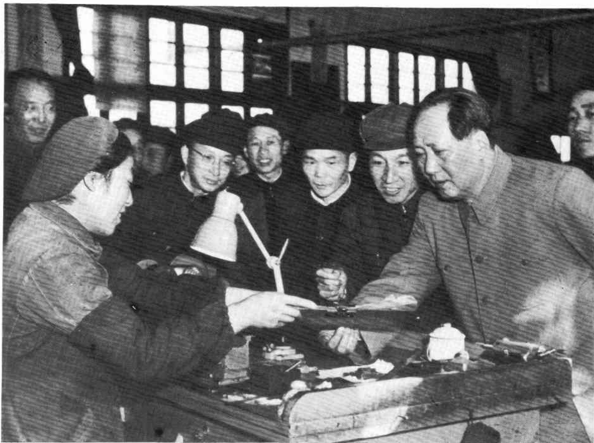
Mao Zedong (first right) visiting the Nanjing Radio Factory in 1956.

has over the years collected 15,000 Mao badges in 2,000 varieties. These badges were made throughout China and many were produced by various military areas of the People's Liberation Army of China. The man has turned a 20-square-meter room in his home into a display space for his incredible collection. Its uniqueness has earned him considerable fame and mention in the Guinness Book of World Records .