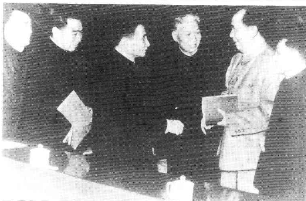
Mao Zedong with other state leaders in 1962.