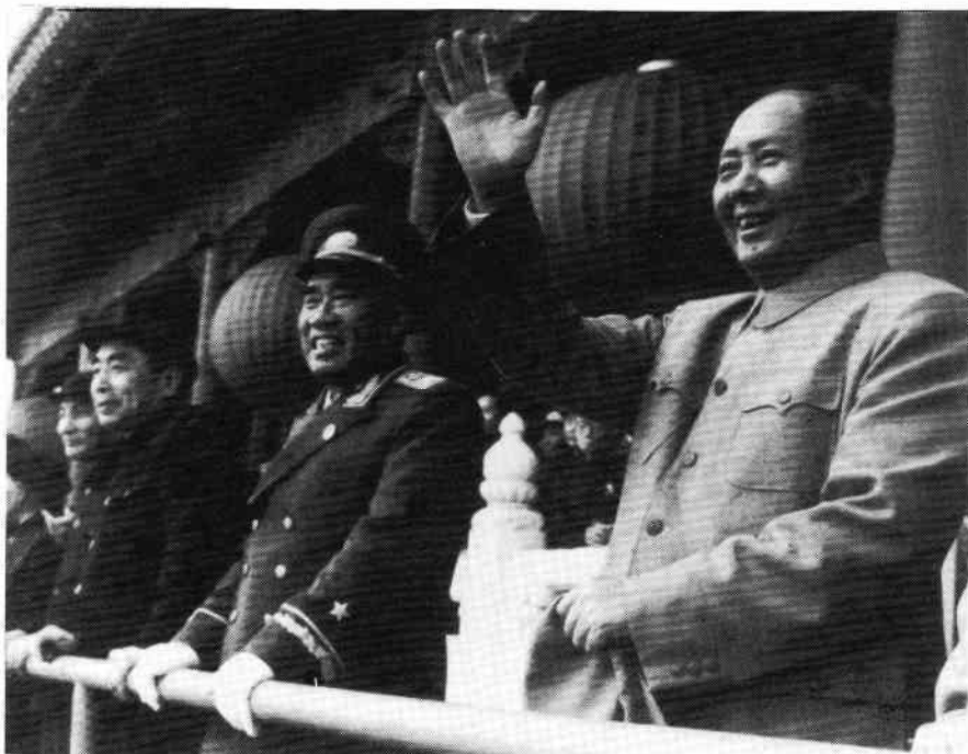
Mao Zedong, Zhu De and Zhou Enlai (right to left) in 1955.