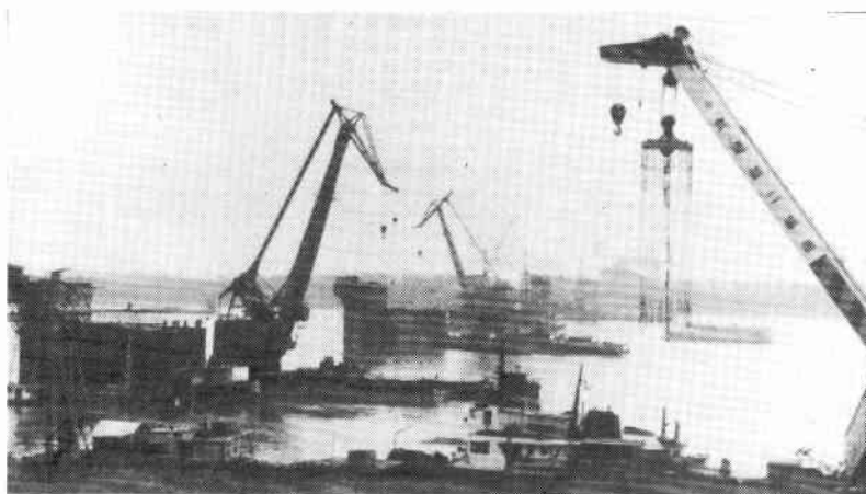
A foreign trade dock at the Huangshi Harbor.

—Huangshi has a highly skilled scientific and technological work force working within a technologically advanced system. The 80,000-odd professional technicians in various sectors ac-