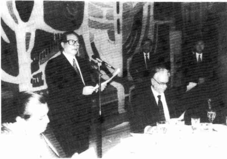
President Jiang Zemin delivers a speech at a banquet hosted in his honor by Brazilian President Itamar Franco in Brazil.