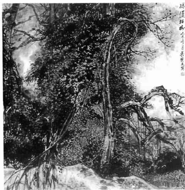
Dense Forest Surrounds Secluded Village.