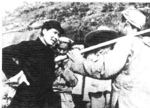
Mao and Yanan peasants in cordial conversation in 1939.