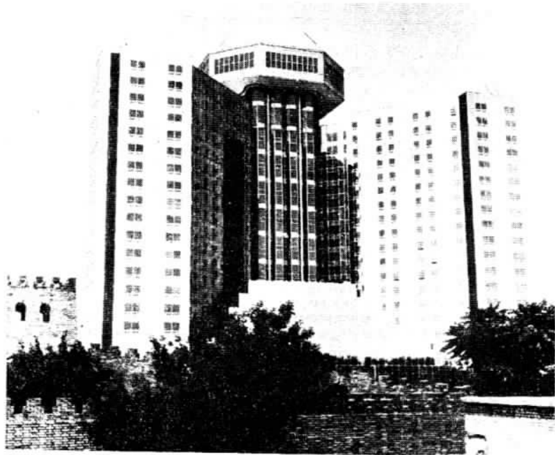
The Great Wall Hotel.

It has a banquet hall for 1,000 people and 12 smaller dining rooms. There are also nine restaurants serving Chinese and Western food.