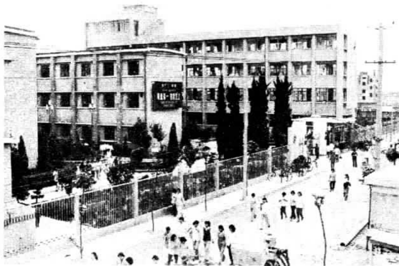
The new factory building of the Haiyan Shirt and Blouse Factory was built with its own accumulated funds.