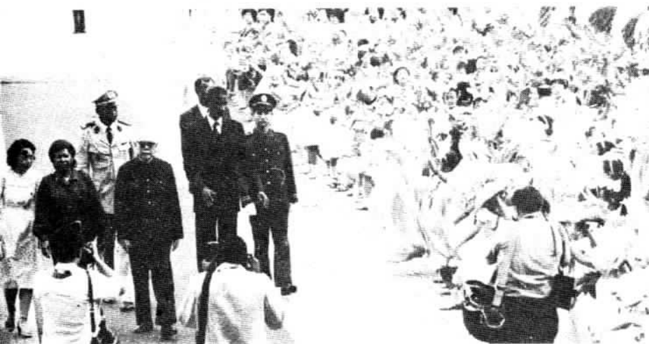
At the gala welcoming Senegalese President Diouf in Beijing.