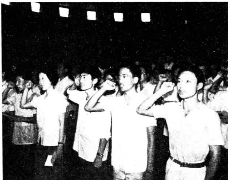
New Party members from Beijing middle school students taking the oath.

Institutes of higher learning across the country have also worked to recruit Party members among students. About 10,000 university and college students have joined the Party in the past few years. Two thousand Beijing college students and postgraduates got their memberships last year.