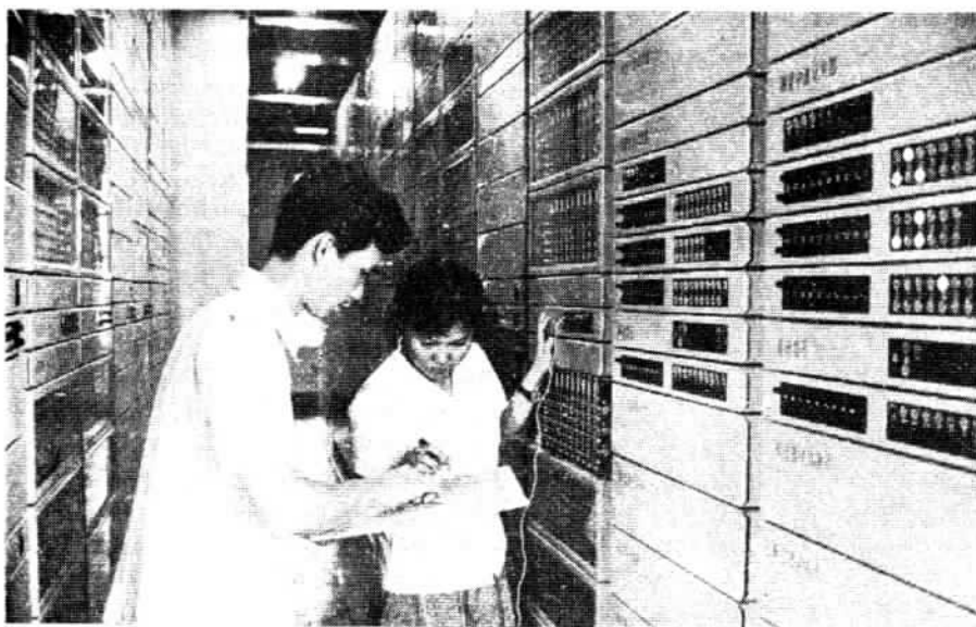
Technicians at work in an automatic telephone switchboard room in Haikou.

There are scheduled flights from Haikou to Guangzhou and Zhanjiang. Shipping lanes link the island with all major ports on the mainland and in Southeast Asia. There are more than 14,000 kilometres of highways, up 11-fold from 1952. A post and telecommunications network links the island with the rest of the world. Social welfare facilities and living standards have also been greatly improved. Hainan has four institutions of higher learning, more than 500 middle and vocational schools, and nearly 5,200 primary schools. More than 95 per cent of school-age children attend classes. The island has more than 3,500 public health institutions, including about 460 hospitals with 18,600 beds, a 19-fold increase over 1952. □