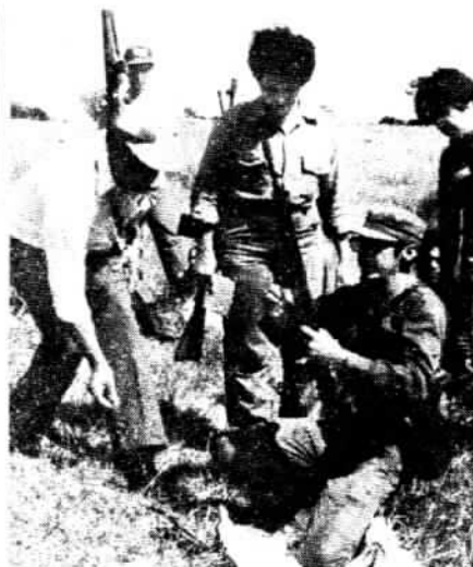
Left: Youth gathering in commemoration of fallen comrades-in-arms. Right: Militia receive training.

the opposition does not consider these enough. They say that a national dialogue should be held among all Nicaraguans before the election, including rebel leaders still fighting the government from abroad. The government refuses to accept this proposal, considering the armed rebel leaders traitors, and saying there would only be a dialogue of bullets.