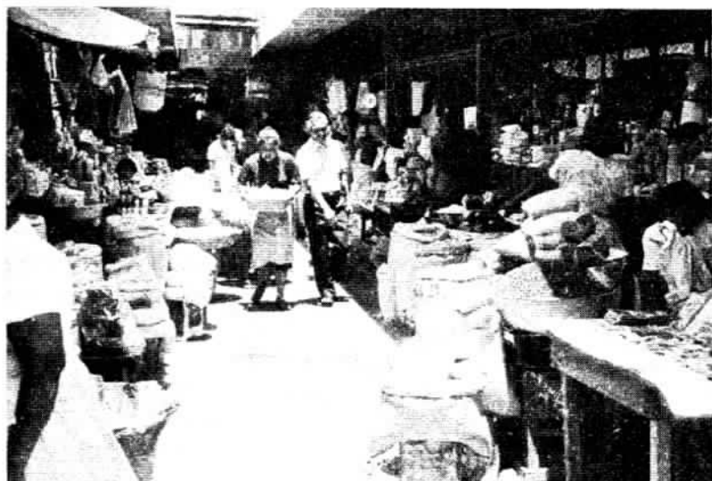
Country fair in Masaya.

The big topic in Nicaragua today is the coming elections for a president, a vice-president and 90 members of a national assembly. To create suitable conditions for the election, the government has taken some conciliatory measures, proclaiming an amnesty, releasing Miskitos Indians from prison, and giving the right to vote and hold political office to most citizens abroad and in exile. However,