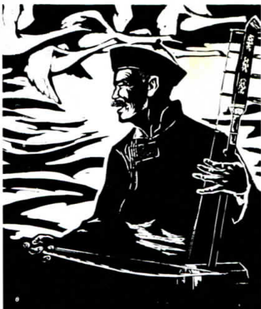
A Musician in the Grasslands.