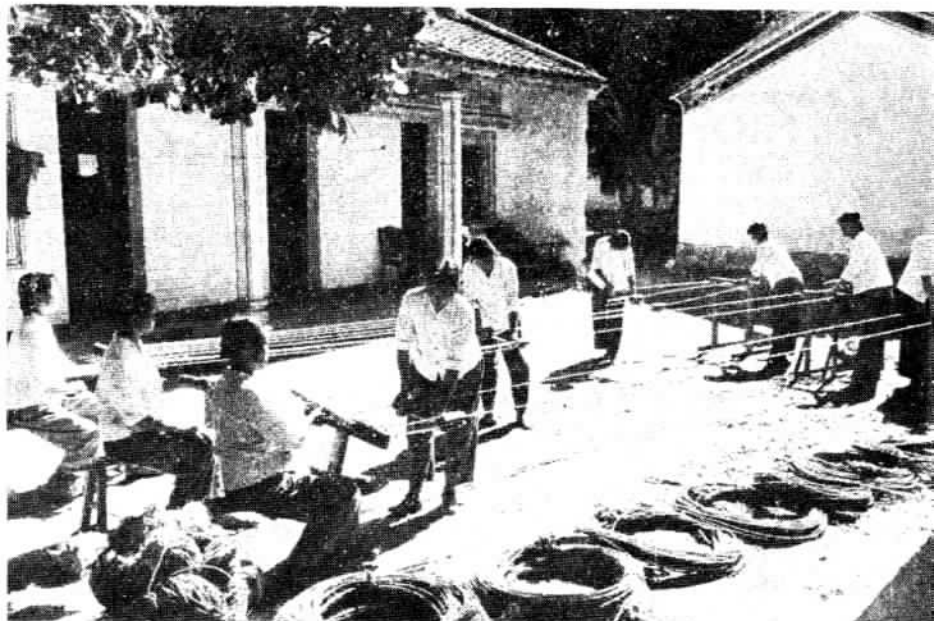
The Wenchang peasants spin ropes from cocofibre.

"At present, Hainan Island has a rubber planting area of 267,000 hectares," said Huang. There are