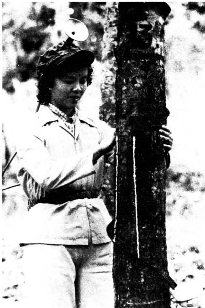
Tapping rubber with pins.

"Rubber was originally produced in the tropical forests of the Amazon basin," Huang explained. "Before liberation, there were