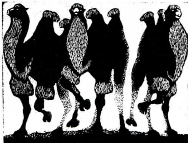
Camels — Ships of the Desert.