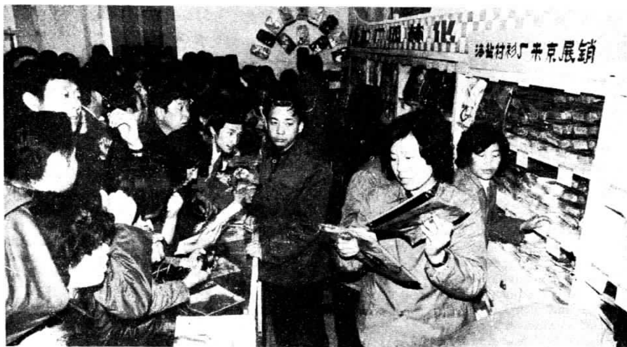
The Haiyan Shirt and Blouse Factory's products are popular among customers at a sales exhibition in Beijing.

495,000 yuan to the state in taxes and profits, 2.3 times as much as what it kept for itself. In the seven years from 1977 to 1983, it handed in almost 2 million yuan to the state, about 22 times as much as it did in the two decades from 1956 to 1976.