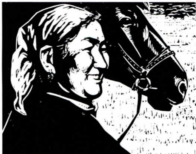
A Mongolian Woman.