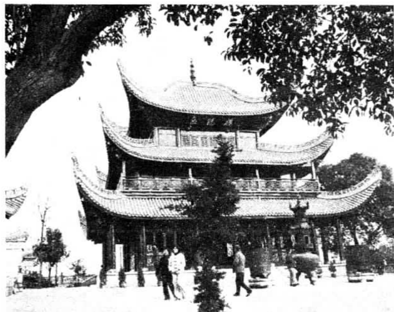
The ancient Yueyang Pavilion after rebuilding.

China will publish the third list of 300 key historical sites for state protection, and decide on the sec-