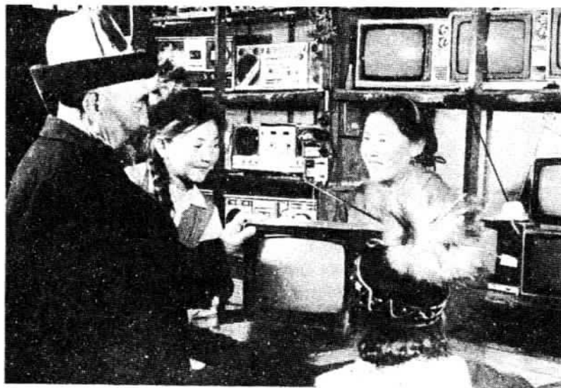
Herdsmen of the Yili Kazakh Autonomous Prefecture in Xinjiang buy TV sets.

But the economic development in minority areas would be impossible without help from the state. From 1950 to 1982 the state invested 77.700 million yuan in minority areas.