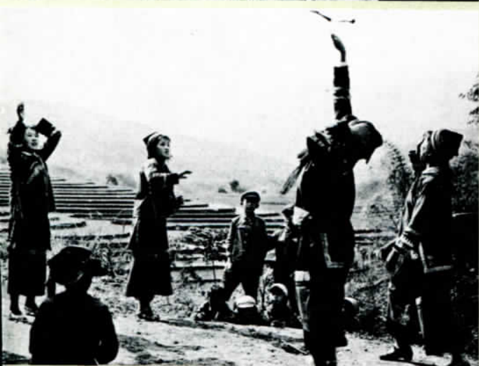
Kucong girls kicking a chicken-feather shuttlecock.