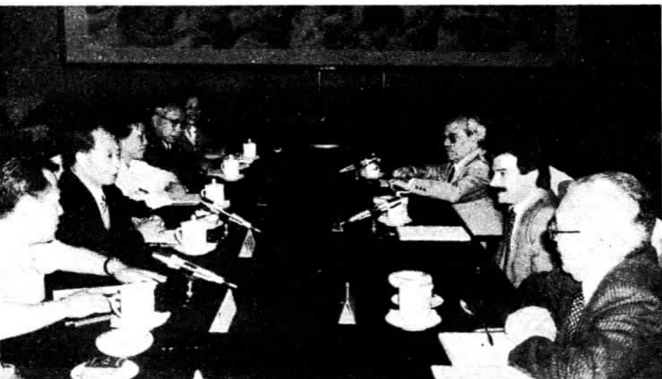
General Secretary Hu Yaobang (second from left) holds talks with Spanish counterpart Gerardo Iglesias (second from right).