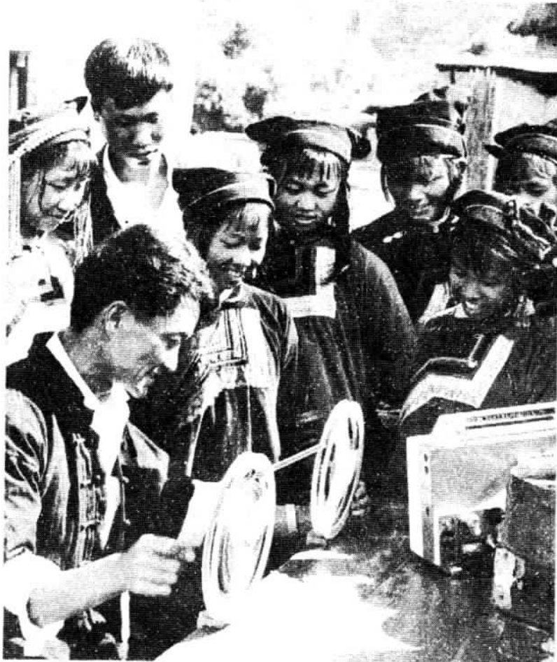
A film projection team member of the Hani nationality in Yunnan Province gets ready to give a show.

stance, Tujia nationality has jumped from 545,000 people in 1964 to 2,833,000 in 1982, the average annual increase being as high as 9.8 per thousand. This is partly due to the large number of people who reidentified themselves.