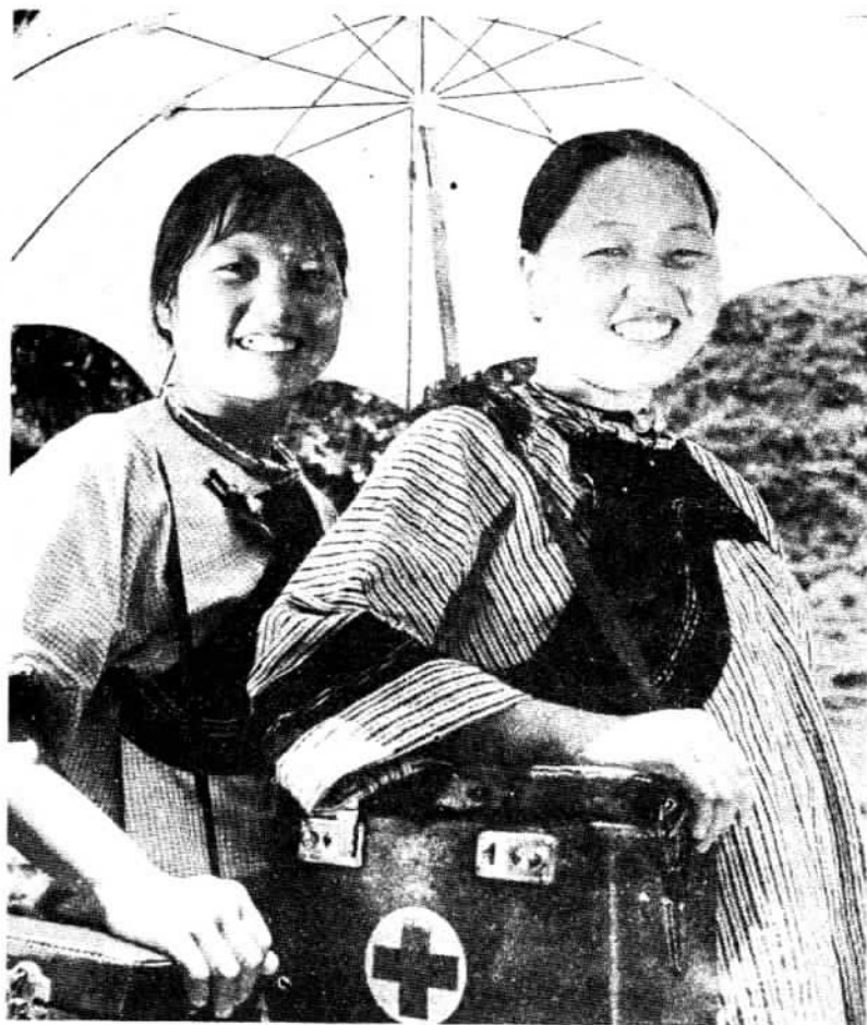
Two Miao doctors in Hunan on their way to visit their patients.

velop the special characteristics and merits of each group. This will also help increase the minority population, raise their cultural levels, thereby contributing to the common prosperity.