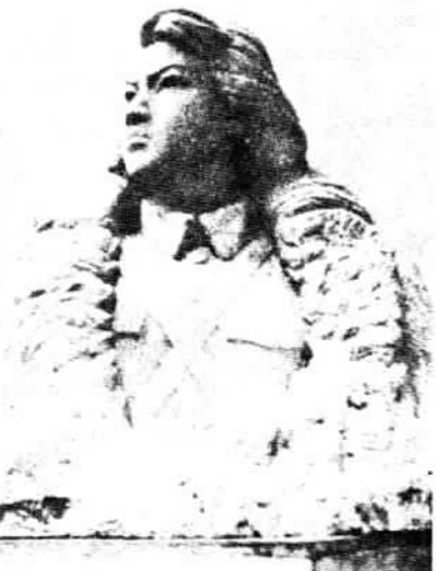
The statue of Zhao Yiman (1905-1937), a revolutionary martyr who was executed by Japanese invaders during their occupation of northeast China.