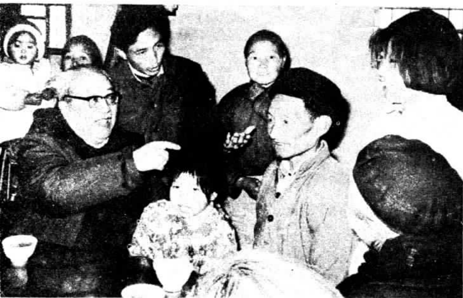
Fei Xiaotong chatting with a peasant family about their income.

towns directly under the jurisdiction of the county government. Each town has commercial departments set up by the town and nearby communes. Of these, Songling, the seat of the county government, also has county commercial departments.