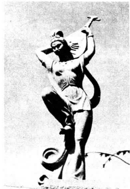
Playing pipa behind the back.

and profiles of cement slabs are used to evoke the imagination and