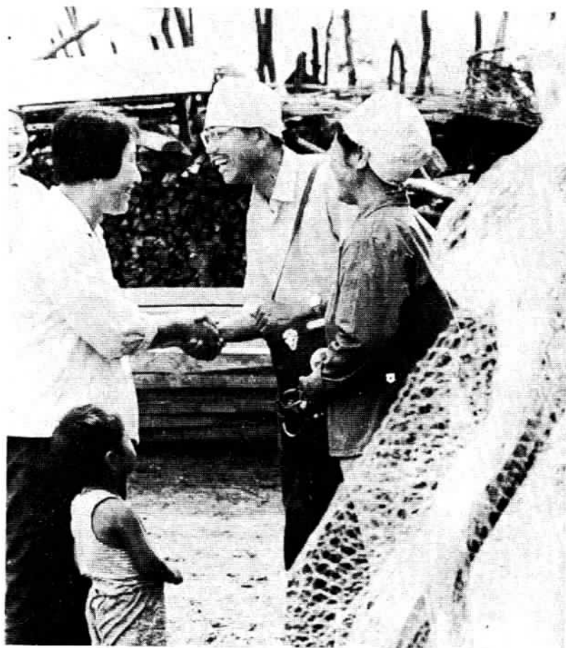
A Hezhe woman (left) thanks a doctor from Jiamusi city in northeast China who successfully treated her.

There are three major reasons for the big increase in the national minority population. First, after the democratic reform and socialist transformation, the policy of equality for all ethnic groups was implemented. Unity and prosperity was encouraged by eliminating class exploitation and discrimination. One hundred and seven autonomous regions, prefectures and counties were set up all over China. The self-government bodies established in these areas