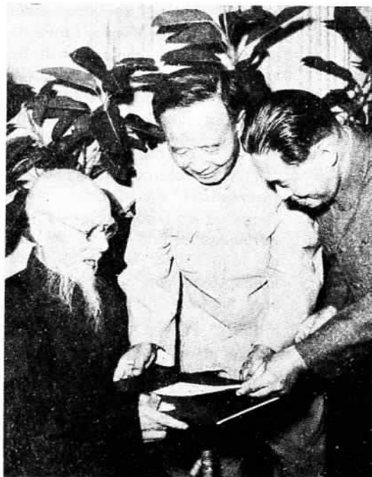
Guo Moruo (middle) and Mao Dun congratulate Qi Baishi when the artist was awarded the International Peace Prize in Sept. 1956.