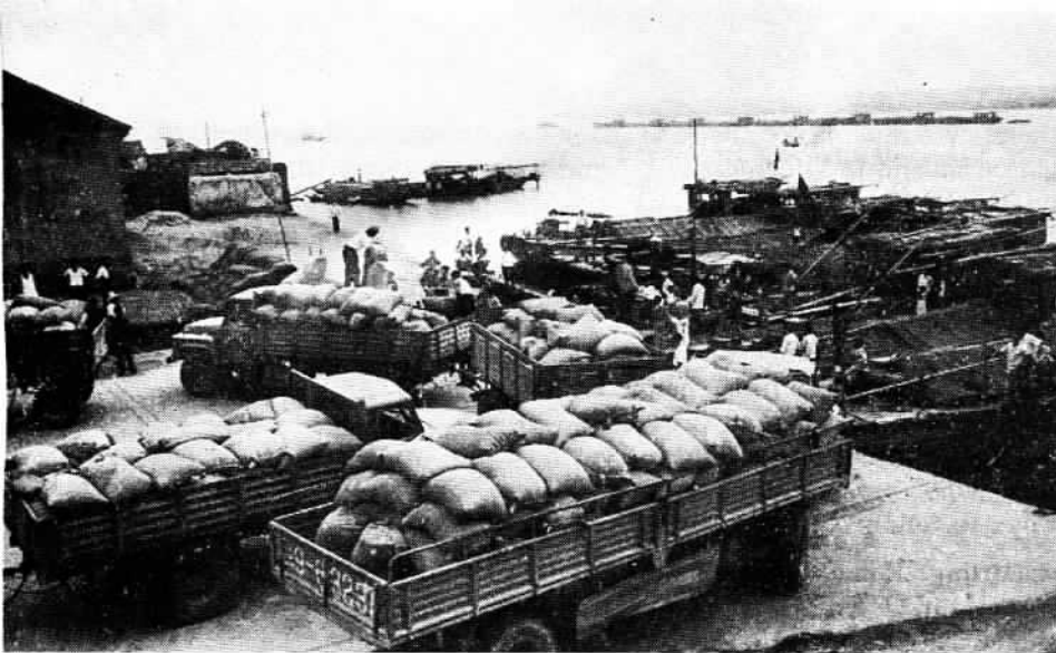
Peasants from the formerly poor Xuyi County load surplus grain to be shipped to other parts of the country. Income from the collective has quadrupled since the adoption of the production responsibility system in 1979.

• Law enforcement agencies are to provide protection for richer peasants who have prospered through their own efforts.