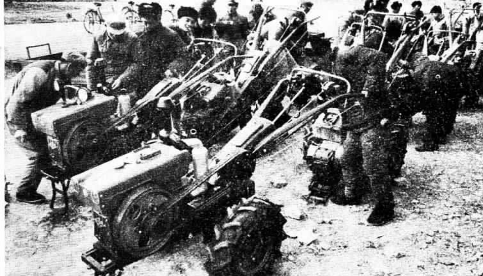
Peasants choosing walking tractors.

tive fund reserved by the collective must not exceed 15 per cent of its income and that the expenses on families of revolutionary soldiers and martyrs should be drawn from the public welfare fund. However, some commune and brigade officials, under various pretexts, have raised the money directly, putting a heavy burden on the peasants.