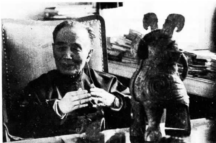
Guo Moruo in his study.

Among the materials celebrating Guo's 50th birthday was the noted speech of Zhou Enlai: "Lu Xun [1881-1936] was the leader of the New Cultural Movement, and Guo Moruo is a major fighter of the movement. If we see Lu Xun as the vanguard blazing the trail, then Guo Moruo must be seen leading the rest of us along that trail."