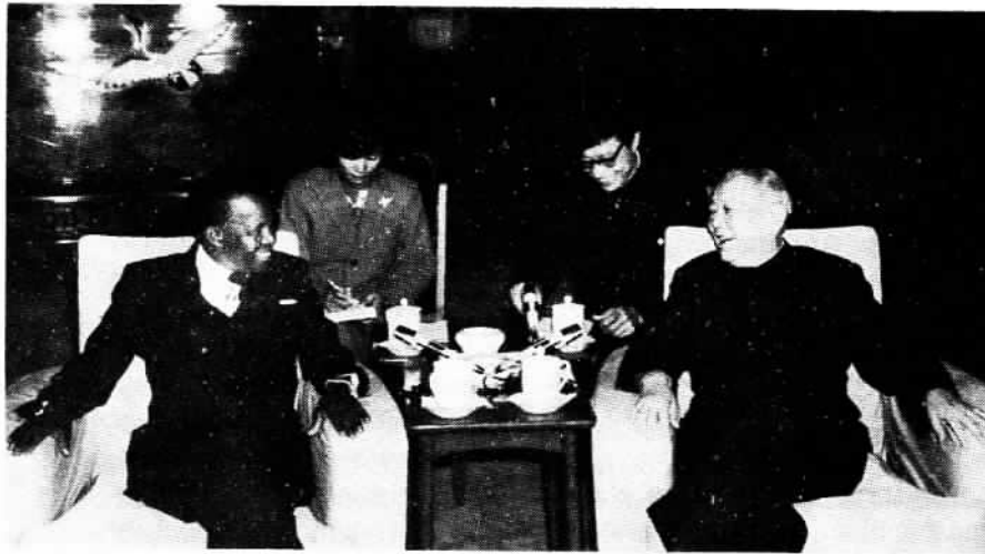
President Li Xiannian meets with President Masire.