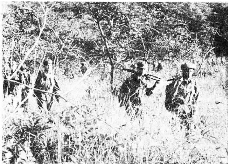
Democratic Kampuchean troops set out to attack Vietnamese positions in the rainy season.