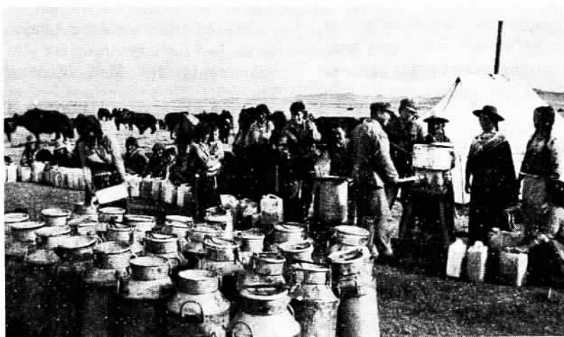
Tibetan herdsmen sell milk to the state.

But recently the rural economy in these areas has picked up. Calculating according to 1980 constant prices, agricultural output was valued at 28.1 billion yuan in 1982, up 33.7 per cent over 1978. Grain output reached 37.45 million tons, up 19.9 per cent against 1978. Two and a half times more cotton was produced in 1982 than in 1978, and oil- and sugar-bearing crops as well as other cash crops more than doubled their output.