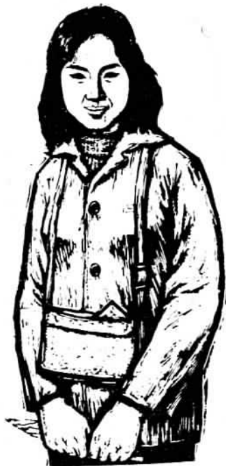
A Bus Conductor.