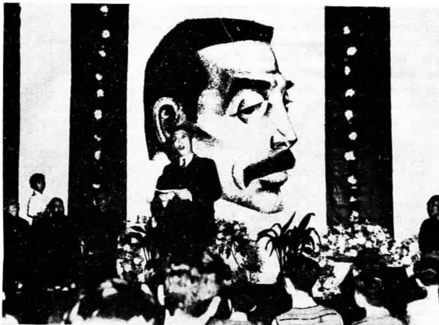
Guo Moruo delivering a speech "Lu Xun Is With Us" at a meeting commemorating the 10th anniversary of the death of Lu Xun in Shanghai in October, 1946.