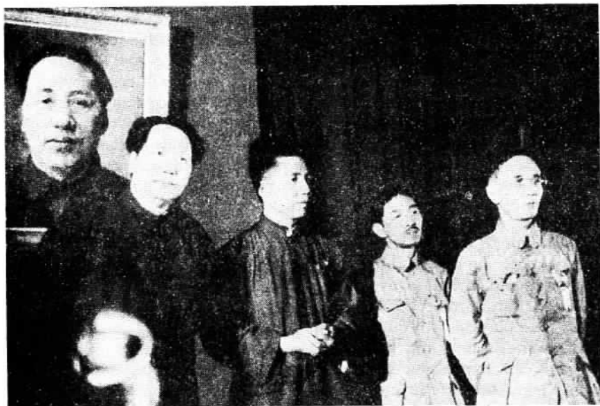
Guo Moruo (first from right) with Chairman Mao, Zhou Yang and Mao Dun (from left to right) when he was elected chairman of the All-China Federation of Literary and Art Circles in July, 1949.

In his book A Study on Ancient Chinese Society , published in 1930, Guo Moruo said there was a stage of slave society in Chinese history, which grew from the primitive society and was later transformed into the feudal society. This provided evidence for the Marxist law of development of human society, and served to strongly refute those who resisted Marxism at the time and opposed revolution under the pretext that "the situation in China differs from other countries."