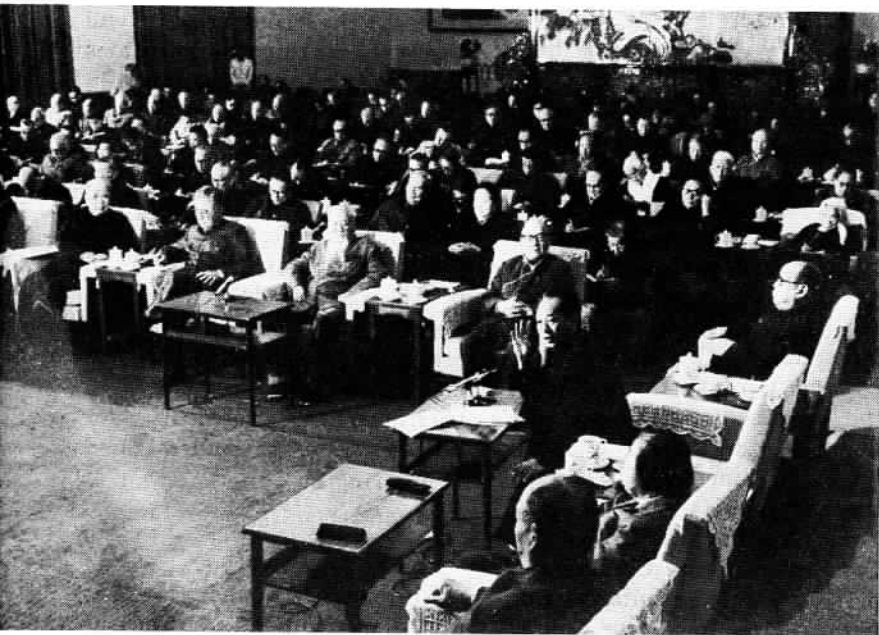
Hu Yaobang speaks to the forum for non-Party public figures.

Representatives to the meeting unanimously adopted the