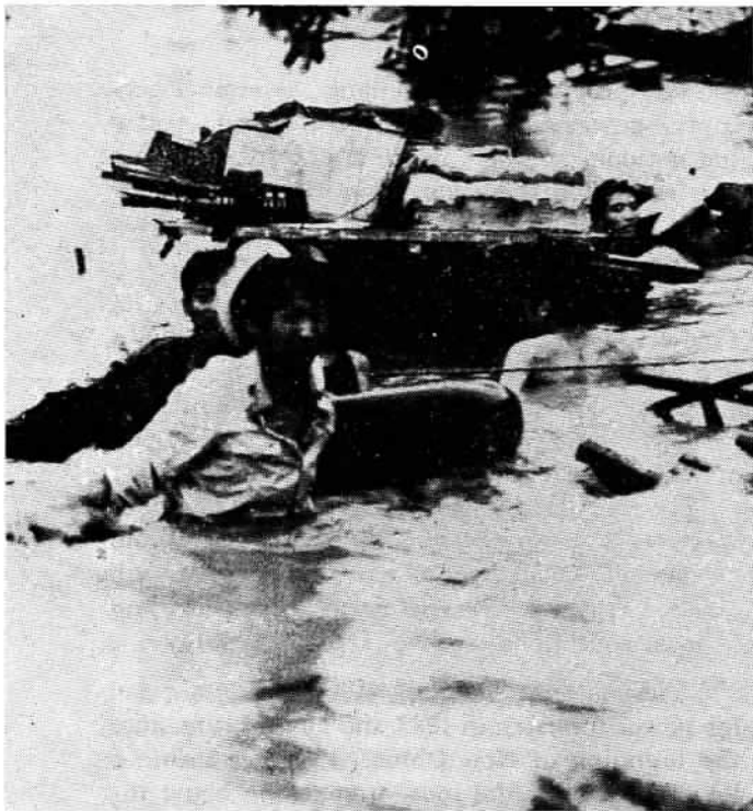
Policemen help the flood victims evacuate their homes in Ankang County, Shaanxi Province, last summer.

harvest of rice in the five provinces, the most important rice-producing area in China, was greatly reduced. The reduction, however, was offset by a bumper harvest of summer crops in the country as a whole. Coupled with efforts to fight natural disasters and minimize losses, the annual grain output this year is expected to surpass that of last year, which was an all-time high itself. The total value of agricultural output might also increase.