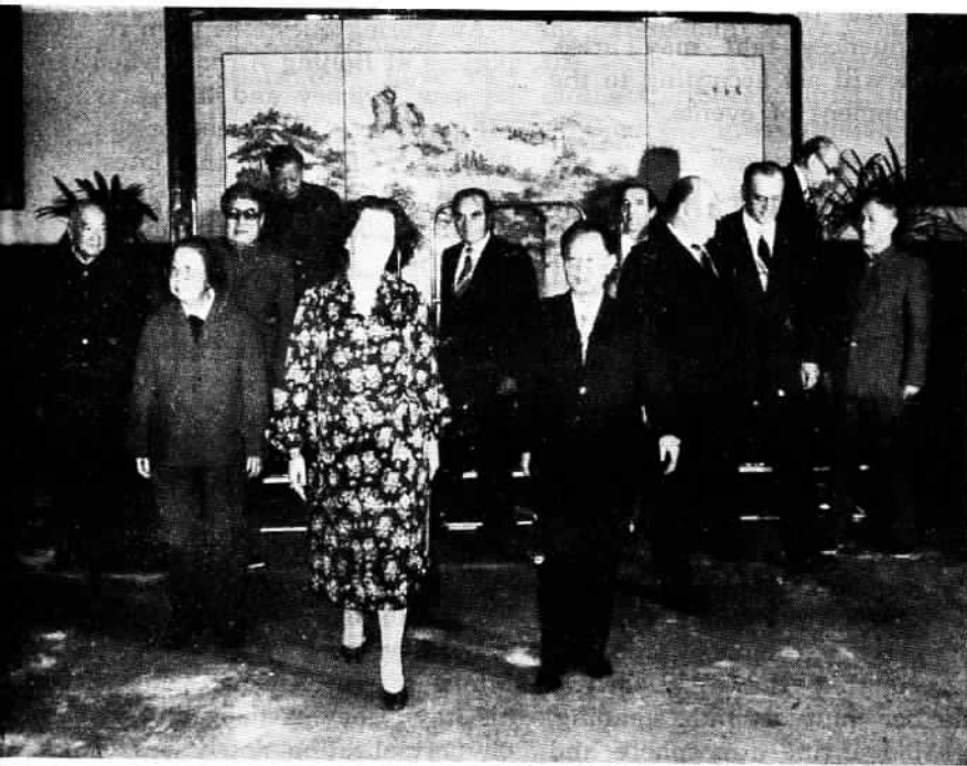
Hu Yaobang meets Tamara Dobrin and her delegation.