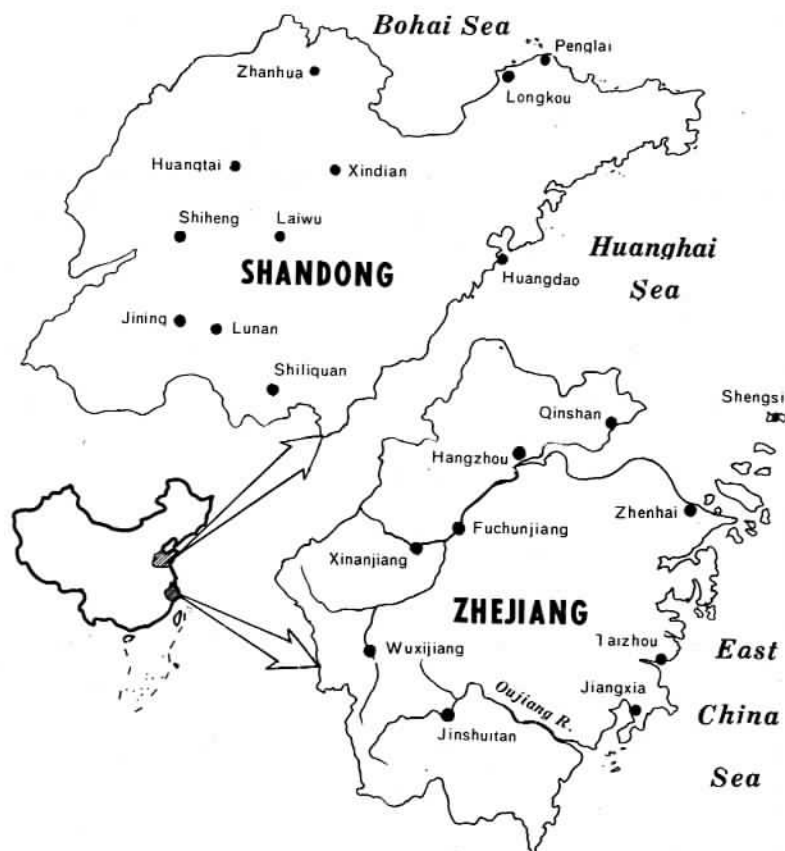
Locations of Major Power Plants in Shandong and Zhejiang Provinces

Since 1979, the provincial power bureau has been developing thermal and hydroelectric stations side by side and building big, medium-sized and small ones simultaneously. Bringing in fuel through local seaports, the bureau has built two large thermal power plants with a