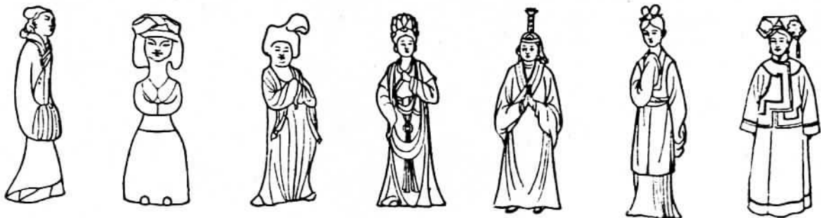
Clothing of ancient Chinese women in each dynasty (from left to right): Han, Wei, Tang, Song, Yuan, Ming and Qing.