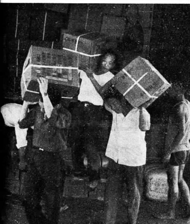
Disaster relief materials are rushed to afflicted Ankang.

At present, people in the affected areas are making efforts to restore production and rebuild their homes. Most of the water conservation, communications and telecommunications facilities which were damaged by the flood were repaired and returned to use within two months after the floods.