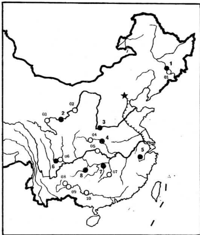
Large Hydropower Stations Being Completed

The Longyangxia project on the upper reaches of the Huanghe River has a 177-metre-high dam which forms a 400-square kilometre man-made lake with a storage capacity of 26,800 million cubic metres on the northwest plateau. The lake can regulate the river run-off. The Longyangxia power station has a designed generating capacity of 1.28 million kw. The completion of the project will play an important