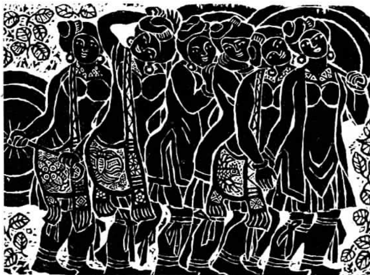
Holiday Makers in a Dong Nationality Village.