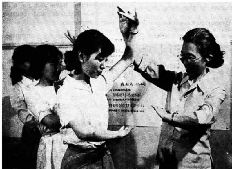
Kang Jianqiu (right), deputy director of the women's section of the Wuhan municipal committee of the China Democratic National Construction Association, works in a normal school for nursery teachers.

As a result of uneven economic development, there is a big gap between China's developed and underdeveloped areas. Most of the backward areas are mountainous or border regions