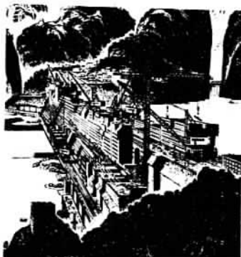
A Hydropower station under construction.

China plans to quadruple its electric generating capacity in the next 20 years. A correspondent looks at the nation's rich hydropower resources, existing power stations and plans for future use of water power (p. 14). A report from Shandong and Zhejiang shows how the provincial governments are speeding up electric power development (p. 16).