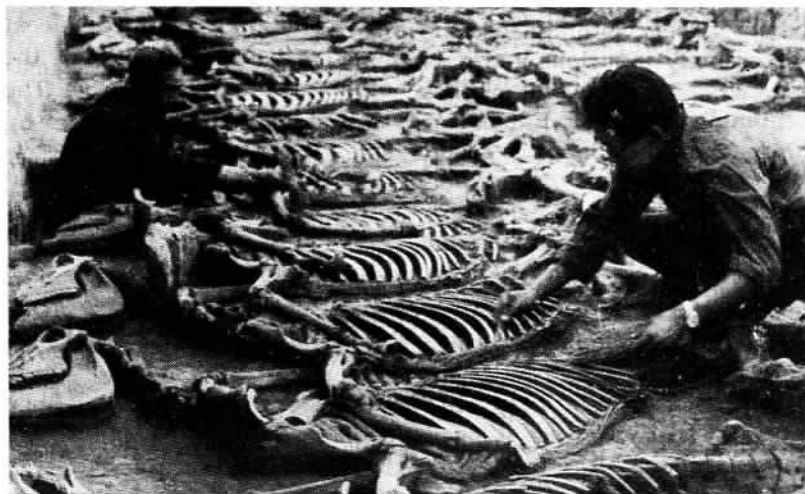
Preparing the horse skeletons for exhibition.

Excavations began at the site in 1979. Eighteen other archaeologists have also inspected the site.