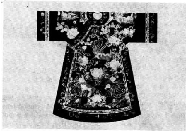
The phoenix robe design worn by the Queen in the Qing Dynasty (painted according to the preserved relic).

The designs adorning clothes were usually geometric repre-