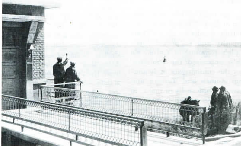
A medium-sized reservoir built in the Inner Mongolian Autonomous Region for irrigating the grassland.

A recent survey in Beijing shows that water used in industrial production in the city has risen 46-fold in the last 28 years; the amount of water used in Tianjin, Shenyang, Fushun and other major industrial cities averages 80,000 million cubic metres a year.