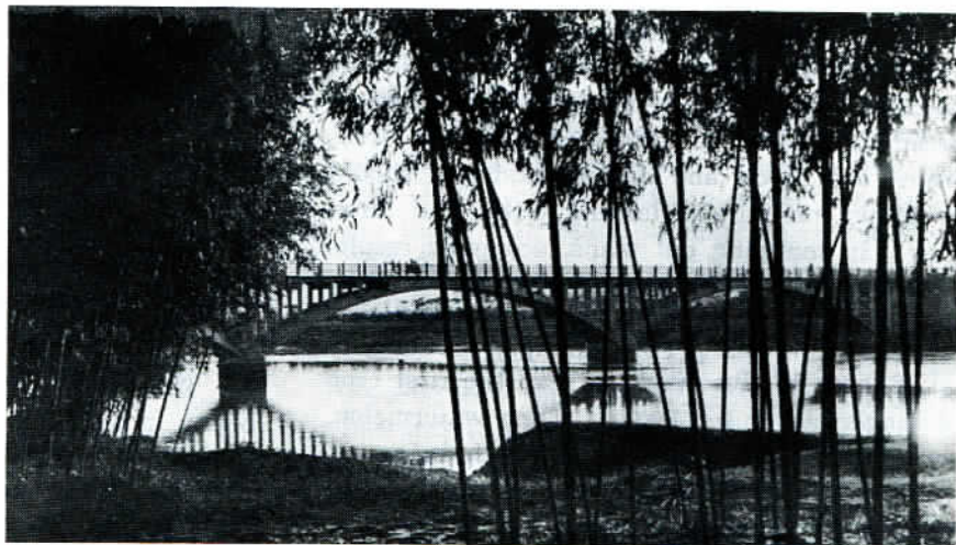
Bamboo in Shengxian County, Zhejiang Province.

But at present there are many mountains with only sparse vegetation or none at all. And large areas of land have not yet been opened up. Take Jiangshan County for example, no more than 6 per cent of its 50,000 hectares of hills has been reclaimed and many minerals and water resources are not being exploited. The wealth created in the rich, vast mountain areas is appallingly low. According to statistics, forestry in Quxian County contributed only 4.1 per cent of the county's income last year. In Kaihua County, 90 per cent of the total land is mountainous. The output value from forestry products and other cash crops make up only 23 per cent of the county's total.