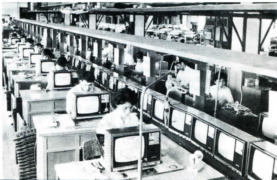
An assembly line for producing 12-inch black and white TV sets was recently built at the Shanghai No. 1 Television Factory.

What should be the assessment of this phenomenon of "producing for production's sake" which has appeared in socialist society? On the one hand, the achievements in the development of social productive forces should be confirmed. Since liberation, an industrial foundation has been formed with over 300,000 industrial enterprises in the country, more