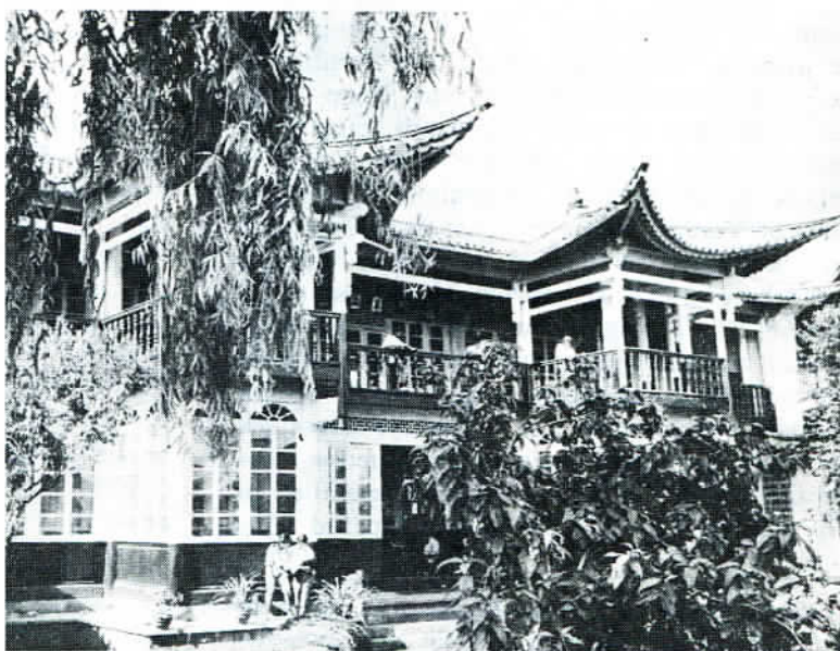
Outside the Heshun Library.

The library has benefited from the large number of its commune members who have relatives living abroad or who are themselves resettled overseas Chinese. These people