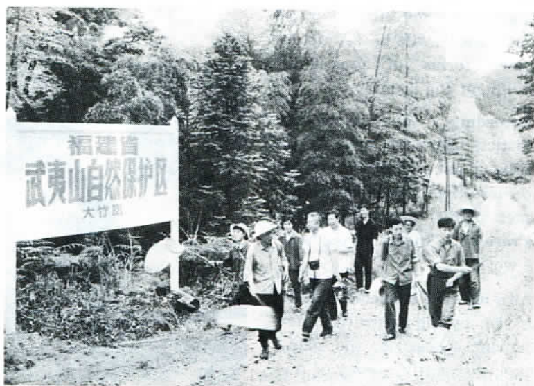
Making a scientific survey in the Wuyishan Natural Reserve of Fujian Province, southeast China.

Plans are being drawn up to set up 300 natural reserves