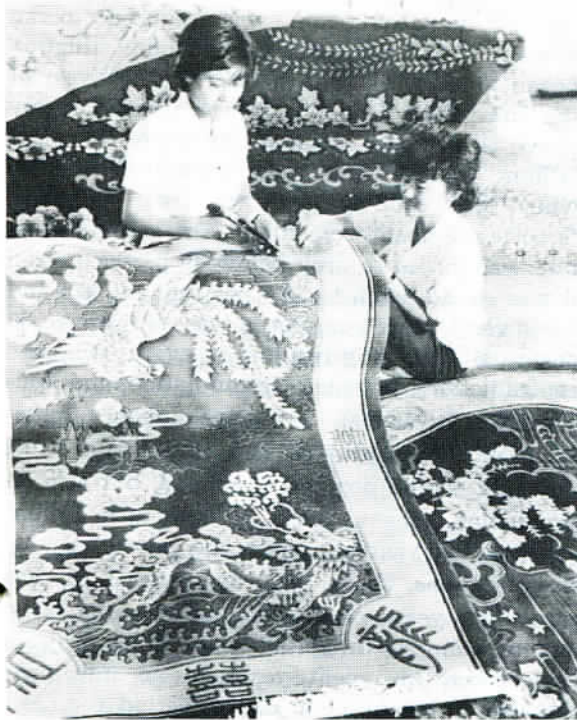
Shijiazhuang Rug Factory's products have been increasing steadily.

actual increase was 33.5 per cent.) The income of the peasants should increase at the same rate. The Second Five-Year Plan also made almost the same stipulation. If the plan had not been interrupted, the quotas could have been fulfilled, thereby providing a successful experience.