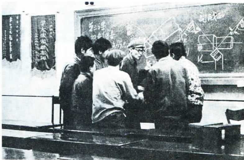
After-class discussion in an evening school run by the General Internal Combustion Engines Plant in Beijing.

Spare-time education is conducted in various ways and numerous courses are offered. Among the students are workers, technicians, management personnel and leading cadres, and the courses include general knowledge, science and tech-