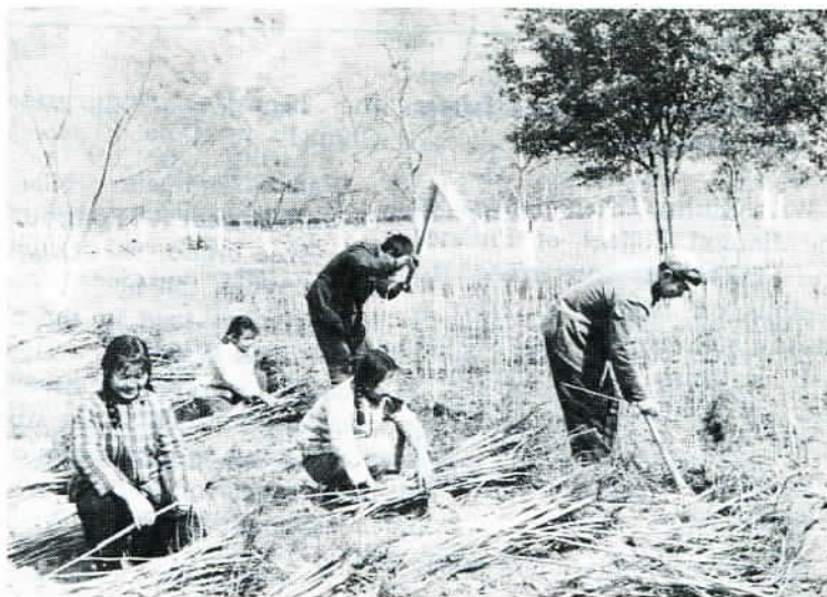
Peasants in Langao County, Shaanxi Province, transplanting Chinese lacquer tree saplings.

As a result of these impressive achievements, northern Shaanxi people acknowledge that transforming production can be accom-