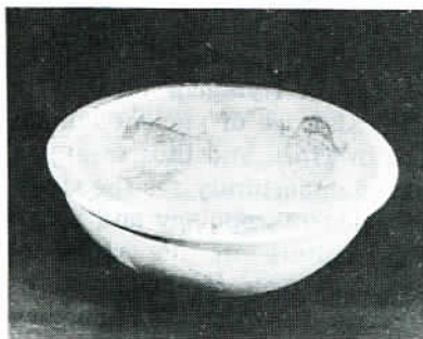
An earthenware bowl with fish and frog designs excavated at Jiangzhai.

by peasants working on a farmland capital construction project. It is located 15 kilometres from the famous Banpo village, which yielded important information about the Yangshao culture when it was excavated in the 1950s.