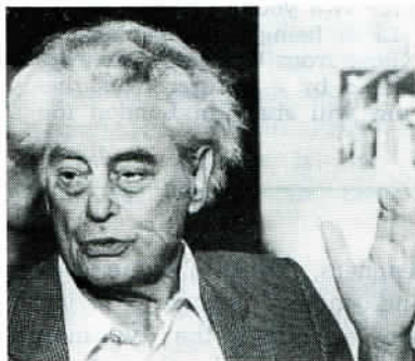
Joris Ivens at the opening ceremony.

Sponsored by the China Film Library and the Chinese Society of World Cinema, the celebrations include a study of Ivens' films and exhibitions of his works and achievements. These films and exhibitions will be put on show in Beijing, Changchun, Shanghai and Guangzhou.