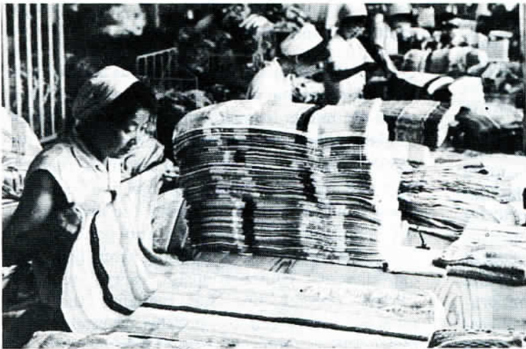
Workers in a Tianjin Jacquard fabrics factory inspecting the quality of their new products.

internal transport network of inland waterways, highways, railroads and airlines. This network connects with a vast hinterland embracing large sections of north and northwest China, part of Shandong and northern Henan. Farm produce, handicrafts and other sideline products flow into this commercial port for export while industrial products converge there before finding their way into this hinterland. At its peak before the "cultural revolution," Tianjin's total import-export trade accounted for 25 per cent of the nation's total. At present it carries on trade with 148 countries and regions.