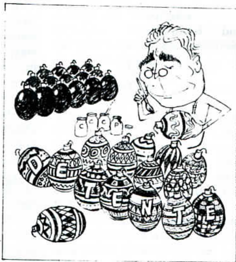
The art and craft of Soviet diplomacy.

The General Feeling. At the recent conference, Moscow's delegate again talked long and