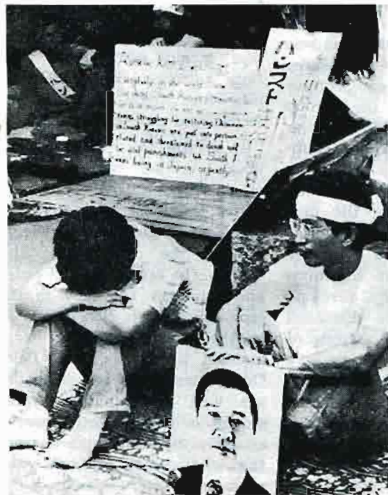
South Koreans in Japan on a hunger strike demanding release of Kim Dae Jung.