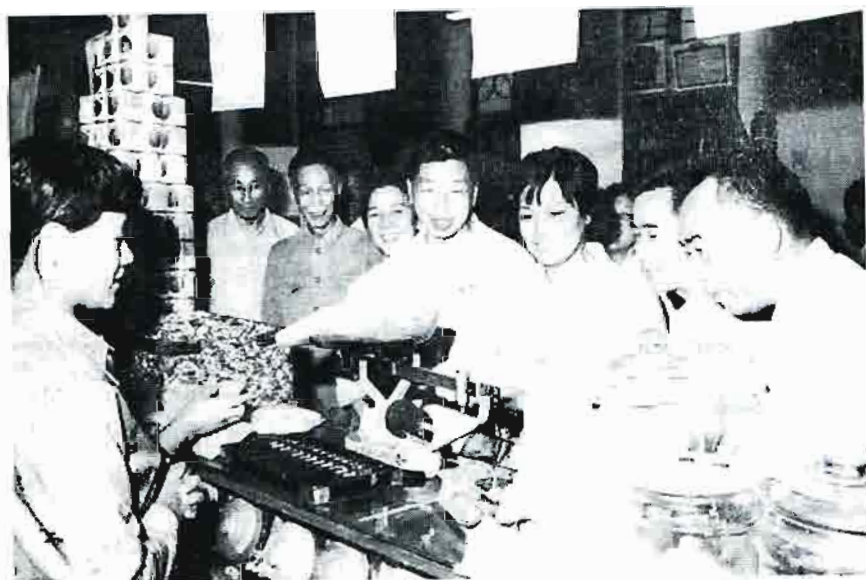
Deputies of a district in Shanghai checking on the prices and quality of goods in a shop.

and suggestions regarding the shortcomings and other problems in the work while affirming its achievements. Some criticized certain localities for arbitrarily raising commodity prices and issuing excessive bonuses. They demanded that the government departments concerned tighten price control and put an end to the abuses in the granting of bonuses and the increasing of prices. Some Standing Committee Members sharply criticized certain localities which had for a