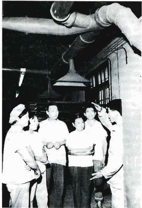
People's deputies of a district in Shanghai inspecting a furniture factory which has taken measures to reduce air pollution.

partments at all levels are required to draw up, in the light of the actual conditions, specific plans to enforce the Law of Criminal Procedure within this year in stages and in a number of localities at a time throughout the areas under their jurisdiction, with the exception of a very few outlying areas where the date of enforcement of the law may be postponed appropriately owing to exceedingly difficult communications.