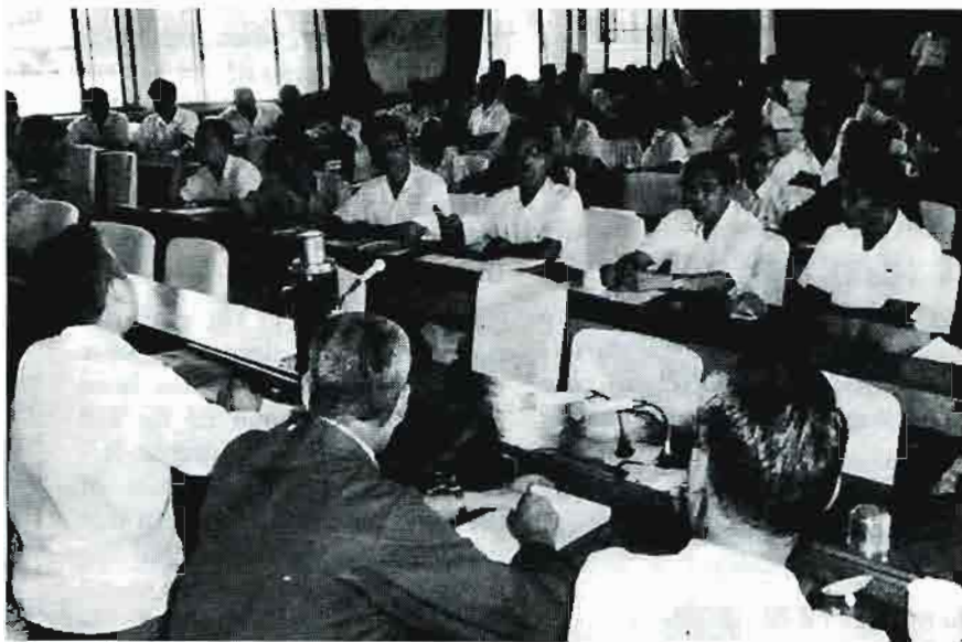
N.P.C. deputies (facing camera) addressing inquiries to officials in charge of the State Bureau of Labour and the State Bureau of Commodity Prices.

Structural Reforms in Economic Management. This is another major issue decided on at the session after full deliberations. Hua Guofeng's speech has indicated the orientation: Overcentralized management by the state must be corrected and the decision-making power of enterprises and the power of workers and staff to participate in management extended; regula-