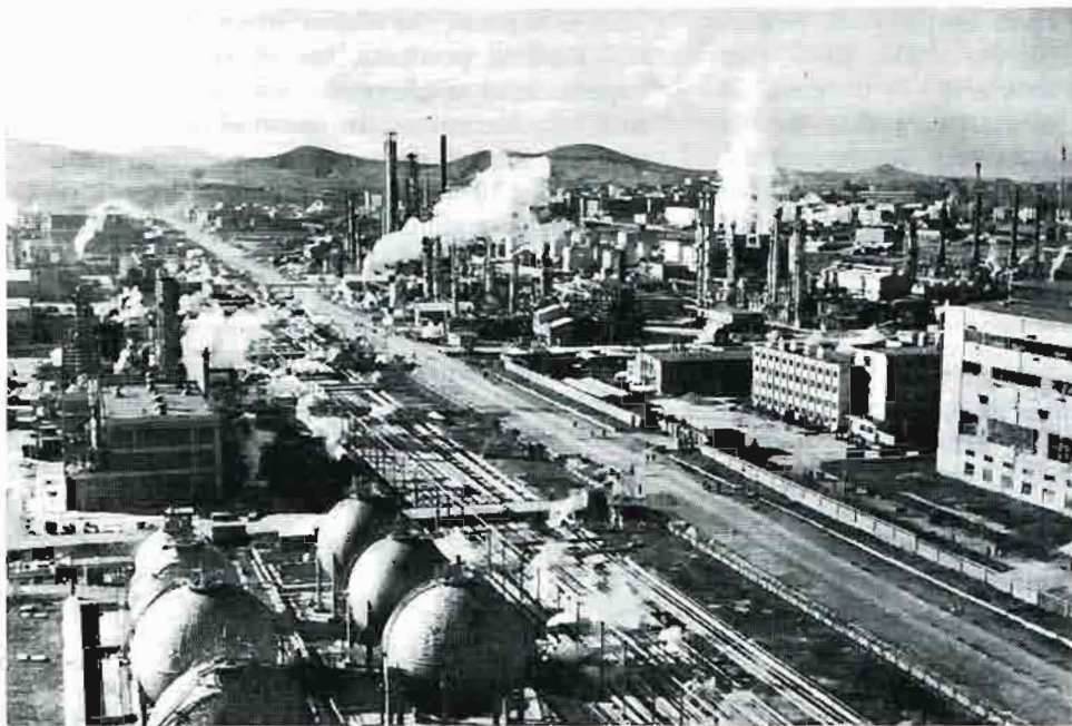
The petrochemical fibre factory in Liaoyang, northeast China, will soon be put into operation.

might have had on the economic life of the nation. There may well be repercussions sooner or later. The rise in the prices of certain commodities in recent years is a symptom of this. We must never treat this matter casually, but should pay great attention to and really solve it.