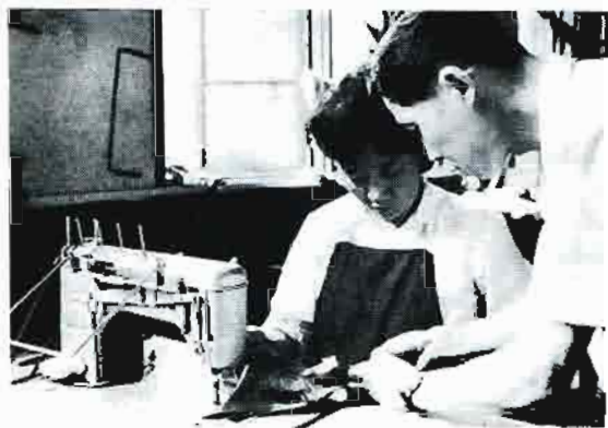
Co-operation between a leather sporting goods factory in Shanghai and a tannery in southwest China's Sichuan Province. Picture shows a technician from Shanghai helping a worker in the tannery master new techniques.

Following recent complaints from both Chinese and foreign passengers, the General Administration of Civil Aviation of China (CAAC) is now taking