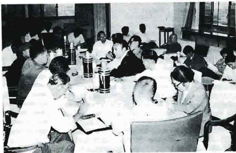
Tibetan deputies at a panel discussion.

A Session Where All Deputies Are Equal. The way the meetings were held was not the same as before. In the past, deputies holding leading posts would mount the rostrum only after all other deputies had taken their seats and they would receive a standing ovation with all the lights in the auditorium on. This time they just walked into the hall and took their seats about the same time as the others. At the back of the rostrum was the emblem of the People's Republic, replacing the leaders' portraits which used to dominate the scene. Ranking officials now took part in group deliberations like everybody else. In the past, they were supposed to belong to different groups of deputies, and they just didn't join the deliberations as ordinary deputies but would appear as leaders who came down to "meet their fellow deputies" or "give instructions." All these may appear to be mere trifles, but it was these details that testified to the new spirit of the session. Congress members had the feeling that the wall between them and the leaders was being pulled down to let the breezes of democratization blow in.