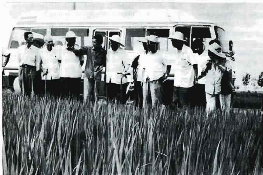
N.P.C. Standing Committee Members inspecting a farm in Beijing.

over the past few years, there are still a lot of problems and divergences of opinions among the various quarters. Conditions are not ripe for making a family planning law now, nor for submitting the draft to this session. What we have done in this connection is only to stipulate in the revised Marriage Law that both husband and wife have the obligation to practise family planning and that late marriage and late childbirth are encouraged. We shall continue to sum up experience and canvass opinions from all sides so that a family planning law may be enacted as soon as possible.