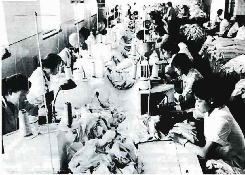
A collectively owned clothing factory in Weihai city, Shandong. Many such enterprises have been established to open up more avenues for employment.

(4) Funds devoted to developing agriculture and light industry were increased by a fairly big margin. This helped to readjust the