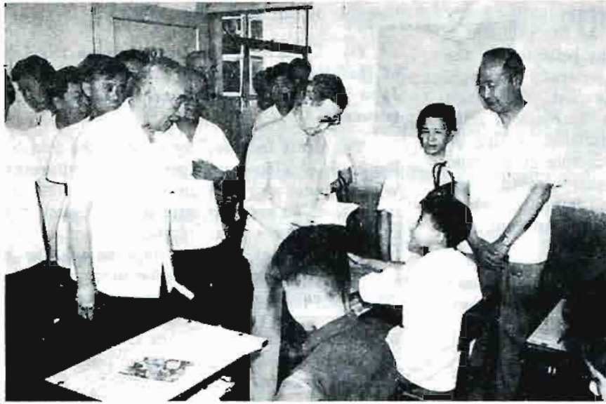
N.P.C. Standing Committee Members inspecting a work-study school in Beijing.

The present revised draft of the Marriage Law of the People's Republic of China was drawn up on the basis of the Marriage Law promulgated in 1950.