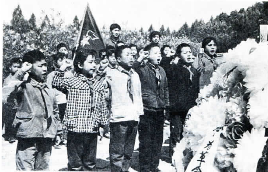
Railway workers' children taking the Young Pioneer oath before the Tomb of Revolutionary Martyrs in Jinan, Shandong Province.

In order to eliminate the serious aftermath caused by the activities of Lin Biao and the gang of four, and especially with the shift in the focus of the Party's work, there is an urgent need for training talented people for the modernization programme. For these reasons, we are attaching greater importance to teaching work and to the study of cultural and scientific knowledge. It should be affirmed that this is a big step forward. It is our duty to arm the minds of youngsters with the cultural legacy of