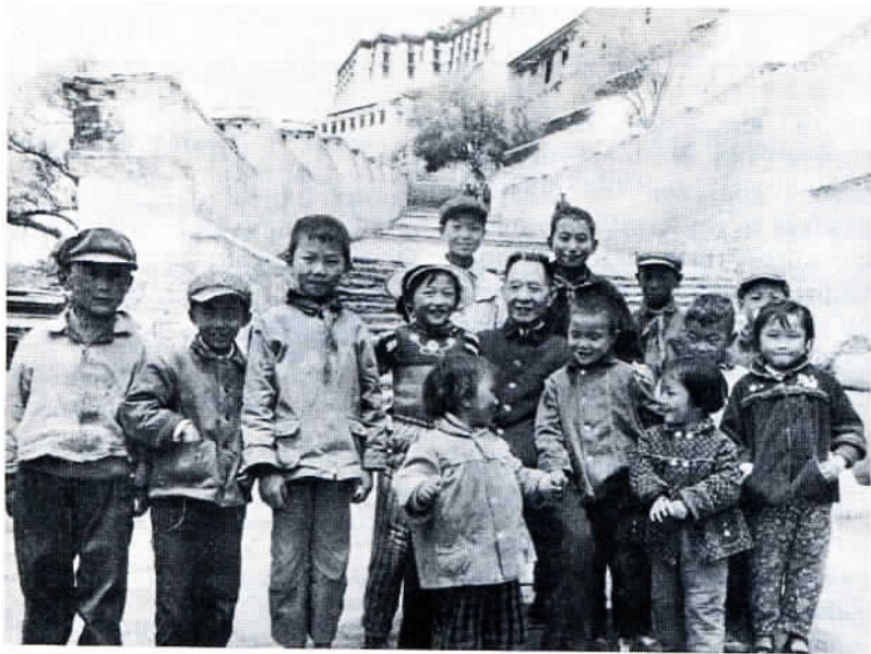
After visiting the Potala Palace in Lhasa, Hu Yaobang poses for a picture with the kids living nearby.

the next two or three years, bringing about the highest known living standards in the region within the coming five or six years and effecting a relatively big development in Tibet's economy and a rise in the people's living standards within ten years.