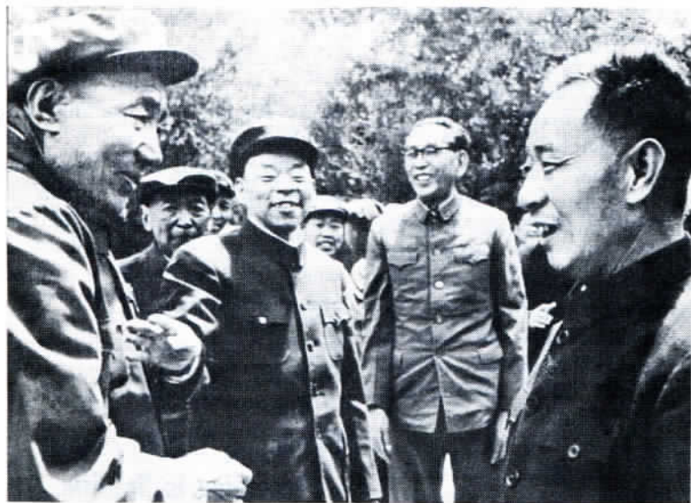
Hu Yaobang (right), Ngapoi Ngawang Jigme, Vice-Chairman of the Standing Committee of the National People's Congress (2nd from right), and Yin Fatang, acting first secretary of the Party committee of Tibet (2nd from left), chatting with Tibetan patriotic personages.

All this aims at ending Tibet's state of poverty within