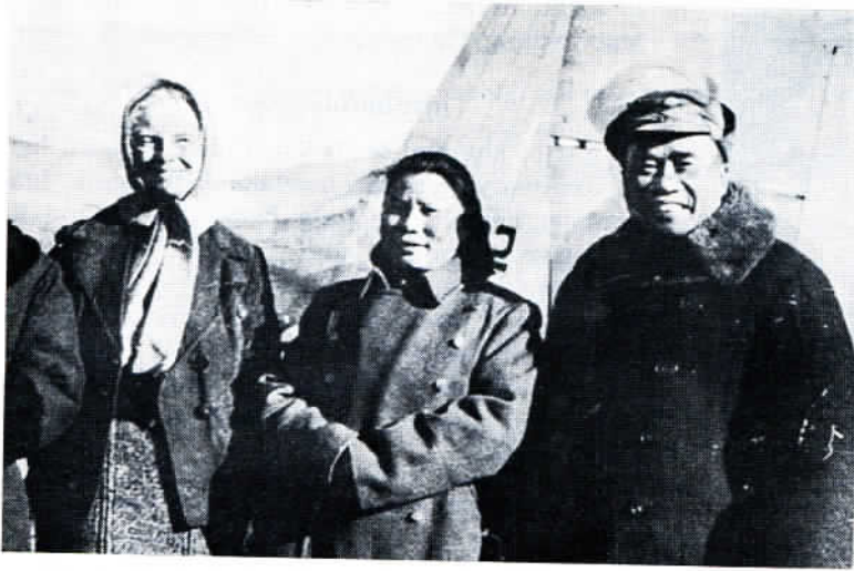
Agnes Smedley with Comrades Zhu De and Kang Keqing in Yanan during the war of resistance against Japan.

had made outstanding contributions in acquainting the people of the world with the Chinese revolution, thus adding a brilliant and moving chapter to the annals of friendship between the Chinese and American peoples.