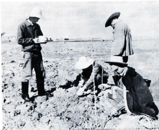
Surveying the bed of a salt lake in the Qaidam Basin.

environmental factors and geological structures.