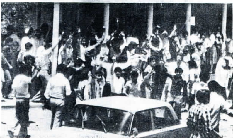
Students outside the Nablus hospital protest Israeli extremists' atrocities.

• The Israeli people's struggle against the expansionist policy of the Israeli authorities is surging forward. The "peace now" and "immediate election" movements are clearly directed