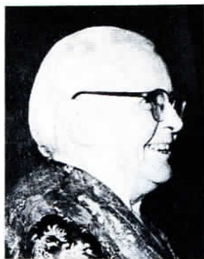
Anna Louise Strong.

Between 1946 and 1947 she left San Francisco for China and paid a visit to Yanan, headquarters of the Chinese revolution, and other liberated areas. When in Yanan, Comrade Mao Zedong had an important talk with her in which he made known his thesis, "Imperialism and all reactionaries are paper tigers." She also interviewed Liu Shaoqi, Lu Dingyi and other leading comrades. Seeing the China of tomorrow in her mind's eye, she wrote Dawn Over China which was about her latest visit and was published subsequently in India, the United States and France. She was also the author of "Thought of Mao Zedong," carried in Amerasia