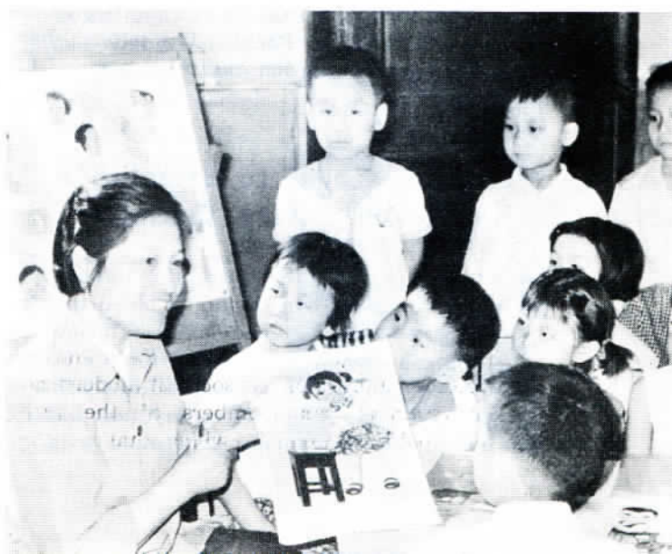
Teaching kindergarteners in Tianjin.

To accomplish the four modernizations, we need talented people of all types. The university is, of course, an important way but not the only way for us to train needed personnel. Historical facts prove that many of the outstanding people who made discoveries and inventions were not graduates of any university. We ask youngsters not only to resolve to open up new scientific and cultural areas, and scale scientific heights, but to study and grasp various production techniques and vocational skills in the light of their own characteristics so that they will become workers, cadres, managerial personnel, teachers, lawyers and service workers well-versed in their own particular