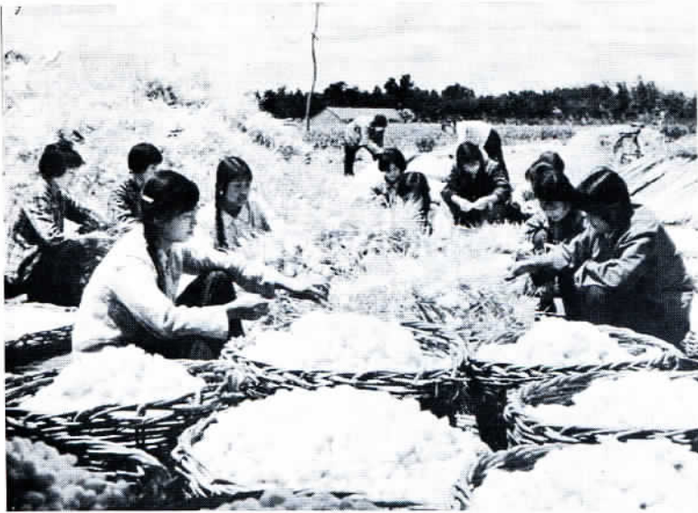
A rich crop of silkworm cocoons in a Shandong village.

refining and the rubber industry. In traditional grain-producing areas, the hills and water surfaces are being used to develop forestry and fisheries, stock-breeding and poultry raising and small industries so as to diversify the economy.