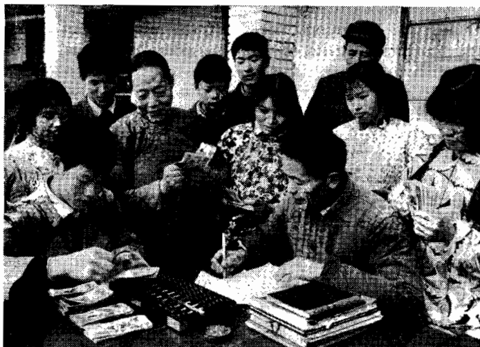
Year-end distribution in a production brigade in Zhejiang Province.

What happened in the Huangcheng Commune in Changdao County, Shandong Province, illustrates the harm done by such fallacious practice. In 1970, the commune did well in developing a diversified economy and its members' annual income increased to 203 yuan