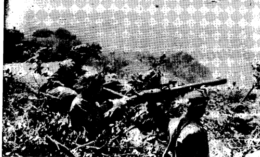
Chinese frontier troops on top of China's Tinghao Hill in Jingxi County, Guangxi. The hill was recovered from the Vietnamese aggressors.

against Chinese inhabitants and militiamen there. The casualties among commune members included 6 dead and 12 wounded. Six others were kidnapped.