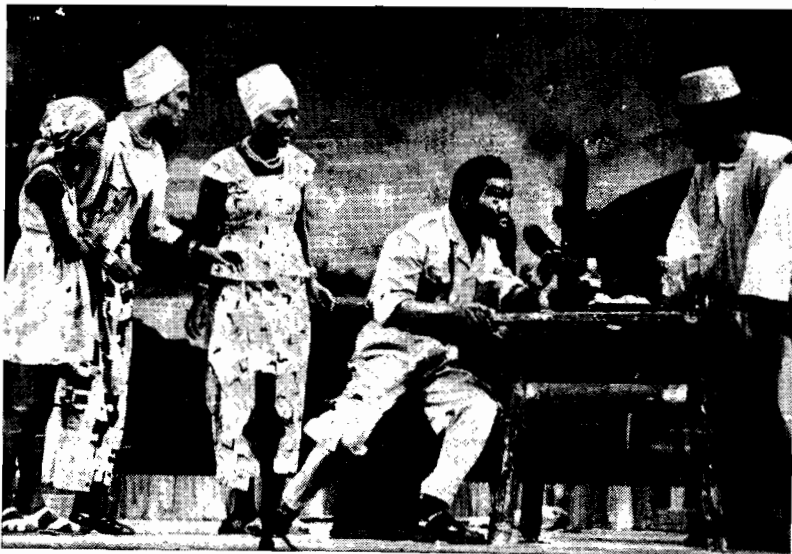
A scene from The Other Side .

Repertoire of the Beijing Opera Theatre of Beijing. The 15 masterpieces staged by this well-staffed theatre in the last two weeks include: the historical play Hai Rui Dismissed From Office , The White Snake —a folk tale on the loyalty of love, The Monkey Subdues the White-Bone Spirit , and Mu Guiying Takes Command —a story about a patriotic woman general.