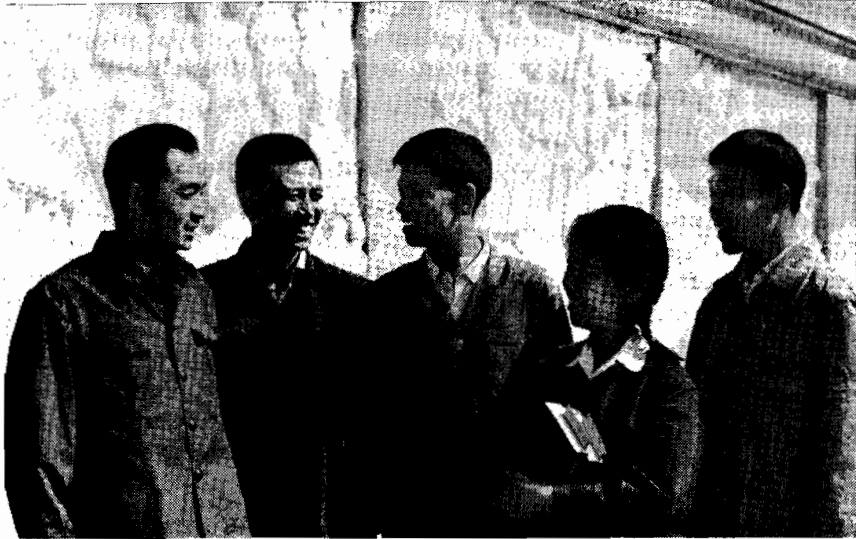
Five of many young people, persecuted in connection with the Tian An Men Incident, revisit the Square after they were exonerated.

with the incident should be rehabilitated and exonerated.