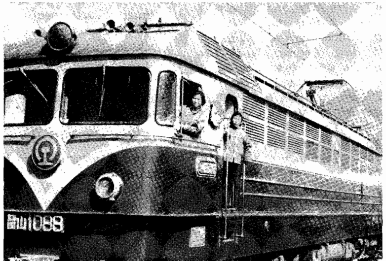
Women engine drivers aboard their locomotive.

China's first electrified railway, the Baoji-Chengdu Railway, was completed in 1975 and the second, the Yangpingguan-Ankang Railway, in 1977.