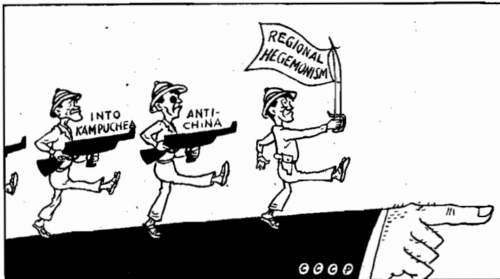
The Vietnamese "road to socialism."

The Vietnamese authorities think that they can bind Kampuchea to their war chariot rolling through Southeast Asia with this treaty of enslavement. But as a matter of fact the puppets are a heavy burden to the Vietnamese authorities. For Viet Nam is being forced to