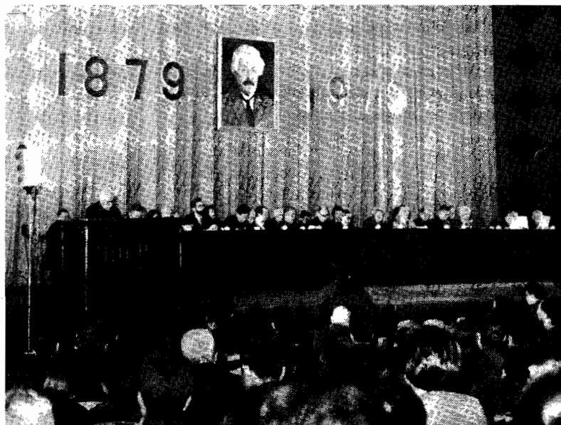
Meeting in commemoration of Einstein.

The Chinese people and scientists will never forget how Einstein showed deep concern for the suffering of China's labouring people and placed high hopes on our nation which has a long history of civilization. In the 30s, Einstein appealed to the world to stop Japanese aggression against China and voiced solidarity with the seven public figures in China who were persecuted by the reactionary regime for advocating resistance to Japanese aggression. Einstein's moral strength and scientific questing spirit are a source of inspiration to the Chinese people today.