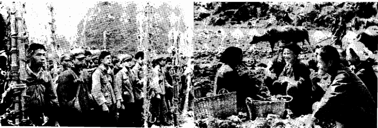
Left: A stretcher team of militiamen in Jingxi County backing Chinese frontier forces in their counterattack. Right: Chinese commune members of Jingxi County, Guangxi, leave their shelters in the hills for spring ploughing after Chinese frontier forces start counterattacking Vietnamese aggressors.

• February 16 The Chinese Foreign Ministry sent a note to the Vietnamese Embassy in China strongly protesting against the Vietnamese authorities' dispatch of armed personnel to encroach upon China's territory and create new grave incidents of bloodshed. The note warned the Vietnamese authorities that they should bear full responsibility for all the consequences arising therefrom.