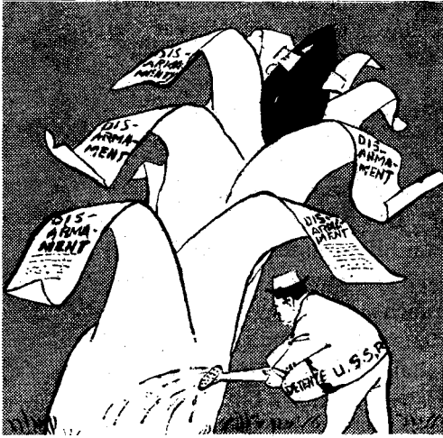
Growing the "Disarmament" tree. by Fang Cheng

money, likely to result in severe economic stagnation. A November 1 AP dispatch said that it "could further tip the nation towards a recession."