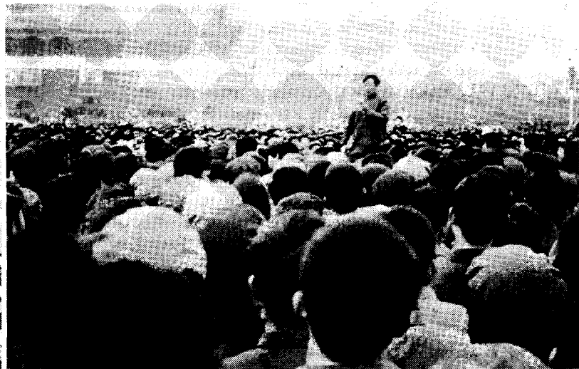
Tien An Men Square during the Ching Ming Festival 1976. Pictures show wreaths laid in memory of the late Premier Chou (left) and a speaker delivering a speech (right).