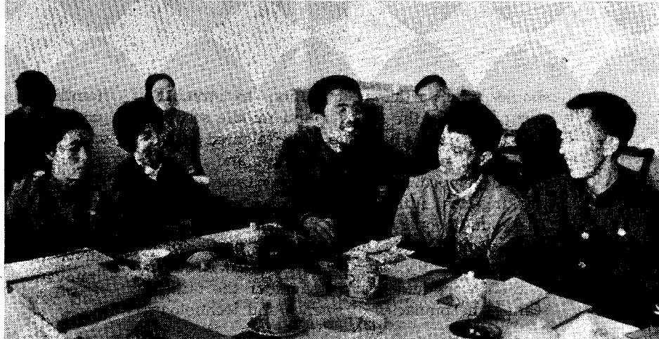
Representatives from various fronts at a group discussion.

The future of science rests with the young people. The Communist Youth League must take the organization and guidance of the young people in mastering modern science and technology as a paramount task in the new period. One important criterion for judging whether a youth today is really red is to see if he or she delves into his or her own field of work and diligently studies to master science and culture for the revolution. Youth who are completely immersed in studying science and technology in the hope of making our country