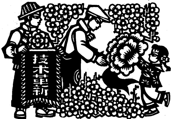
A flower for an outstanding worker.

As a matter of fact, we must see things first of all in terms of the economic relationship between state, enterprise and individual, no matter how the division of labour between the central and local authorities is arranged and no