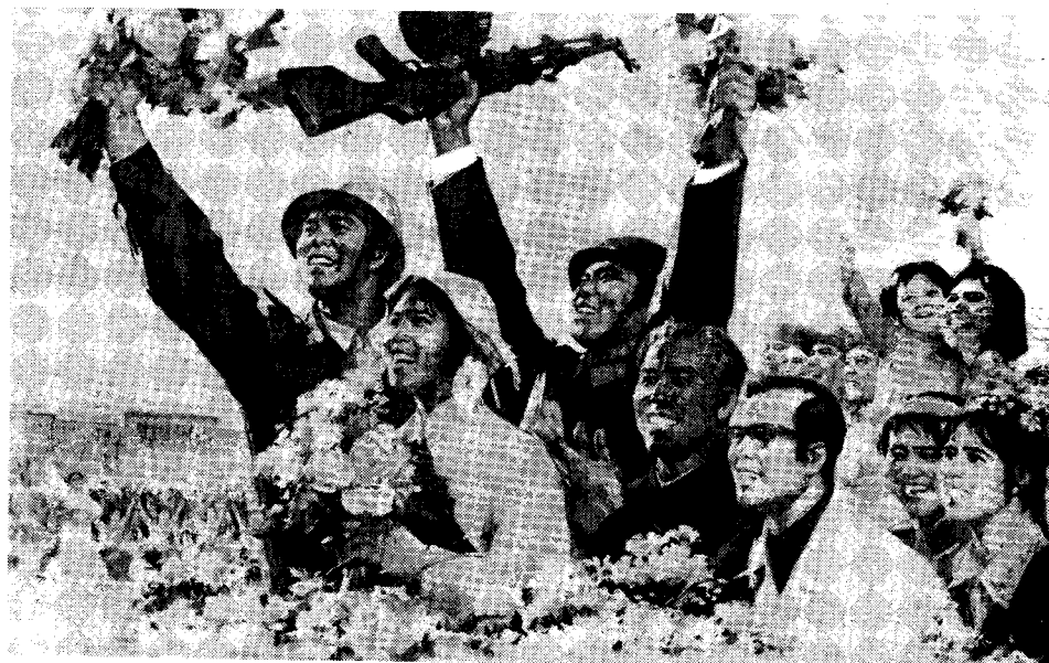
Poster by Wang Tsun-yi and Kao Shao-fei

ple in the new period of development in socialist revolution and socialist construction is firmly to carry out the line of the 11th Party Congress, steadfastly continue the revolution under the dictatorship of the proletariat, deepen the three great revolutionary movements of class struggle, the struggle for production and scientific experiment, and transform China into a great and powerful socialist country with modern agriculture, industry, national defence and science and technology by the end of the century." This general task is laid down in legal form in the new Constitution. The Outline of the Ten-Year Plan for the Development of the National Economy lays out a splendid picture of construction for us. A group of long-tested proletarian revolutionaries headed by Chairman Hua has assumed the responsibility for leading the state. This is the reliable organizational guarantee for building a powerful socialist