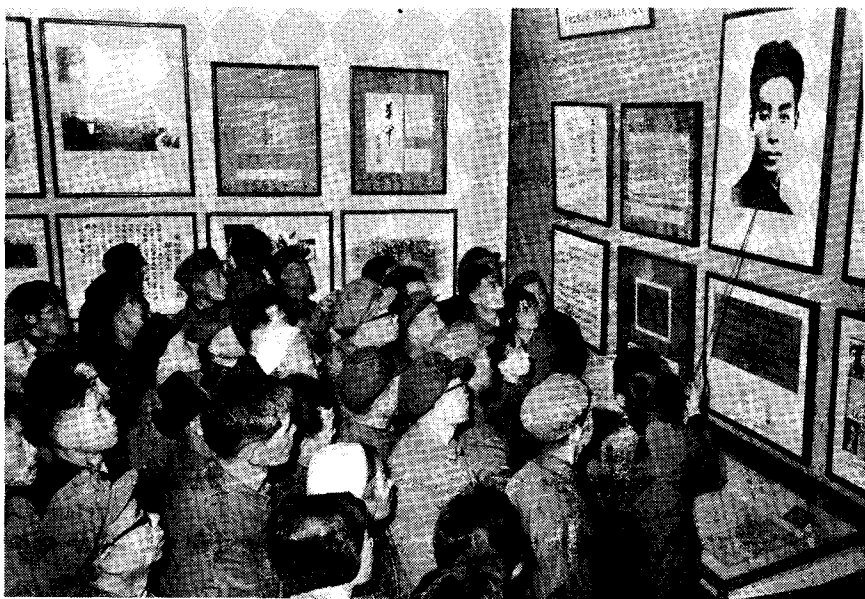
N.P.C. Deputies visiting the exhibition in memory of Comrade Chou En-lai.

On March 6, mammoth parades were held in Peking, Shanghai and Tientsin,