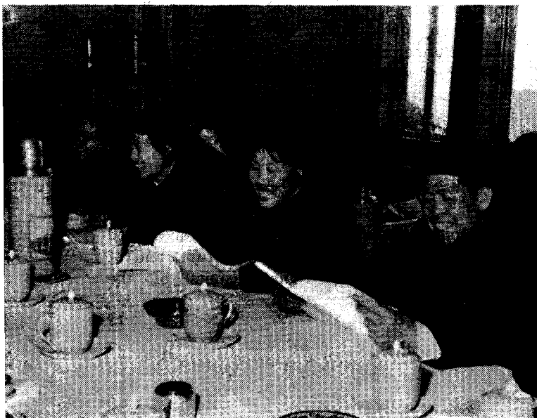
Deputies from the rural people's communes.