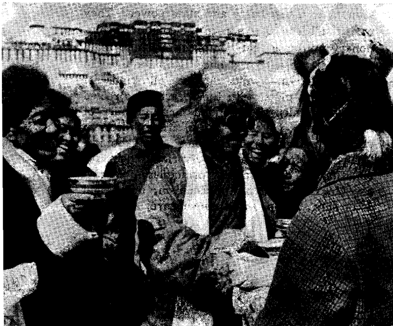
Emancipated Tibetan serfs seeing their own Deputy off to Peking.