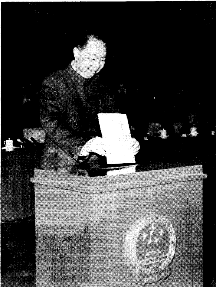
Chairman Hua Kuo-feng casting his vote.

Vice-Chairmen Li Hsien-nien and Wang Tung-hsing also joined the Deputies from their respective electorates of Hupeh Province and Peking in group discussions.