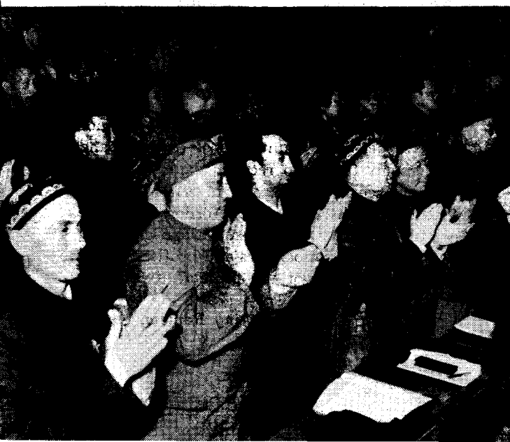
At the first session of the Congress.