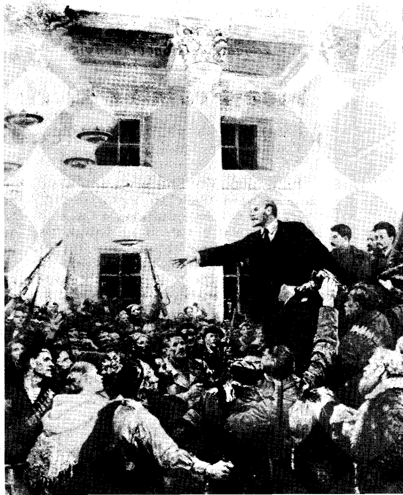
At the Second All-Russia Congress of Soviets of Workers' and Soldiers' Deputies on the night of November 7, 1917, Lenin announces all power to the Soviets (oil painting).

proletariat after the seizure of state power and the importance of preventing a capitalist restoration. It was under such historical circumstances and in the struggle to repudiate modern revisionism represented by the Soviet revisionist renegade clique that Chairman Mao summed up both the positive and negative experience in the Chinese revolution and the international communist movement, inherited, defended and developed Marxism-Leninism and comprehensively created the theory of continuing the revolution under the dictatorship of the proletariat. This great theory is propelling the proletarian revolutionary movement to a new and higher level. Everyone can see that the socialist revolution in China and other socialist countries is continuing to forge ahead, and so is the struggle against imperialism and hegemonism waged by the proletariat and the revolutionary people all over the world, despite the fact that the socialist