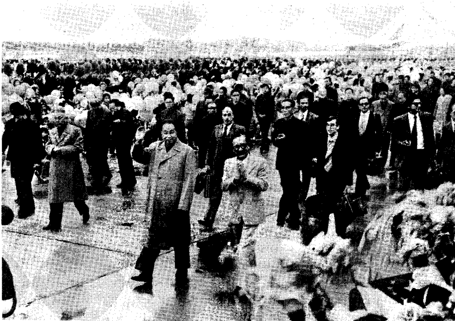
Prime Minister Mintoff receives a rousing welcome at Peking Airport.