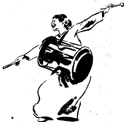
Long Drum Dance, which is popular among the people of China's Korean nationality.

labour of Japanese peasants, Ethiopian herdsmen and girls of Sri Lanka, and merry-making at festival time of the people