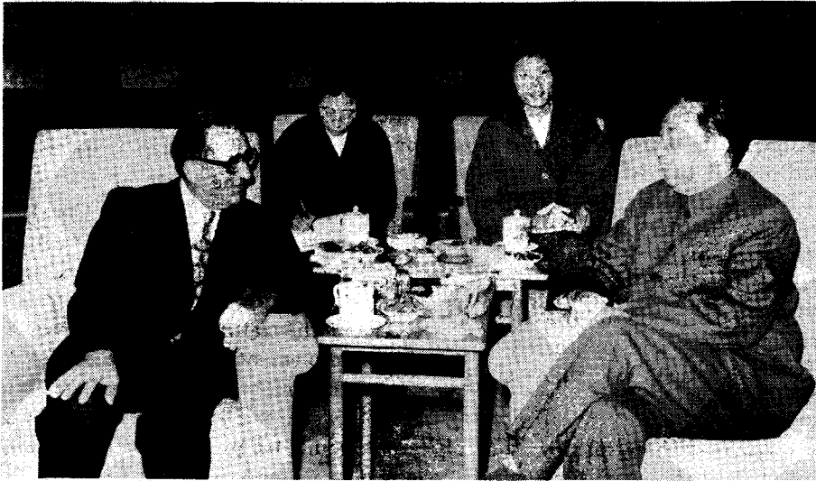
Chairman Hua meets Prime Minister Mintoff.

During the distinguished Maltese guest's stay in Peking, Vice-Premier Li Hsien-nien held talks with Prime Minister Mintoff and on November 6 they attended the signing ceremony