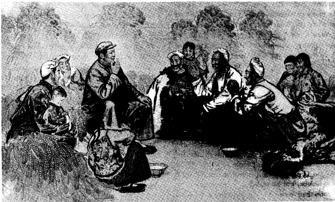
Chairman Mao together with peasants in northern Shensi.