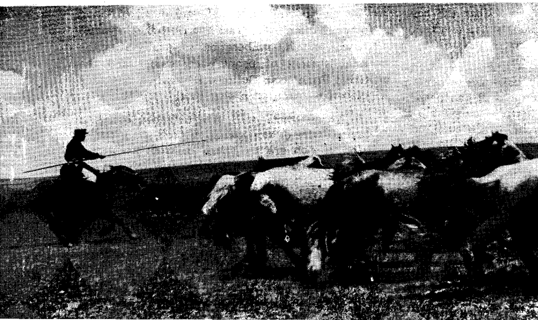
A view of pastureland.

Since the establishment of the Wulantuke Commune, which is bigger in size and has a higher degree of public ownership as compared with co-ops, favourable conditions have been created for expanding grassland capital construction. How the commune's third brigade solved the problem of water shortage is a good illustration. This brigade has a seven-hectare fodder base, but the source of water is some 3.5 kilometres distant. The brigade allocated a large work force to cut a ditch for diverting water to the base. But the water was lost through seepage halfway before it reached the base. Later the brigade planned to line the ditch with a seep-proof wall of stone quarried from a nearby hill, a project requiring three years' work by 30 able-bodied members. When the commune learnt of this plan, it assembled more than 100 young stalwart members from other