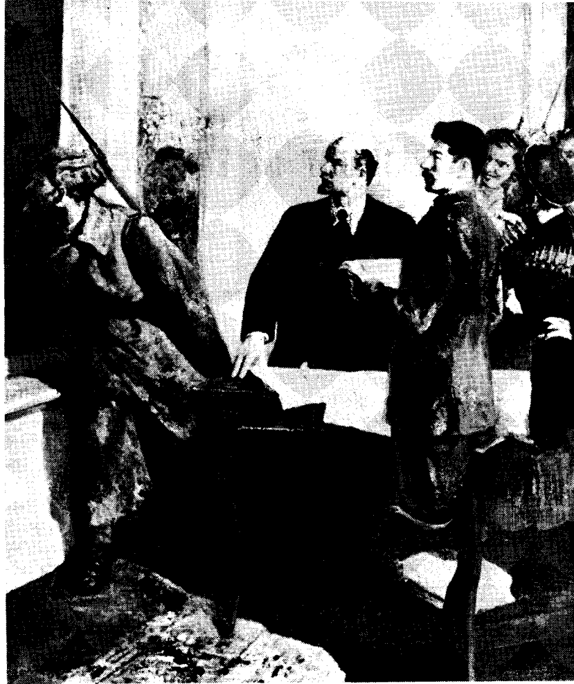
At the Smolny Palace on November 6, 1917, Lenin and Stalin take command of the armed uprising (oil painting).

There have been earth-shaking changes in the world situation in the 60 years since the