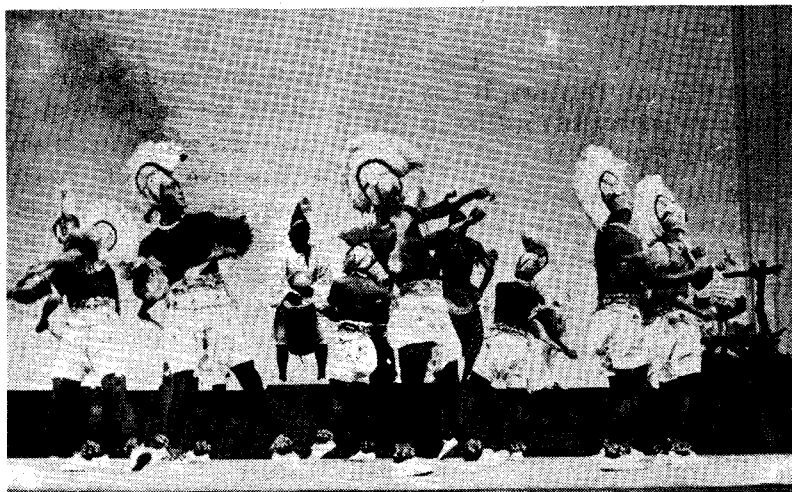
A Malian dance.

of Bangladesh and Argentina. The artists also sang folk songs of India, Egypt and other countries and performed Burmese, Mexican and Guinean melodies with Chinese traditional musical instruments. Their performances were greeted with enthusiastic applause from the audience.