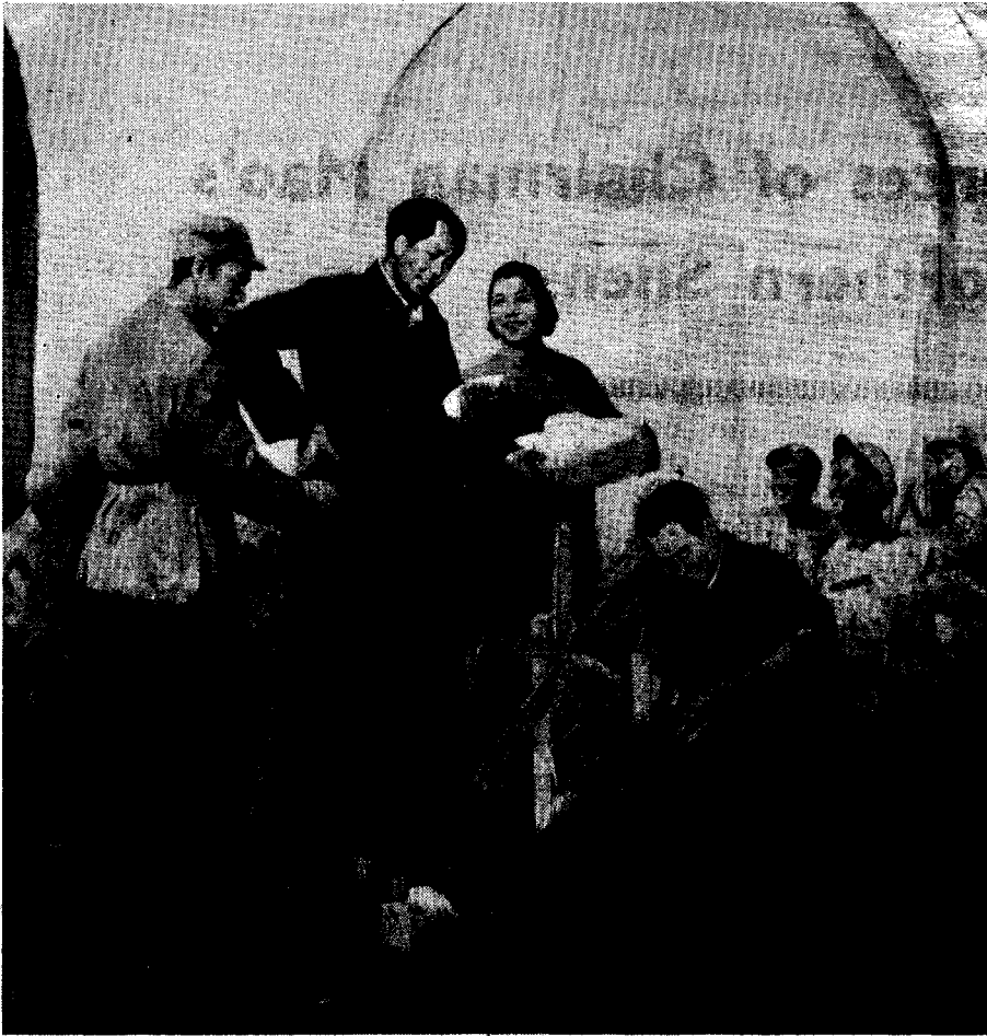
Chairman Mao, Vice-Chairman Chou and Commander-in-Chief Chu Teh during the big production campaign.