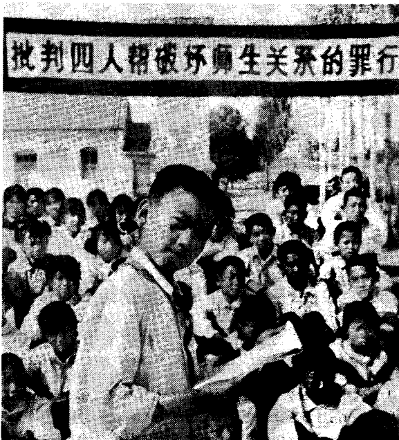
Pupils of a primary school in Shansi Province criticize the "gang of four."

criticisms in a comradely way and help the teachers do a good job.