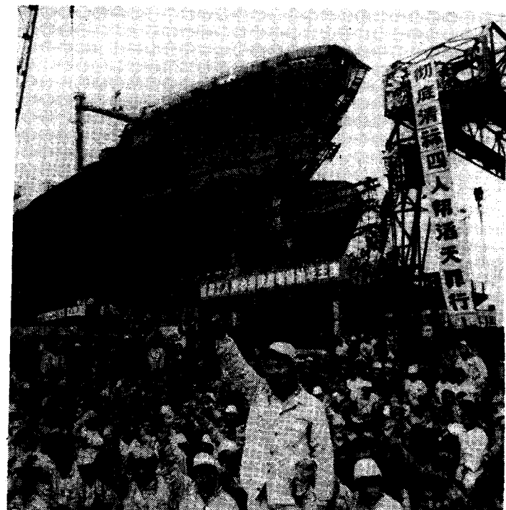
Workers and staff members of Shanghai's Hu-tung Shipyard denouncing the "gang of four."

eign trade and our aid to foreign countries. If we had followed the reasoning of the "gang of four," we would not have been able to speedily put an end to our dependence mainly on chartered ships in maritime transport.