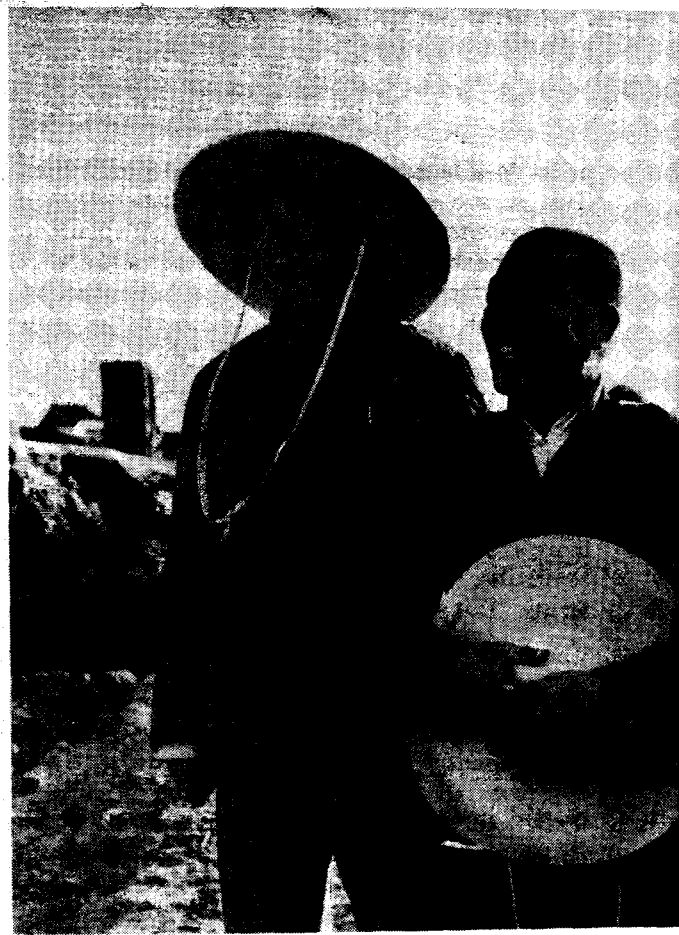
On top of Tiger Head Hill in Tachai.