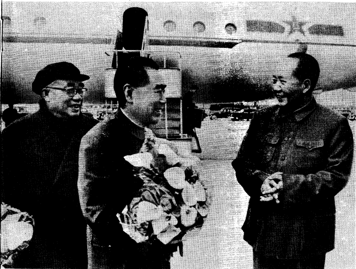
When Comrade Chou En-lai headed the Chinese Party and Government Delegation taking part in the celebration of the 47th anniversary of the October Socialist Revolution in the Soviet Union in November 1964, he resolutely rebutted the Soviet revisionist renegade clique's vicious attack on our Party and defended Marxism-Leninism-Mao Tsetung Thought. Photo shows on his return from Moscow at Peking Airport he received a warm welcome from Chairman Mao and Chairman Chu Teh of the Standing Committee of the National People's Congress and the people of the capital.