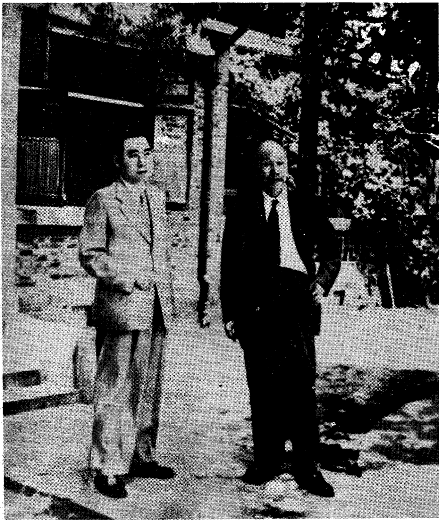
Comrade Chou En-lai and Comrade Tung Pi-wu in courtyard of Meiyuan Hsintsun No. 30 in Nanking, residence of the delegation of the Communist Party of China which was negotiating with the U.S.-Chiang Kai-shek reactionaries in 1946.