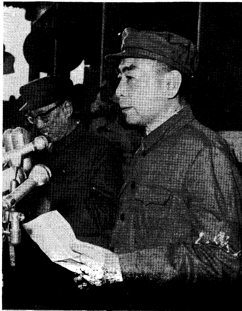
Premier Chou and Comrade Kang Sheng at a reception meeting with revolutionary teachers and students who had come to Peking from various parts of the country, September 1966.