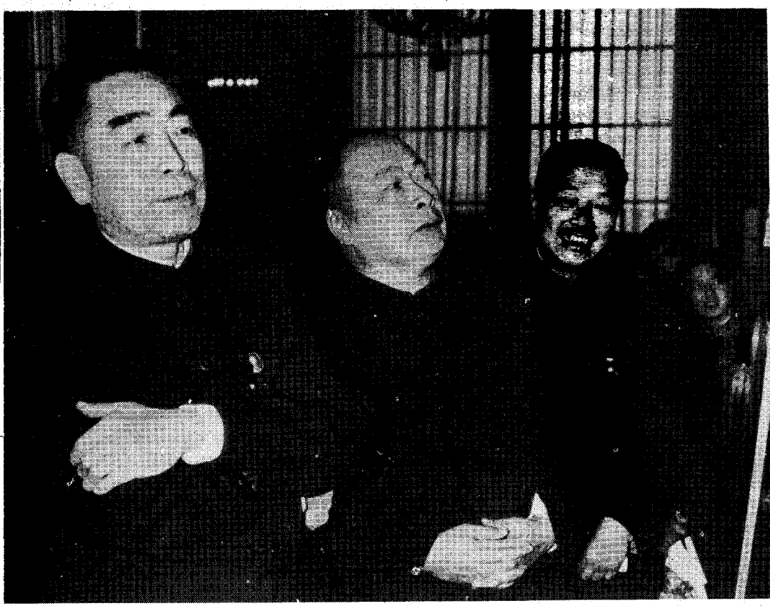
Lower left: Premier Chou with Vice-Premiers Chen Yi and Ho Lung visiting an exhibition in December 1957.