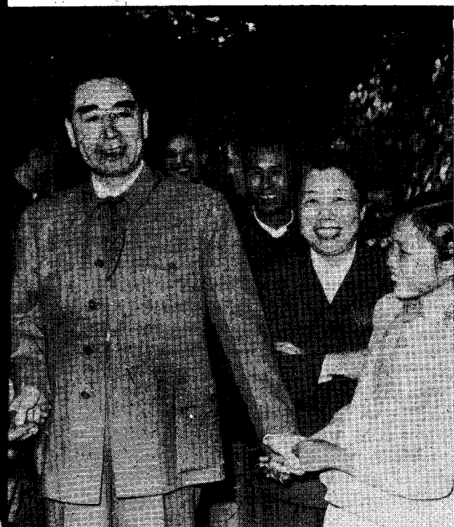
Premier Chou and Comrade Teng Ying-chao with Young Pioneers, February 1960.