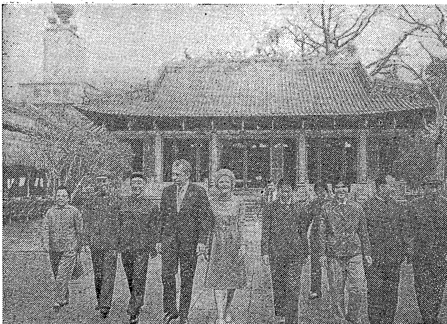
Mr. and Mrs. Nixon visit the site of the National Institute of the Peasant Movement which was run by Chairman Mao in 1926.