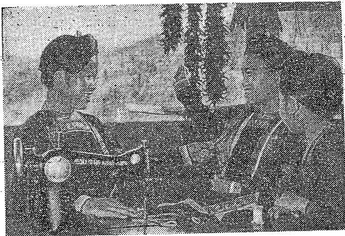
Commune members of Tung nationality making new clothes with sewing machines which are common in many minority families in Kweichow.

point to eliminate snails, while increasing cultivated land and expanding Tachai-type fields giving stable yields despite excessive rain and drought.