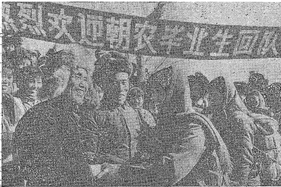
Rural people's commune members welcoming graduates of Chaoyang Agricultural College back to the countryside.

the Cultural Revolution, and strive to make our college an instrument of the dictatorship of the proletariat.