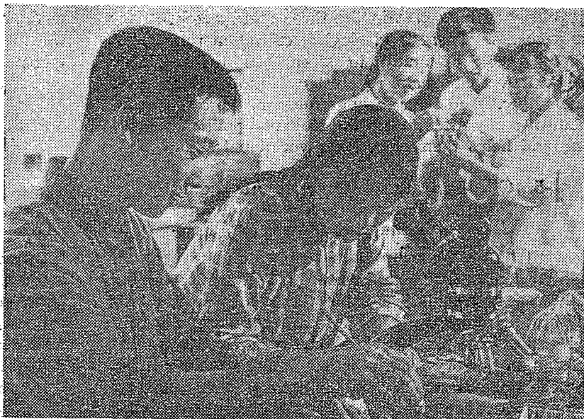
Students of Chaoyang Agricultural College carrying out scientific experiments on improving strains.

Since the start of the Cultural Revolution, guided by Chairman Mao's revolutionary line, our college has made great efforts to change this situation and provided the masses with more and more opportunities to study. Our college first set up six research and teaching centres in six counties of the prefecture. These centres were later incorporated with county-run agricultural colleges. Thus agricultural colleges were set up at both the prefecture and county levels. Communes run agricultural middle schools and brigades organize teams for scientific experiments. A network