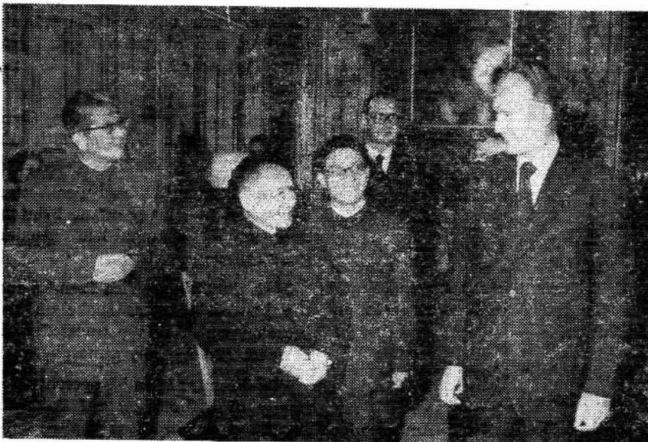
President Giscard d'Estaing and Vice-Premier Teng Hsiao-ping have a conversation before the banquet.

He stressed: "Both France and China have accumulated a long experience of international life. They know that a country cannot, with impunity, rely on others to take care of its security and that, if alliances are frequently necessary, nothing can replace the will of a nation to assure its defence itself and of possessing the means to do so. They likewise understand that the movement that impels the peoples to unite jointly to create the conditions for their freedom and future corresponds with the demands of world equilibrium and those of peace. It is in this spirit that France, on her part, is determined to pursue the union of Europe actively. She is pleased with the interest China shows in this and with her recent decision to establish regular relations with the Community of the Nine."