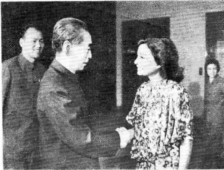
Premier Chou En-lai meets with Princess Ashraf Pahlavi.

Development of relations between the two countries. Since the setting up of Sino-Iranian diplomatic relations in 1971, he noted, the two countries' relations have witnessed great development with ever more frequent exchanges and deeper understanding between them. The friendship between them has a deep-rooted foundation and is in complete accord with the common aspirations of the two peoples. It can be said that the Sino-Iranian friendship tree which Her Imperial Highness played a part in cultivating is growing sturdily and bearing fruit.