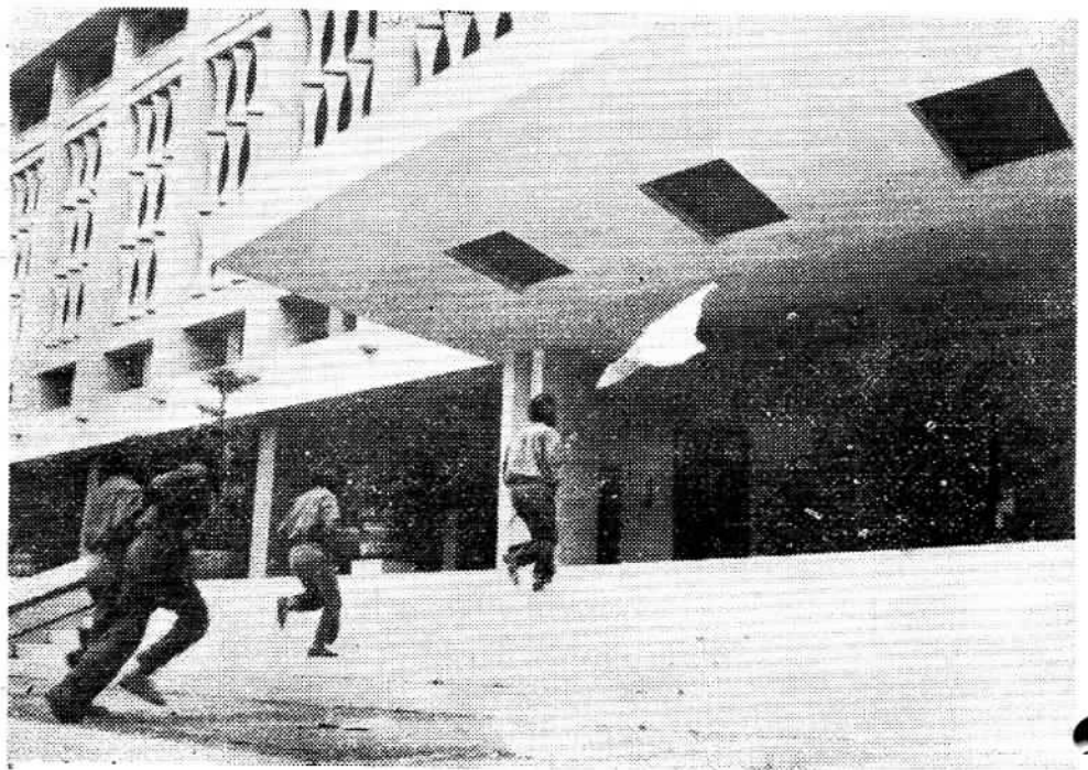
Fighters of the Liberation Armed Forces rushing into the bogus presidential palace in Saigon.

The people in south Viet Nam fondly call the People's Liberation Armed Forces "soldiers of the people," regarding them as their kith and kin and giving them every support. In the most difficult war years, the south Vietnamese people scraped up whatever they could to support their own army with money and what they called "rice for national salvation and against U.S. aggression." Young people flocked to join the army so that it grew steadily in strength. The people in the