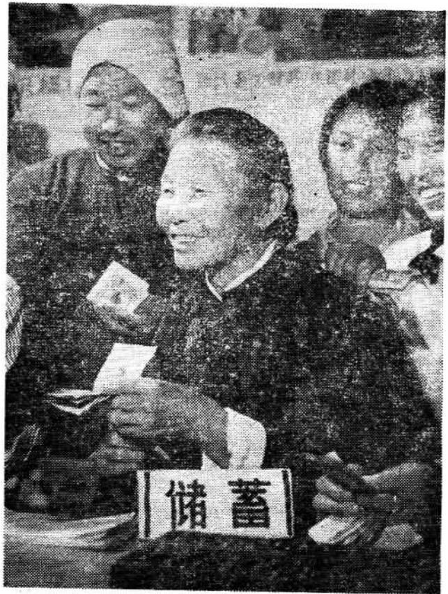
A savings office in a rural people's commune.

The establishment of an independent monetary system signifies a great victory for the Chinese people in their century-long anti-imperialist struggles. This important achievement since the founding of the People's Republic of China results from implementing the principle of "maintaining independence and keeping the initiative in our own hands and relying on our own