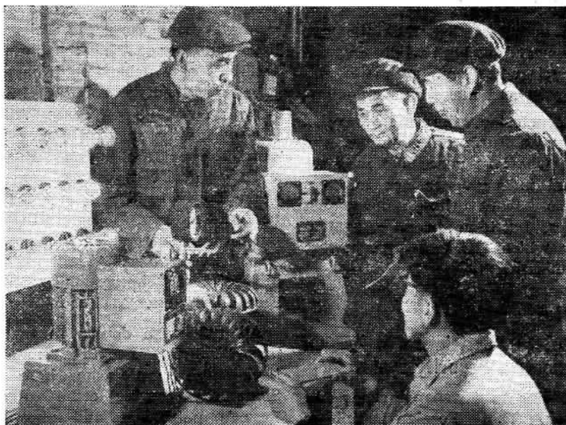
Trial-producing small water-turbine generators.

W HILE a factory in Harbin has turned out a 300,000-kw. water-turbine generating set, the