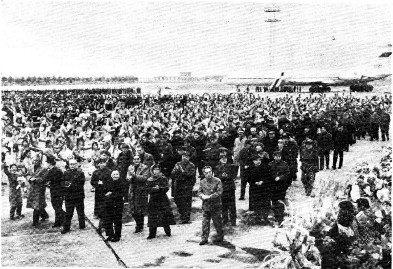
The Chinese Delegation to the special session of the U.N. General Assembly gets a warm send-off at Peking Airport when it leaves for New York.

Peking Airport was decorated with red flags and huge streamers inscribed with "A warm send-off to the