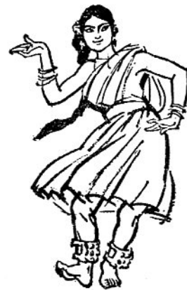
Kathak individual dance.

the tabla added colour to practically all the dance performances. Though the band includes such Western musical instruments as the violin, it sees to it that Pakistan's own national instruments dominate its musical arrangements. What impressed the audience most is that the Pakistan artists set great store by the nation's traditional culture and know best how to make use of it so that the healthy and unadorned national features of their own art can be well preserved.