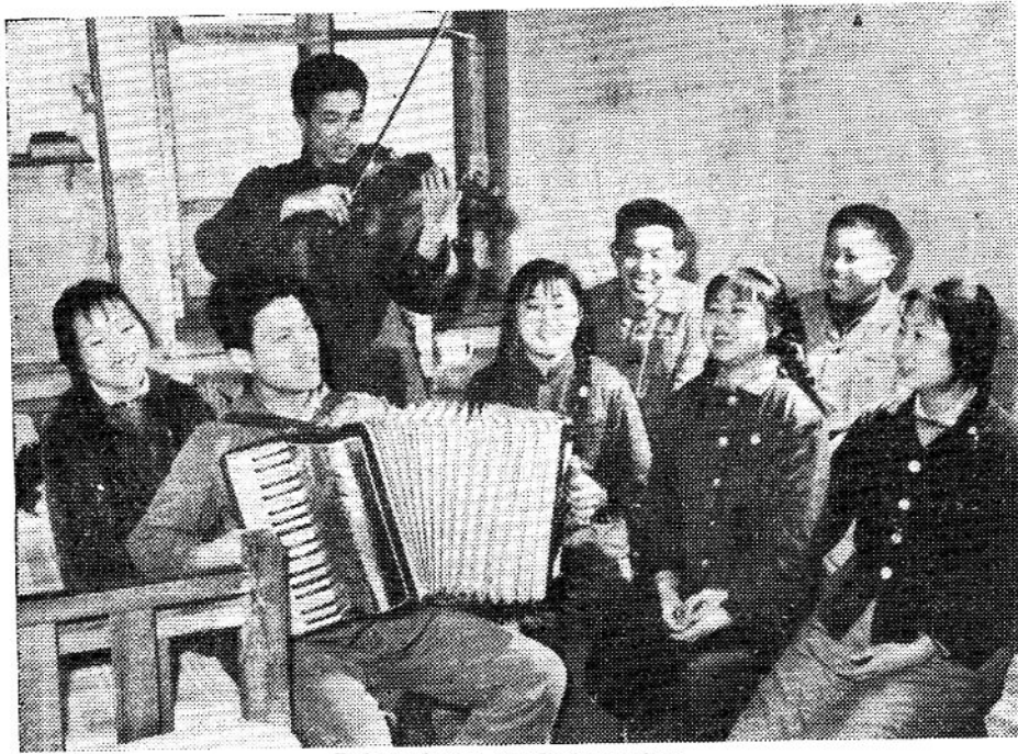
Rehearsing a musical number.