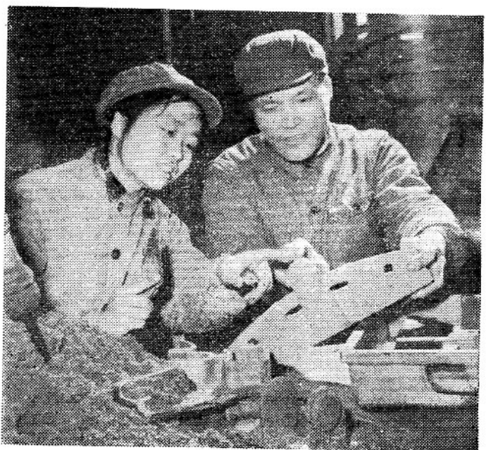
Learning from a veteran worker.

Because of the factory's training programme and the students' diligence, many apprentices can handle machine tools independently even during their appren-