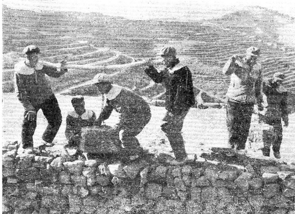
Cadres and members of the Nannao Brigade terracing a field.

building and blasting, for instance. At first, we would drill a vertical hole in the rocks and put in gunpowder to blast them. After doing this many times, we improved, and drilled horizontally into the cracks in the rocks and changed to using TNT. This not only saved labour and powder but was safer and more effective. Carrying out the principle of "practice, knowledge, again practice, and again knowledge," we became quite "clever" and our ability to subdue nature increased. After some 20 days of hard work, we cut a 2.5-kilometre road on the mountain-sides. Now even trucks can drive straight into the village.