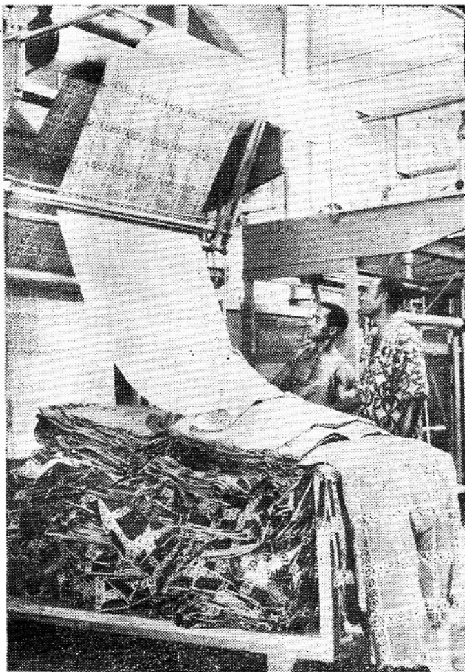
Workers in Douala examining printed fabric.