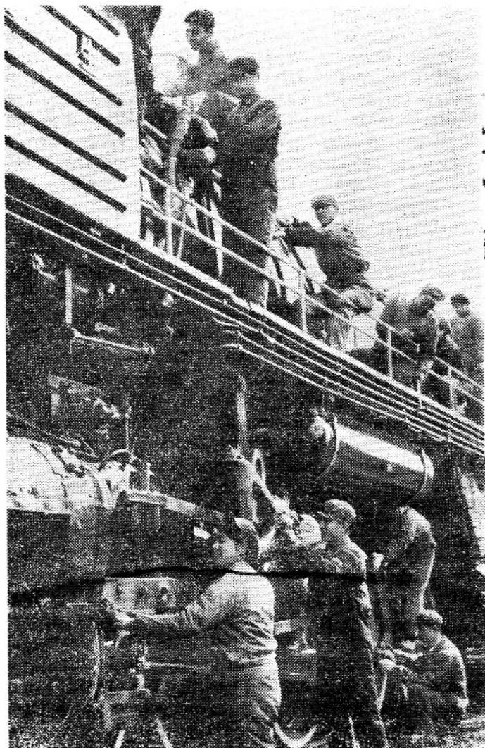
Young workers repairing a locomotive.

Acting on Chairman Mao's teaching "Class struggle is the main subject young people must learn," the committee here organizes class education in various ways