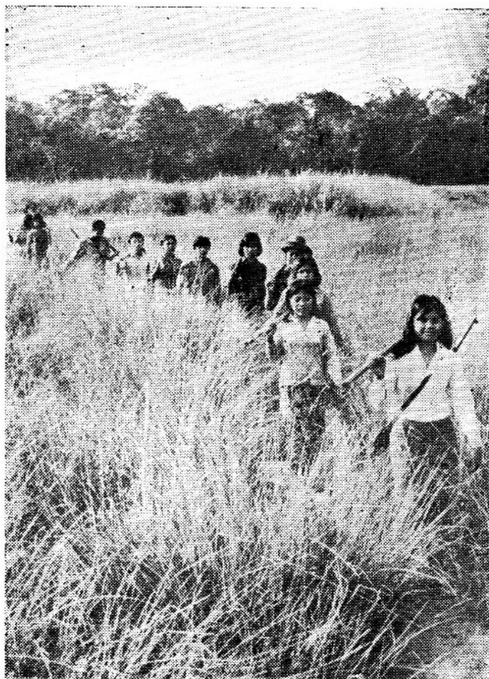
Militiamen and women in the Liberated Zone going to the fields.

After throwing out the traitors, the people there became the masters of the land and forests. They set up mutual-aid teams in production as well as live-stock breeding and timber-selling co-operatives. Bringing into full play the spirit of self-reliance and hard struggle, they built water conservancy projects to raise grain output. They had a good harvest in last year's rainy season and are expecting a bumper one in the current dry season. The Koulen mountainous area today abounds in lichee, pineapple, pepper and plum trees. People's living standards are rising steadily and everywhere there are smiling faces to be seen.