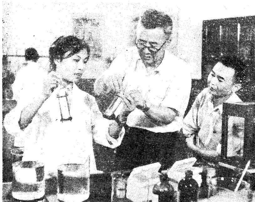
Professor Hua Lo-keng (middle) and the workers trying out the quick method of seeking the best plan in a pharmaceutical plant in Hupeh Province.

Many other mathematicians are also popularizing the method of seeking the best plan. In Peking, those from the Institute of Mathematics of the Chinese Academy of Sciences who are doing research work in applied mathematics and teachers of the mathematics and mechanics department of Peking University and the mathematics department of Peking Teachers' University have lectured on the method's principles in factories and mines under the metallurgical, machine-building, chemical, light and textile industrial departments. With workers and technicians, they have conducted investigations and studies, made experiments and