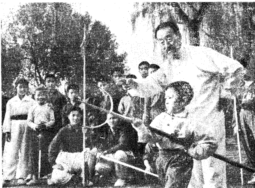
A 68-year-old competitor giving a 6-year-old entrant some tips at the 1972 National Wushu Competition.

Many youngsters performed difficult sets of movements showing a