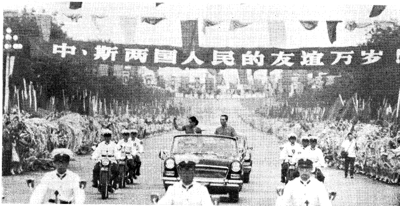
Accompanied by Premier Chou, Prime Minister Bandaranaike waves to the welcoming crowds.

"In recent times," she said, "these ties have been greatly strengthened and enlarged and Sri Lanka has been the recipient of a large and generous volume of economic assistance given on the most liberal terms which are outstanding in the annals of aid to developing countries. In this respect, the Government of China has been faithful to the Eight Principles which it has enunciated as the basis for the grant of aid to foreign countries. Your aid programme has taken the form of credits, outright gifts, participation in joint services and technical assistance. One of its highlights is the construction of the Bandaranaike Memorial International Conference Hall by which you Mr. Prime Minister intended to honour the memory of my late husband. It is an embodiment of his abiding faith in internationalism and the brotherhood of man, as well as a realization of a wish which was dear to his heart that Sri Lanka could some day serve as a meeting ground for the nations of the world. For this gift, I am particularly and personally thankful to you Your Excellency for I remember your spontaneous offer to donate it on your visit to my country in 1964. I hope