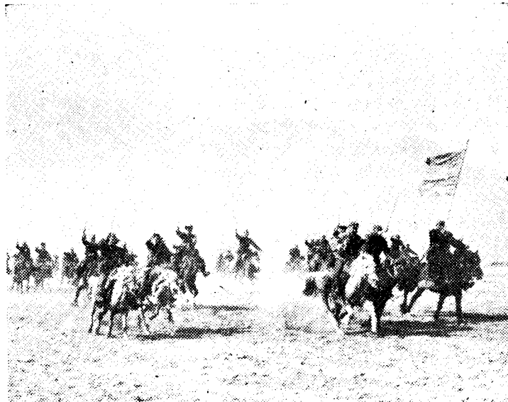
▶ Militiamen of many nation- alities in Sinkiang training.