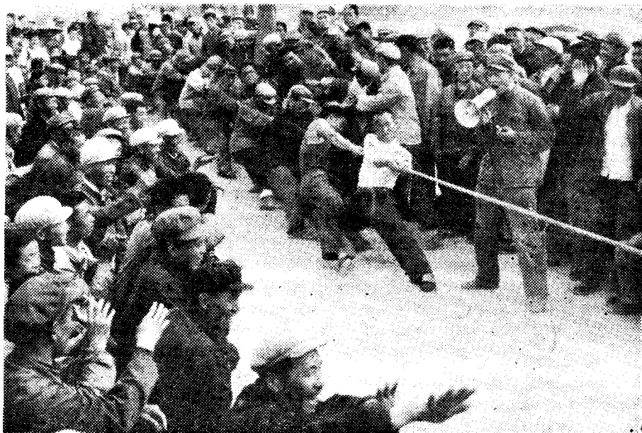
▲ Tug-of-war at a multi-national Sinkiang colliery.