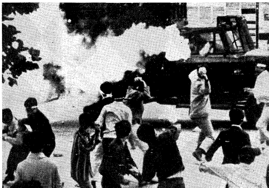
Seoul's university students stone a police van.

Because of the puppet authorities' persecution and suppression of the students, the student movement is going ahead all the more. Student representatives from more than ten universities in Seoul met on October 13 and decided to form a united front for united action. Thus the struggle in which more and more students took part has continued to spread. On October 15, several