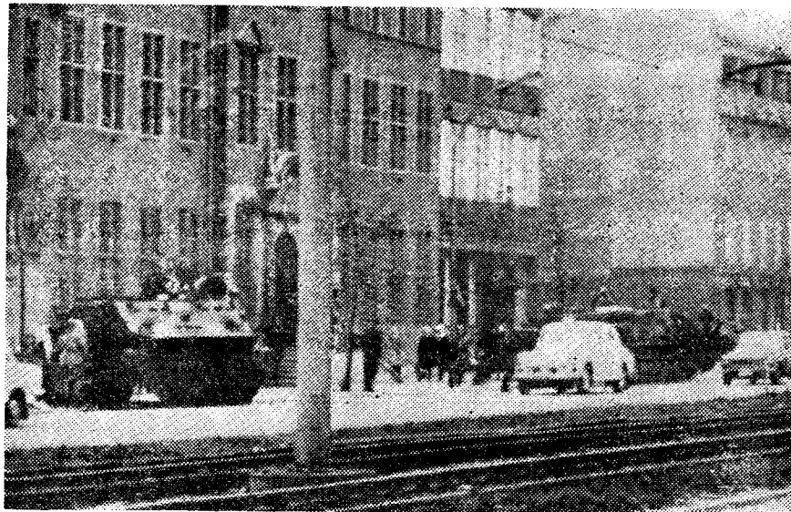
The Polish revisionist authorities bring tanks out on to the streets of Gdansk to open fire on the workers, causing a serious incident of bloodshed.

According to PAP reports, after holding "the Sixth Plenary Session of the Central Committee" on December 14, the Polish United Workers' Party held "the Seventh Plenary Session of the Central Committee" on