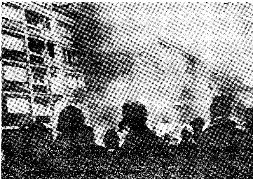
Rising up against the Polish revisionist rule, the revolutionary people in Szczecin angrily set fire to the police headquarters.

After this, the Polish revisionist authorities imposed a curfew on the area of Gdansk, Gdynia and Sopot, cancelled all regular flights to the area, cut off its telephone connections with the outside world, and ordered all foreign vessels in harbour to leave at once. Shouting abuse, the revisionist authorities vilified the demonstrations as the