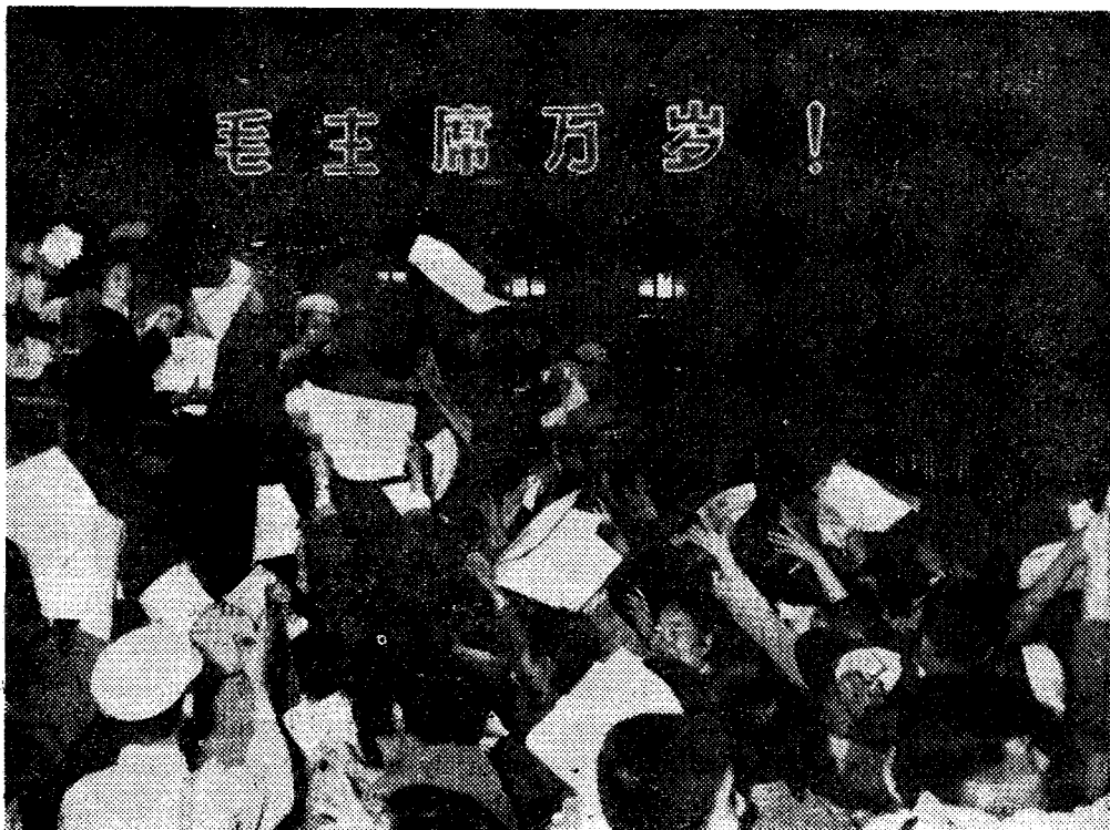
Elated and inspired, the capital's broad masses vie with each other to read the good news about the successful launching of China's first man-made earth satellite.

The revolutionary workers in various parts of the country expressed their determination to learn from the personnel engaged in the research, manufacture and launching of the satellite, hold still higher the great red banner of Mao Tsetung Thought, relentlessly criticize the renegade, hidden traitor and scab Liu Shao-