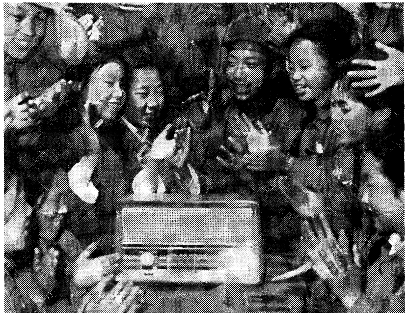
Revolutionary teachers and students of the Peking No. 1 Girls' School are joyfully listening to the announcement of the good news about the successful launching of China's first man-made earth satellite.

The commanders and fighters of the "Linfen Brigade" listened to the broadcast while on a camping exercise in the forest on a mountain. They said: " The East Is Red is the finest melody in the world. The more we listen to it, the more we love Chairman Mao, the firmer our determination to follow Chairman Mao in making revolution." Some fighters sang: "The man-made satellite sails in the East Wind, revolutionary people sing its praises in unison; Mao Tsetung Thought illuminates the space, and the whole world resounds with the strains of The East Is Red ." They expressed the determination to learn from the personnel engaged in the research, manufacture and launching of the man-made satellite and, under the leadership of our great leader Chairman Mao and the leadership of the Party Central Committee with Chairman Mao as its leader and Vice-Chairman Lin as its deputy leader, hold high the banner of unity and victory of the Ninth Party Congress, remain modest and prudent, guard against arrogance and rashness, and strive for new and still greater victories!