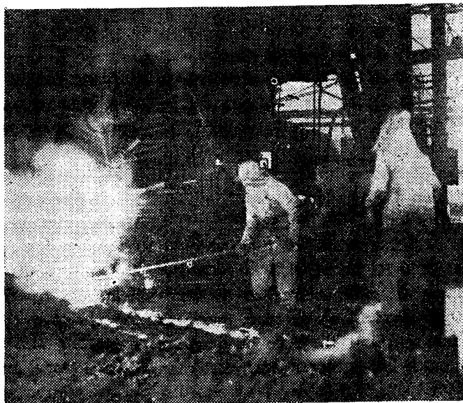
Revolutionary workers of Peking's Shoutu Iron and Steel Company achieve new successes in the socialist revolutionary emulation drive. Photo shows iron-smelting workers working in front of a furnace.

In an effort to deepen the struggle-criticism-transformation, the company has on several occasions chosen representatives and sent them to the six plants and the two universities in Peking to study with open minds their advanced experience in the living study and application of Mao Tsetung Thought and in conscientiously carrying out the tasks of struggle-criticism - transformation. Carrying the revolutionary mass criticism to a new high tide recently, the company's workers have dealt heavy blows to a handful of class enemies, raised their own consciousness of class struggle and the