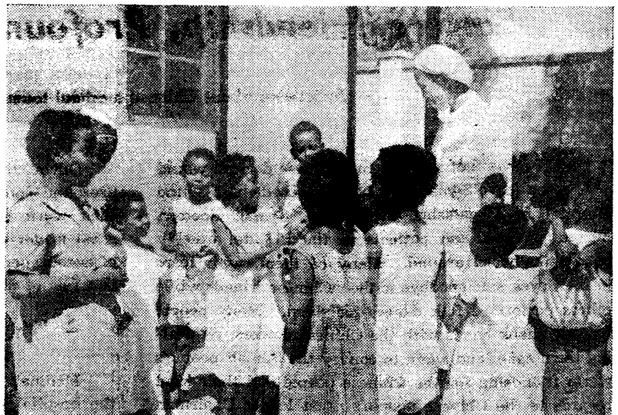
Chinese medical worker in Martino Hospital with Somali children