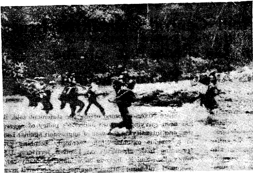
Pursuing the enemy, Laotian People's Liberation Army fighters cross river to wipe them out.

tionary Vientiane authorities and bandit chieftain Vang Pao have used massive troops since mid August 1969 to undertake a wild military adventure and launch a large-scale "nibbling" attack against the Plain of Jars-Xieng Khoang region. They carried out the brutal fascist policy of "burn all, kill all and destroy all" wherever they went, leaving the invaded territory in ruins. Large numbers of innocent people were massacred, thousands thrown into concentration camps and hundreds of temples and schools and hospitals destroyed. U.S. imperialism and its lackeys are trying to stamp out the raging flames of the Laotian people's revolution by massacre. However, as our great leader Chairman Mao has taught us: "All reactionaries try to stamp out revolution by mass murder, thinking that the greater their massacres, the weaker the revolution. But contrary to this reactionary wishful thinking, the fact is that the more the reactionaries resort to massacre, the greater the strength of the revolution and the nearer their doom. This is an inexorable law." "Their [the reactionaries'] persecution of the revolutionary people only serves to accelerate the people's revolutions on a broader and more intense scale."