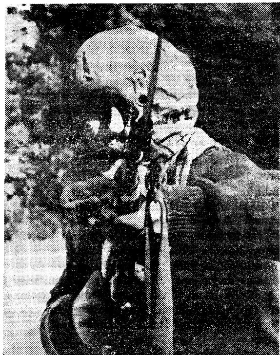
A young guerrilla of the "Al Assifa" commandos led by Al Fatah in bayonet-training.