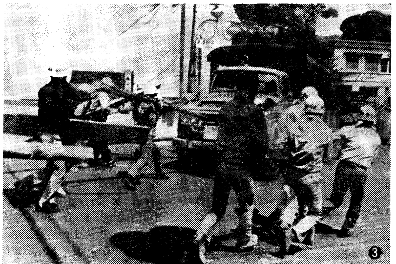
3 Students use beams to smash a police van.