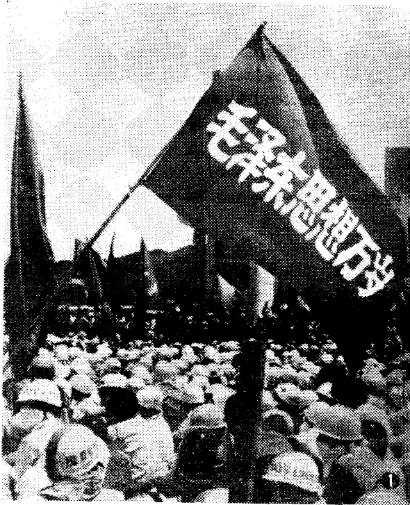
1 Holding aloft the red banner "Long live Mao Tseitung Thought," dauntless Japanese workers and students take part in a rally against the U.S.-Japanese reactionaries.

Japanese workers and students on June 8 staged another massive demonstration in Ito, a city not far from Tokyo, to show their strong opposition to the fourth ministerial meeting of the U.S.-manufactured "Asian and Pacific Council." They firmly opposed the Japanese reactionaries' leading role in this anti-communist and anti-China organization. They condemned the U.S. imperialists' policies of anti-communism, hostility to China, and aggression in Asia.