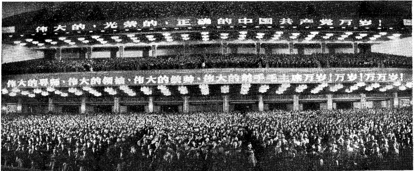
Holding high their copies of Quotations From Chairman Mao Tsetung, the revolutionary fighters at the reception cheer with great elation: "We wish Chairman Mao a long, long life!"