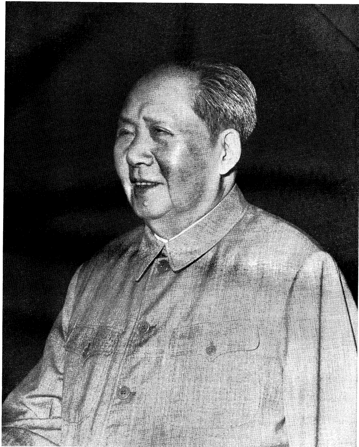
Our most beloved and respected great leader Chairman Mao receiving more than 10,000 revolutionary fighters from various parts of the country on May 19