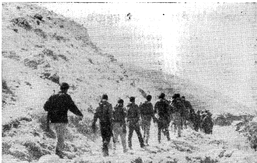
Valiant Palestinian guerrillas on a combat mission

The armed struggle of the Palestinian people has boosted the revolutionary militant mood of the entire