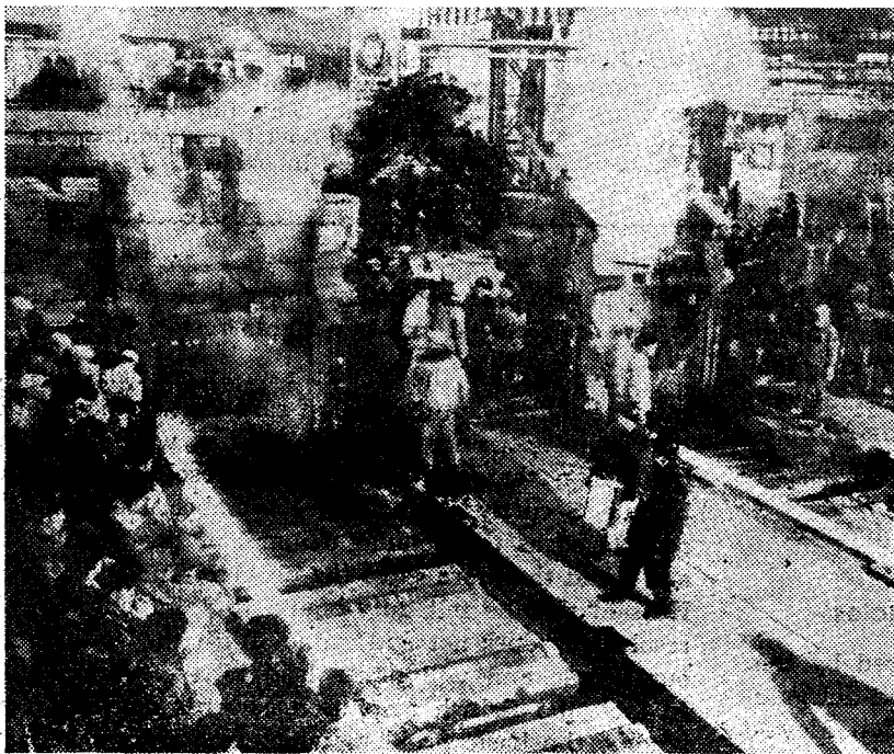
Representatives from all over China see how production is going on in a workshop in the rail-beam mill of the Paotow Iron and Steel Company.

During the great proletarian cultural revolution, the building workers, holding aloft the great revolutionary banner of Chairman Mao's "It is right to rebel against reactionaries," launched fierce attacks on the big renegade Liu Shao-chi and his agents in the metallurgical field and seized back that portion of power they had usurped. In accordance with Chairman Mao's teaching to "grasp revolution and promote production," they showed great production enthusiasm which had burst forth during the great cultural revolution and greatly speeded up construction of the mill. Encouraged by one of Chairman Mao's latest instructions "The working class must exercise leadership in everything" and the Communiqué of the Enlarged 12th Plenary Session of the Party's Eighth Central Committee, they revised their work schedule four times to shorten the construction period. As a result, the mill went into successful trial operation on December 26, 1968, 12 months ahead of schedule. The workers took only some four months to complete the in-