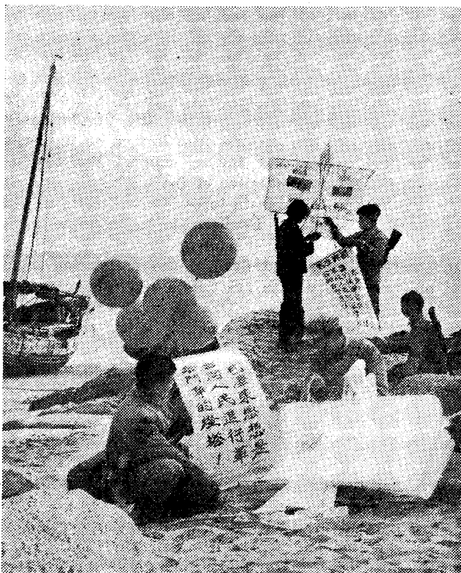
Using balloons and kites, militiamen on Hsiao-teng Island send messages, quotations from Chairman Mao and copies of Selected Works of Mao Tse-tung to the enemy-occupied islands. The characters on one message (foreground) say "Mao Tse-tung's thought is the beacon for our Taiwan compatriots in waging their revolutionary struggle."