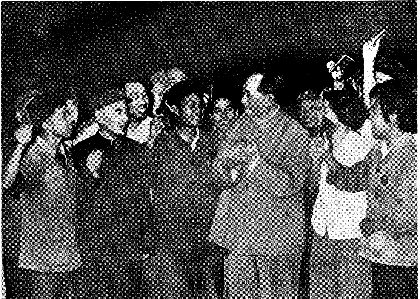
Chairman Mao and his close comrade-in-arms Vice-Chairman Lin Piao with workers and P.L.A. men present at the reception

O UR great leader Chairman Mao and his close comrade-in-arms Vice-Chairman Lin Piao and Comrades Chou En-lai, Chen Po-ta, Kang Sheng, Li Fu-chun, Chiang Ching, Chang Chun-chiao, Yao Wen-yuan, Hsieh Fu-chih, Huang Yung-sheng, Wu Fa-Hsien, Yeh Chun, Wang Tung-hsing and Wen Yu-cheng on August 15 received represent-