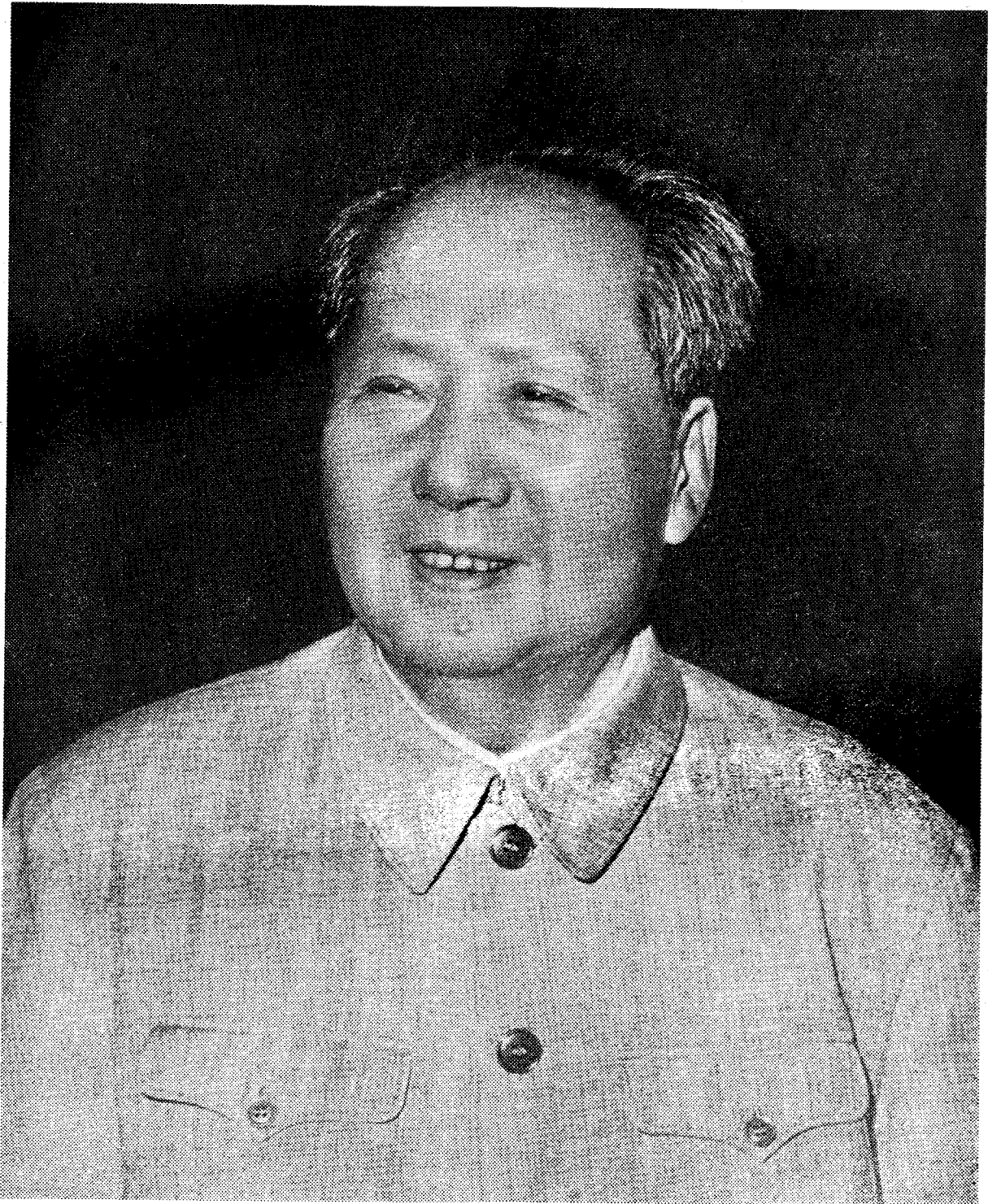
Our most respected and beloved great leader Chairman Mao, smiling and in high spirits, received on August 15 representatives of Peking workers and P.L.A. commanders and fighters amid enthusiastic cheers.