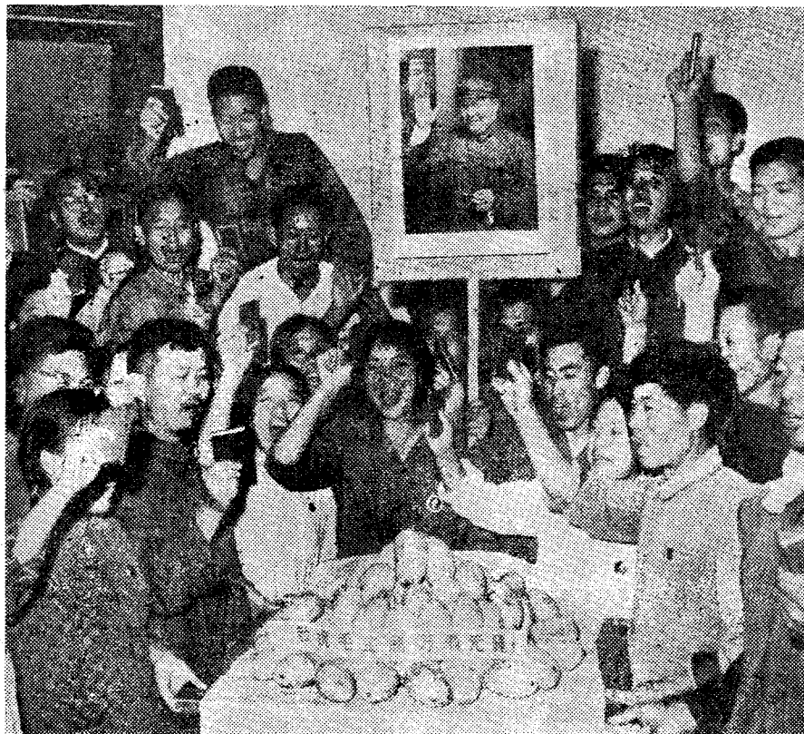
Revolutionary fighters of the propaganda team gather around the treasured gift sent them by Chairman Mao and rousing cheer "Long live Chairman Mao!"

Four veteran workers from the Peking Hsinhua Printing House sang songs they themselves had composed specially for the occasion, expressing their