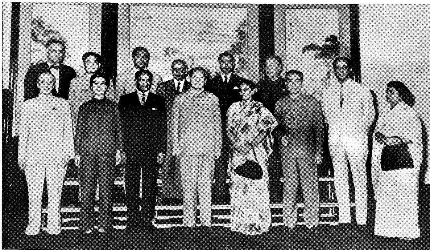
Our great leader Chairman Mao receives Foreign Minister Arshad Husain, his wife and his party.

O UR most respected and beloved great leader Chairman Mao received Pakistan Foreign Minister Arshad Husain and his wife on August 5.