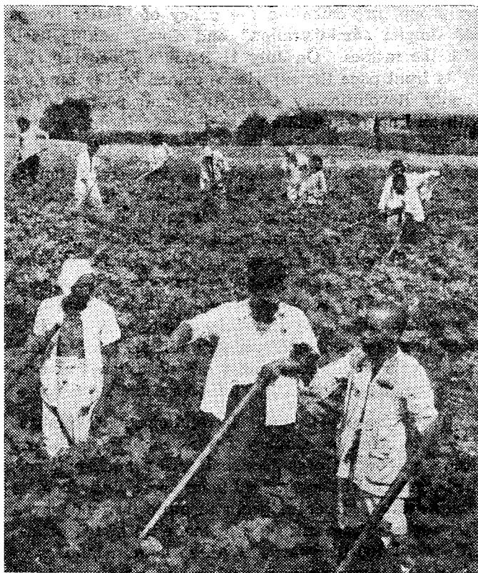
A leading member of the Lingpao County Revolutionary Committee (middle foreground) joins the poor and lower-middle peasants in farm work.

With the administrative structure of the county revolutionary committee simplified, the leading cadres also improved their style of work. They frequently went to the different sections and the grass-roots units to settle problems on the spot. They worked everywhere — under the trees, on the banks of the irrigation canals, in the office as well as in the streets — wherever the people sought them out and comrades wanted to consult them, and gave the latter replies and solutions.