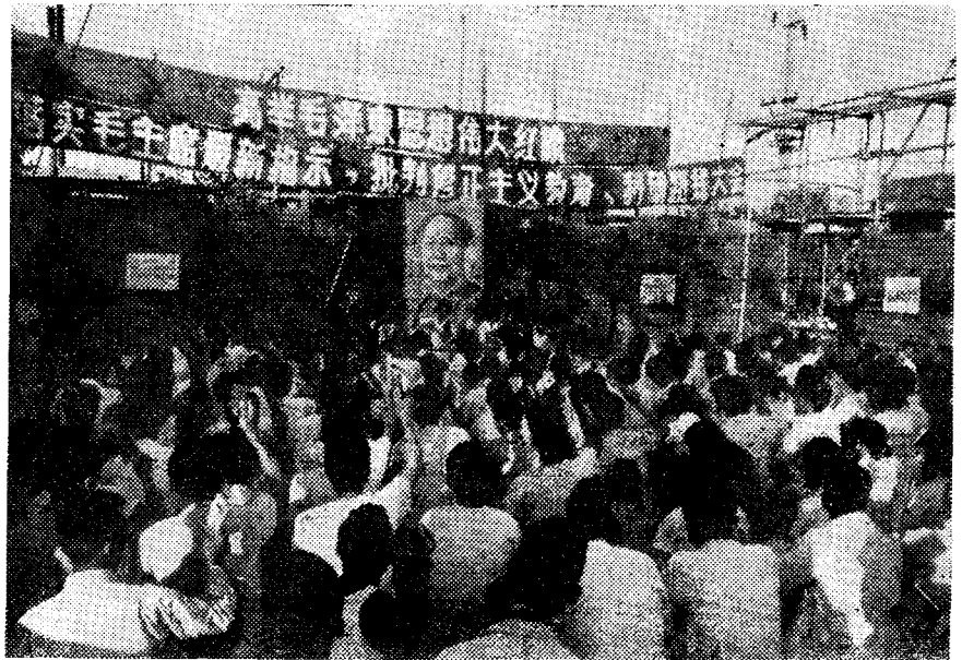
Using Mao Tse-tung's thought as their weapon, revolutionary teachers and students of Tongji University in Shanghai join workers and designers on a construction site to criticize and repudiate the revisionist lines in education and scientific research.

It was again the Party and Chairman Mao who sent me to study in middle school and college. After graduating from college in 1962, I returned to the mill where I had worked. Following Chairman Mao's teaching, I have never divorced myself from labour, from reality or from the masses. This has not only enabled me to apply to production the theoretical