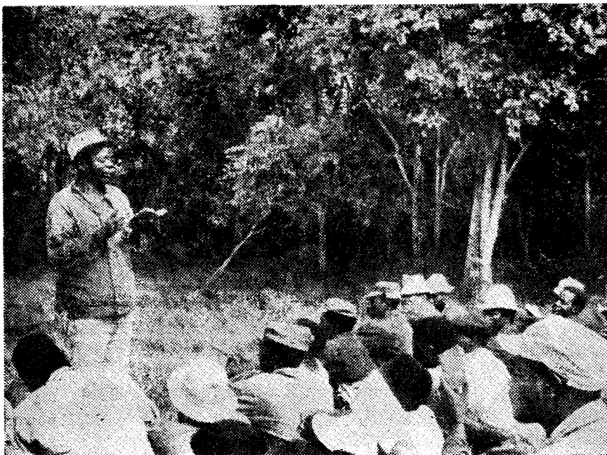
Mozambique guerrilla fighters studying Quotations From Chairman Mao Tse-tung.

Chairman Mao has said: "The revolutionary war is a war of the masses; it can be waged only by mobilizing the masses and relying on them." The guerrilla fighters have paid special attention to relying on the