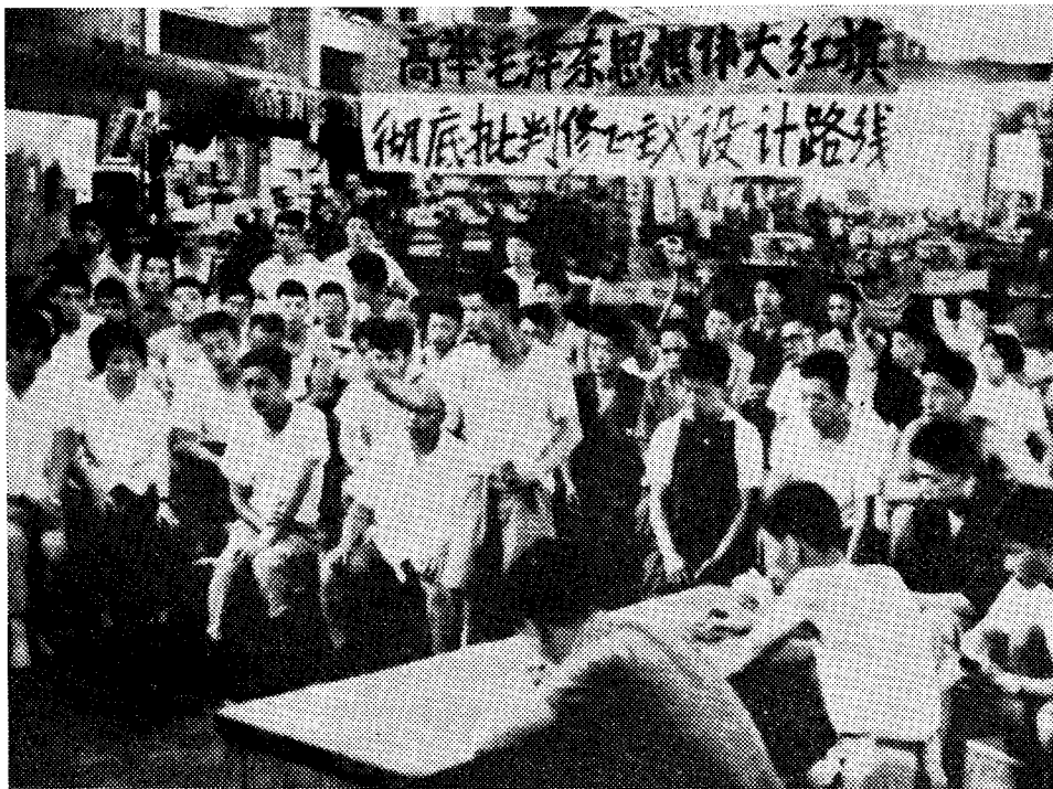
Revolutionary technicians of the Shanghai Machine Tools Plant, together with their worker colleagues, denouncing the revisionist line in designing.

Prior to the great cultural revolution, the handful of capitalist roaders in the Party and reactionary technical "authorities" rabidly barred the workers from undertaking designing. Around 1958, a number of workers were promoted to be technicians. But the reactionary "authorities" in the plant one after another removed quite a number of them from the designing department on one pretext or another. Technical personnel of worker origin, nevertheless, broke through one obstacle after another and demonstrated their immense wisdom and creative power. Of the new products designed and successfully trial-produced by the plant since 1958, those