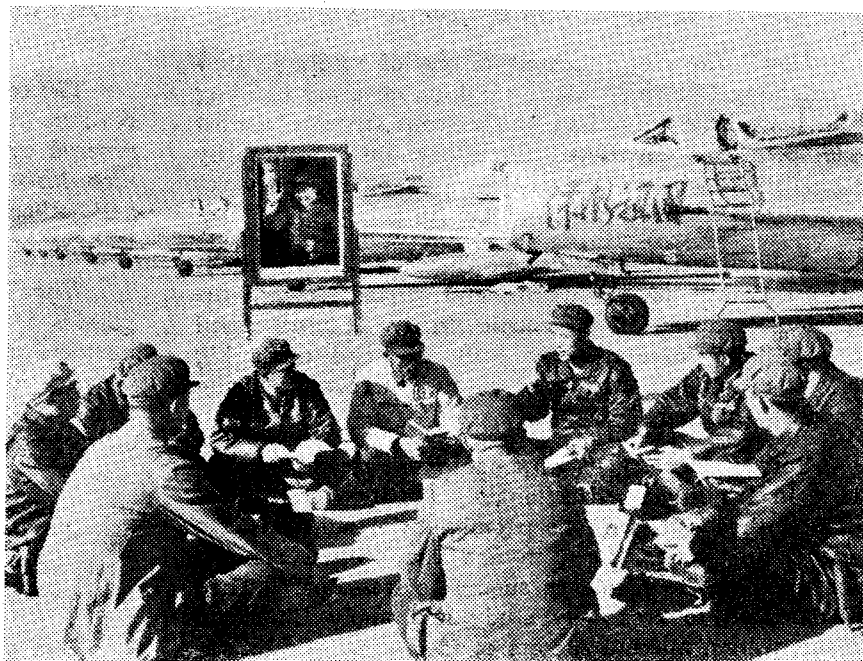
Airmen discussing their experience in using Mao Tse-tung's thought to direct air battles.

During the great proletarian cultural revolution, this unit, together with many other fraternal units, smashed the "convention" of directing battles solely on a basis of technique and data, and conducted flight training and waged battles under the direct guidance of Chairman Mao's brilliant instructions. They selected some 200 quotations from Chairman Mao's works in the light of the ideas current among the airmen and the needs of training, and studied and applied them every day as the soul in commanding flight training. Facts have proved that using the great thought of Mao Tse-tung to command and direct flights, enables the courage and wisdom of man and the airmen's techni-