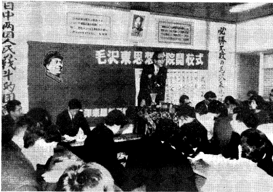
Inaugural ceremony of the Institute of Mao Tse-tung's Thought in Japan

democracy and peace and forge ahead bravely, no matter how violent the storms in the future.