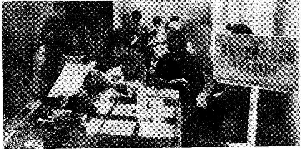
Revolutionary fighters of the Japanese Haguruma Theatre studying Chairman Mao's Talks at the Yen-an Forum on Literature and Art in the place where the forum was held in 1942

The Japanese comrades spoke with emotion: "We know the great truth that political power grows out of the barrel of a gun. Without armed struggle, China could not have won victory in her revolution. The same is true of Japan today. Chairman Mao pioneered the road of the Chingkang Mountains. It is the road of liberation for Japan, too. The revolutionary spirit of the Chingkang Mountains will for ever encourage the Japanese people in their march forward." Many of them took bamboo spikes, similar to those used in the mountains by the Red Army in defence against the enemy, as souvenirs.