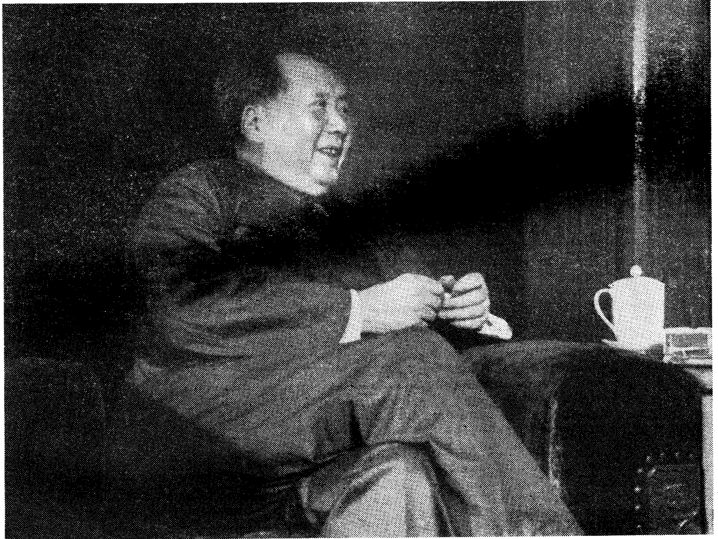
Chairman Mao Tse-tung

Our great teacher, great leader, great supreme commander and great helmsman