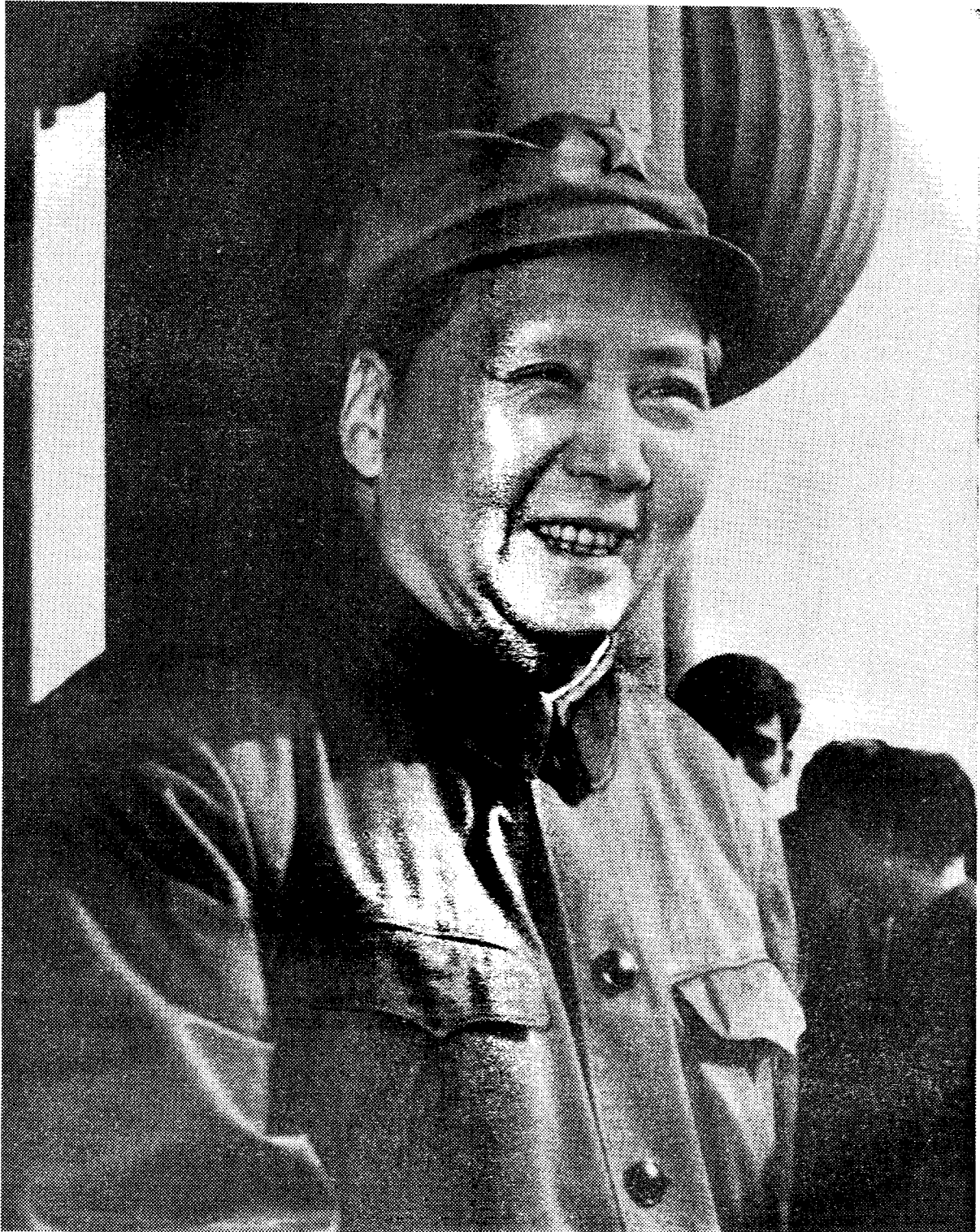
Chairman Mao Tse-tung

Our great teacher, great leader, great supreme commander and great helmsman