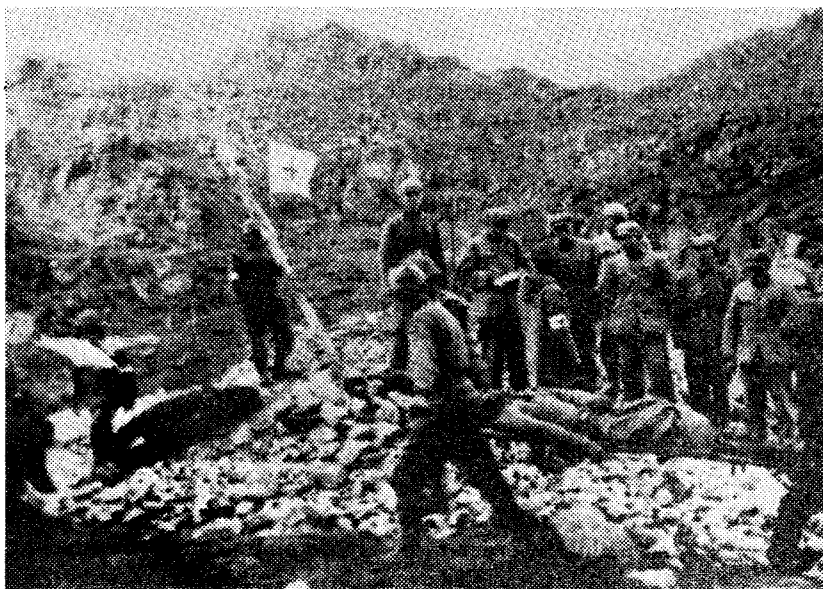
After receiving the 14 bodies and signing a list in acknowledgement, the Indian personnel carry the bodies away from China's territory.