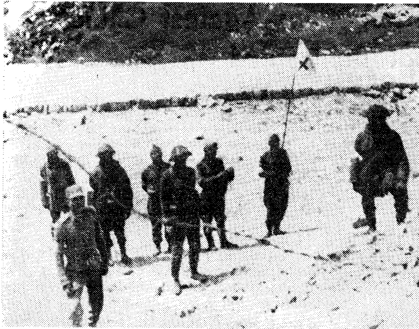
On the afternoon of September 16, flying a Red Cross flag as required, 13 Indian personnel led by Major K.V. Chankrag, who represents the Indian side, went to the place designated by the Chinese side to receive Indian arms and ammunition and bodies of Indian troops killed by Chinese frontier guards when they intruded into Chinese territory.