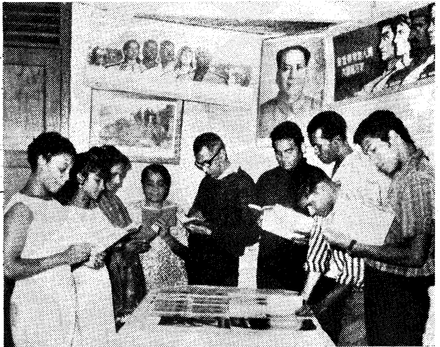
Mauritius youth reading Chairman Mao's works

He said that in these two great works, Chairman Mao has criticized the viewpoints that under given historical conditions, there are only contradictions between the enemy and ourselves and no contradictions among the people, or only contradictions among the people and no contradictions between the enemy and ourselves.