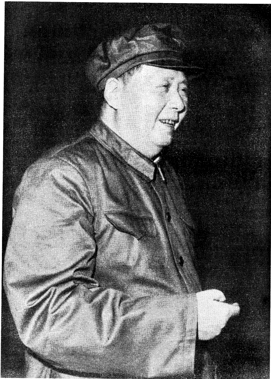
Chairman Mao Tse-tung

Our great teacher, great leader, great supreme commander and great helmsman