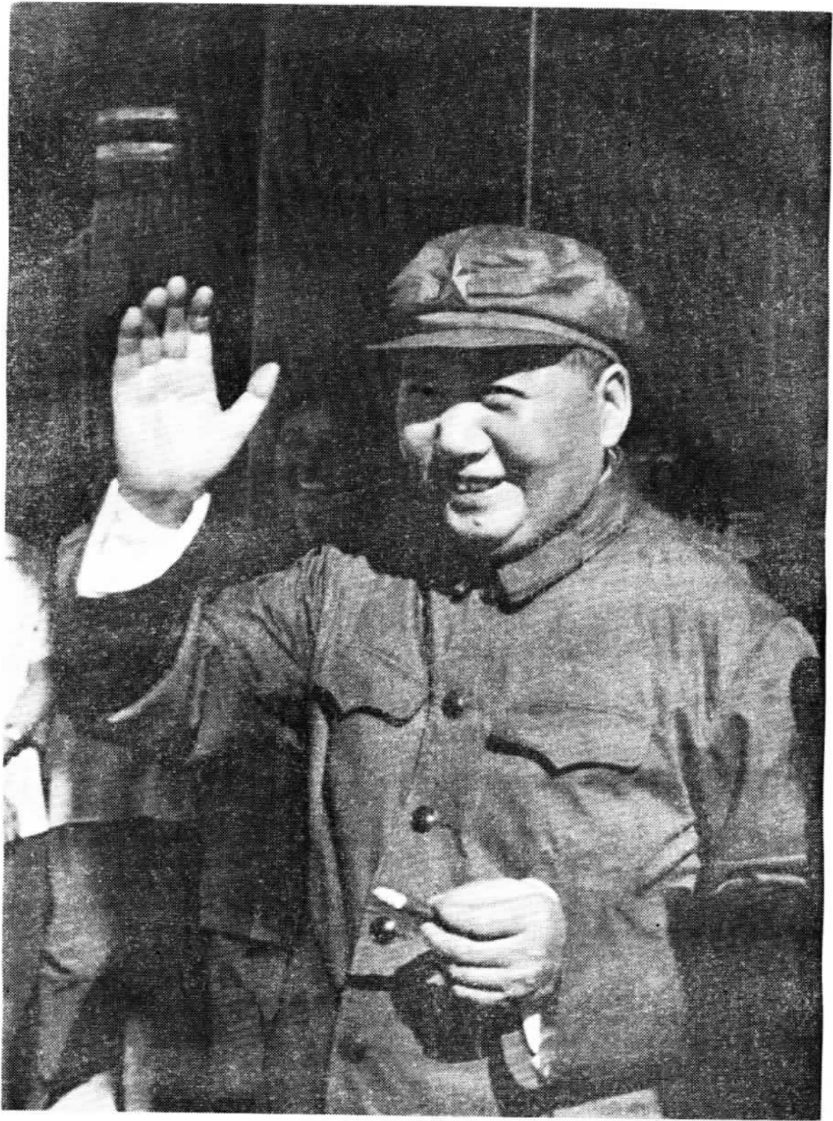
Chairman Mao Tse-tung

Our great teacher, great leader, great supreme commander and great helmsman