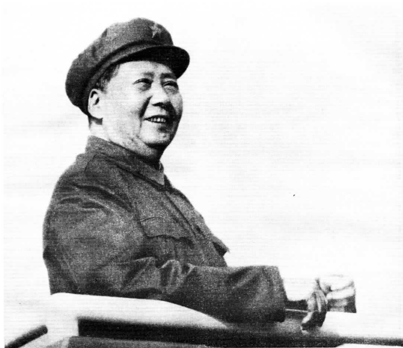
Chairman Mao Tse-tung

Our great teacher, great leader, great supreme commander and great helmsman