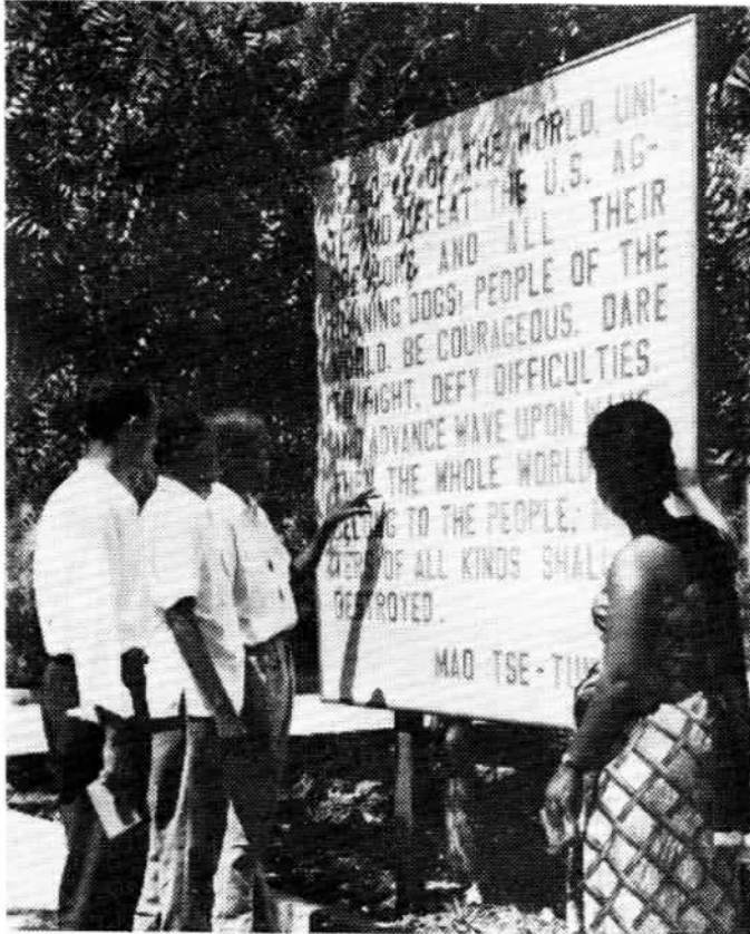
Somali youth reading a paragraph of Quotations From Chairman Mao Tse-tung

But less than 40 years after the establishment of the first dictatorship of the proletariat, and less than 15 years after it had so strikingly proved its superiority at Stalingrad, that turning point in world history, a political blight hit the Soviet Union in the shape of