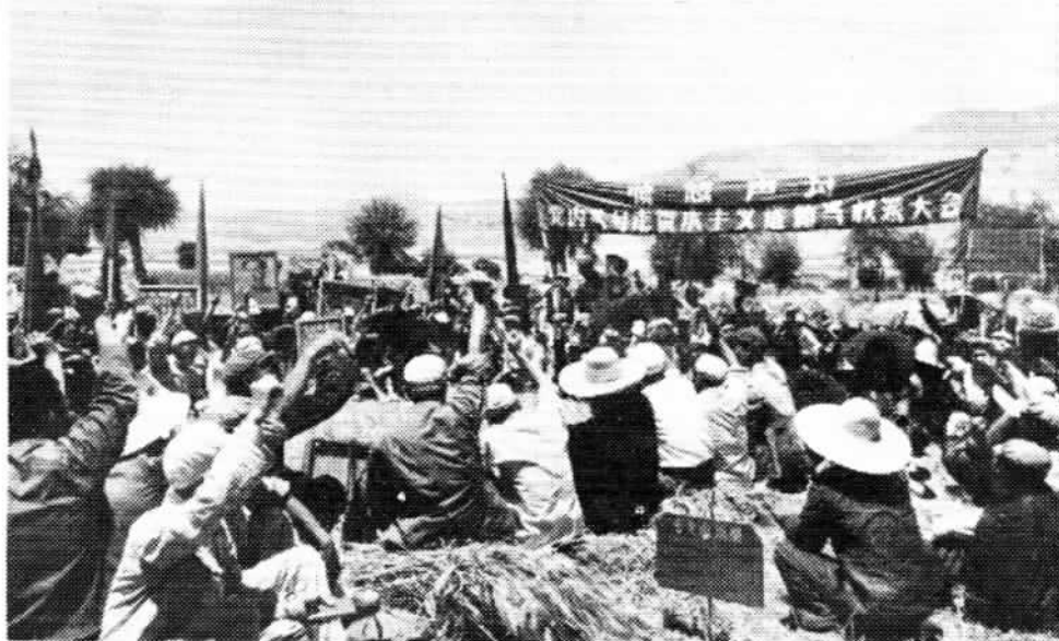
Commune members of the Hsunhua Sala Nationality Autonomous County, Chinghai Province, meet during a break in field work to denounce the towering crimes committed by the top Party person in authority taking the capitalist road

A widespread mass movement for criticizing and repudiating the sinister line in literature and art and its chief backer, China's Khrushchov, is stirring literary and art circles. Revolutionary teachers and students in the Shanghai Conservatory have started an intensive criticism of that big poisonous weed, the violin concerto Liang Shan-po and Chu Ying-tai which was hailed as a "model of a national and mass style" by both big and small capitalist roaders.