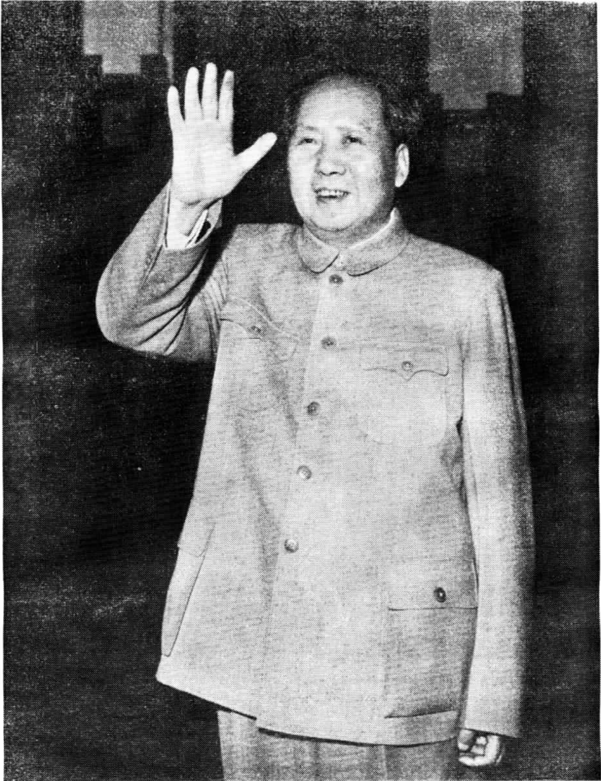
Chairman Mao Tse-tung

Our great teacher, great leader, great supreme commander and great helmsman