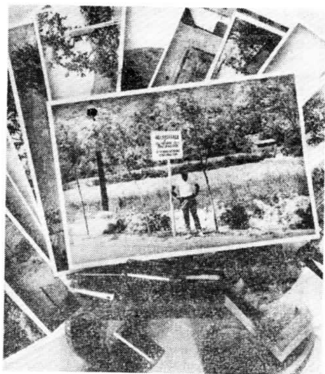
Photographs surreptitiously taken by the Indian spy Raghunath

Exposing the innumerable crimes of these foreign reactionary elements, the spokesman said that they were snooping around with ulterior motives, surreptitiously photographing, copying and stealing big-character posters; resorting to all kinds of sinister methods to collect large numbers of materials such as papers, journals, pamphlets and leaflets put out by the various Chinese revolutionary mass organizations; probing for inside information from our masses by posing as personnel from friendly countries; sneaking into our Party and government departments, people's organizations, schools and enterprises by posing as Chinese; and even