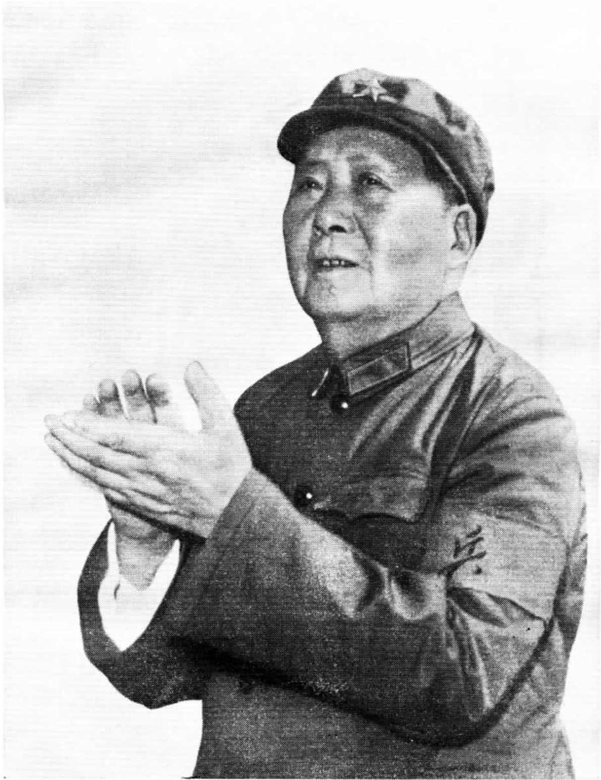
Chairman Mao Tse-tung

Our great teacher, great leader, great supreme commander and great helmsman