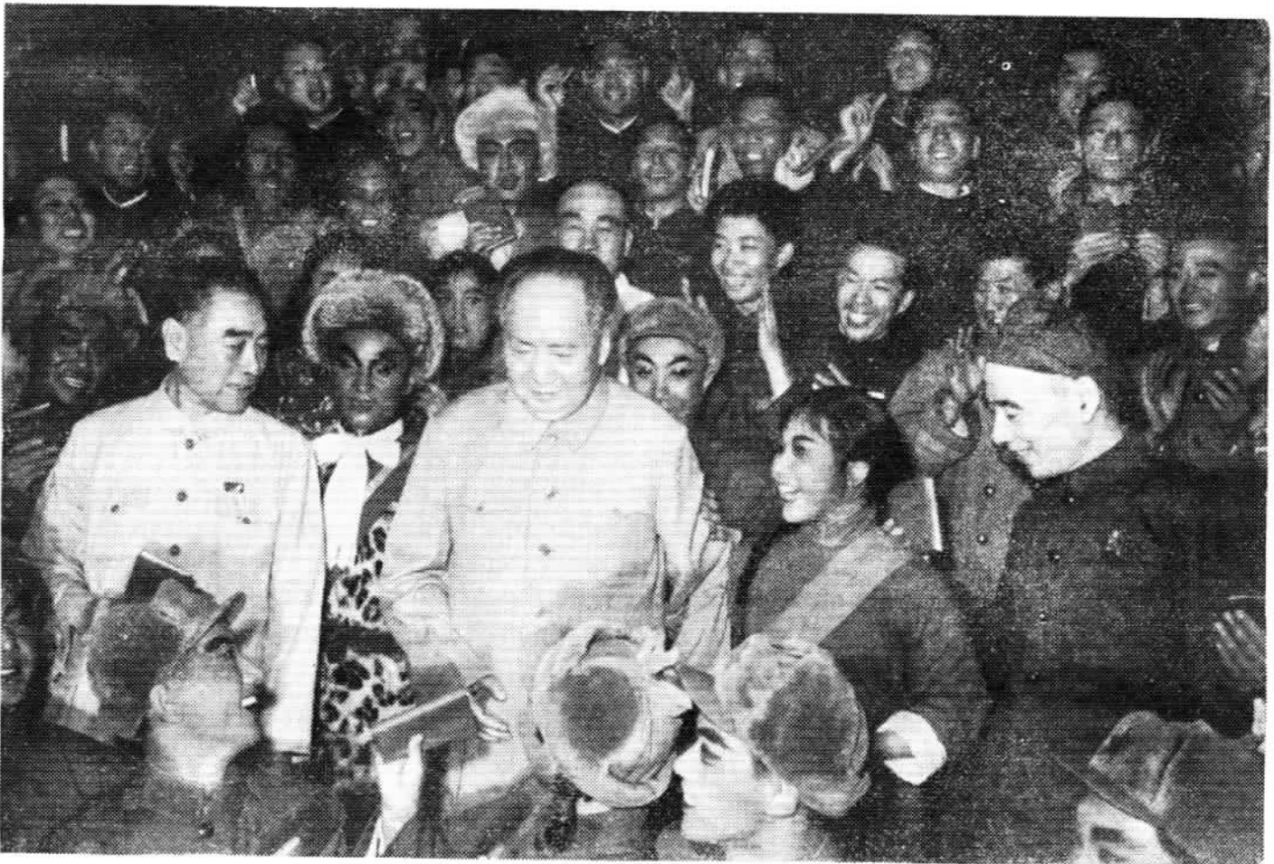
Chairman Mao and his close comrade-in-arms Comrade Lin Piao and Comrade Chou En-lai with the actors and actresses.

Our most respected and beloved great leader Chairman Mao and his close comrade-in-arms Comrade Lin Piao saw Taking the Bandits' Stronghold , a revolutionary Peking opera on a contemporary theme presented by the Peking Opera Theatre of Shanghai on the evening of June 16.