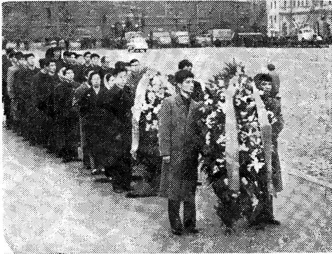
Left: Despite obstruction from the Soviet authorities, Chinese students in the Soviet Union file across the Red Square to place wreaths at the Mausoleum of Lenin, the great leader and teacher of the proletariat, and on the tomb of Stalin, the great Marxist-Leninist