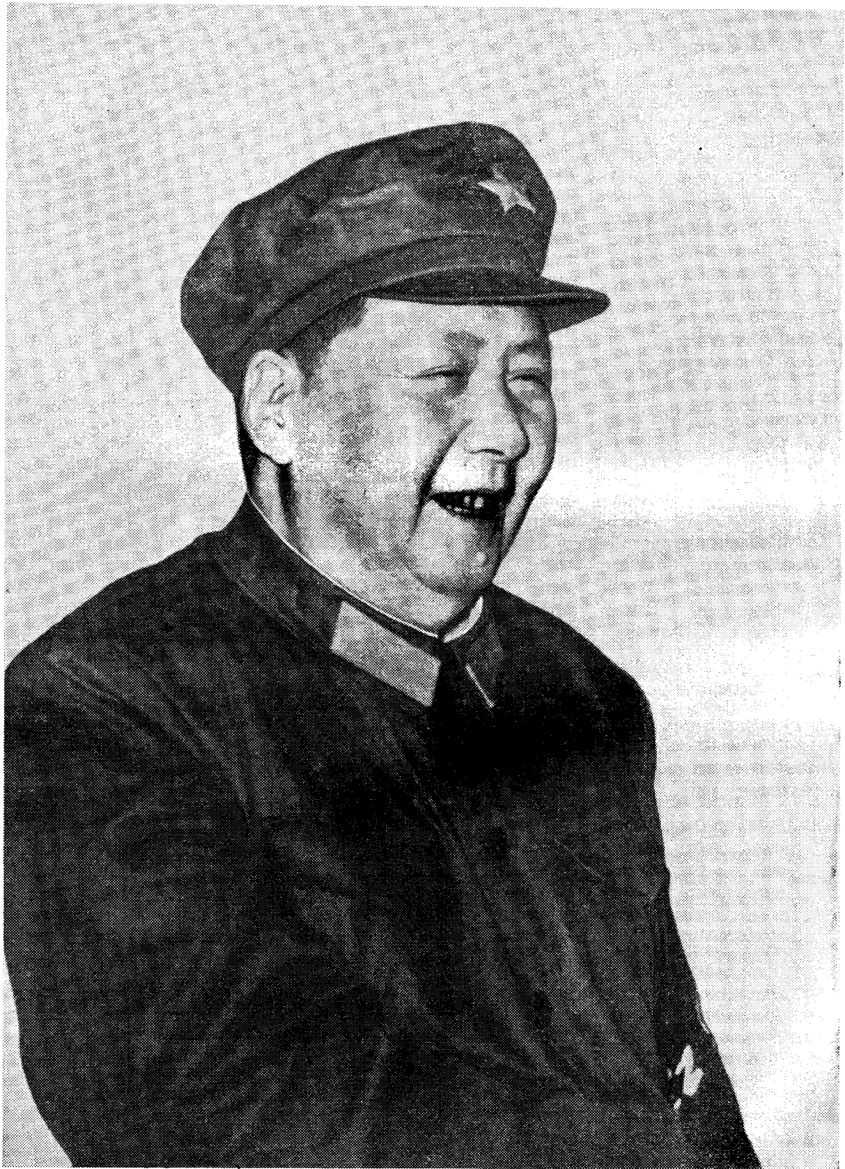
Chairman Mao Tse-tung

Our great teacher, great leader, great supreme commander and great helmsman