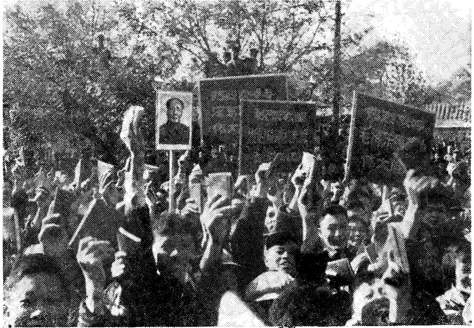
The revolutionary masses in the capital come to the reception centre of the Party's Central Committee and the State Council to extend their congratulations

When they got the happy news, commanders and fighters in the land, sea and air forces of the Chinese